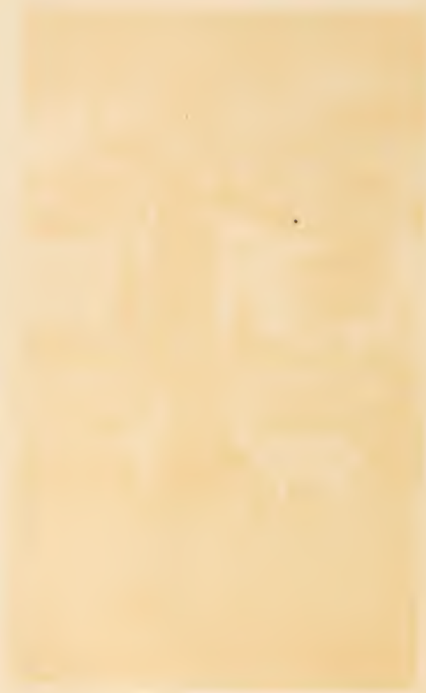
Faint text centered below the image, likely a caption or title.