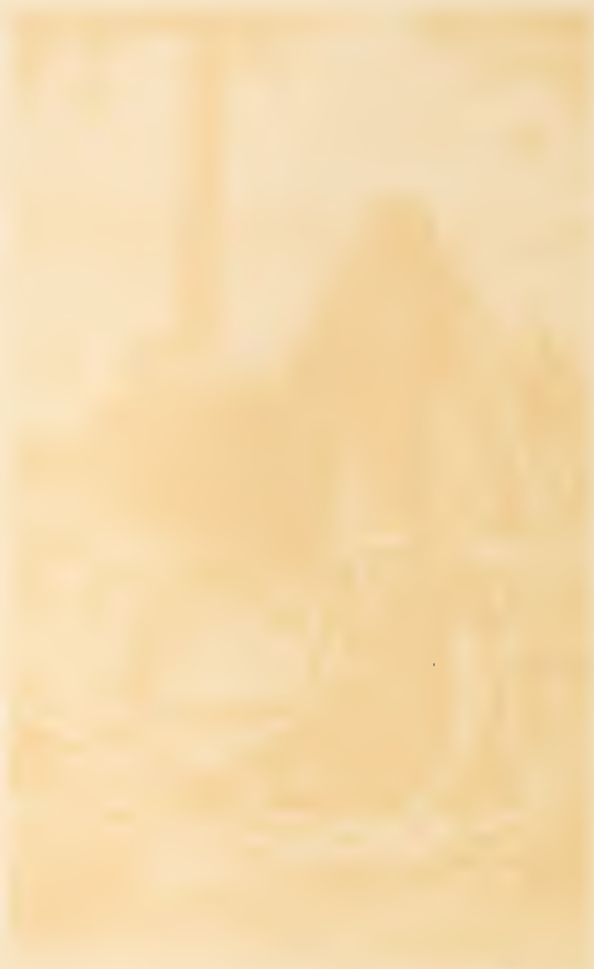
View of the [illegible]