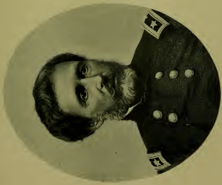
JOHN C. FRÉMONT.