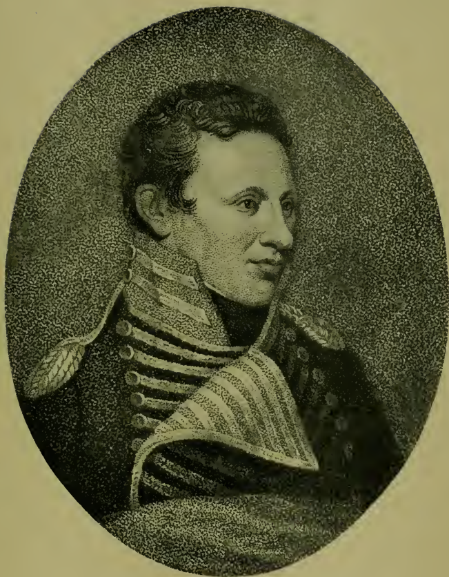
ZEBULON M. PIKE.