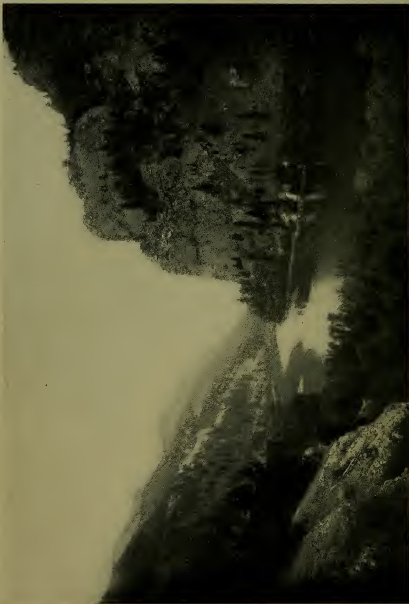
GATES OF THE ROCKY MOUNTAINS.

So called by Lewis and Clark, who passed them July 19, 1805. The Missouri River is here confined by a spur of the Big Belt Mountains.