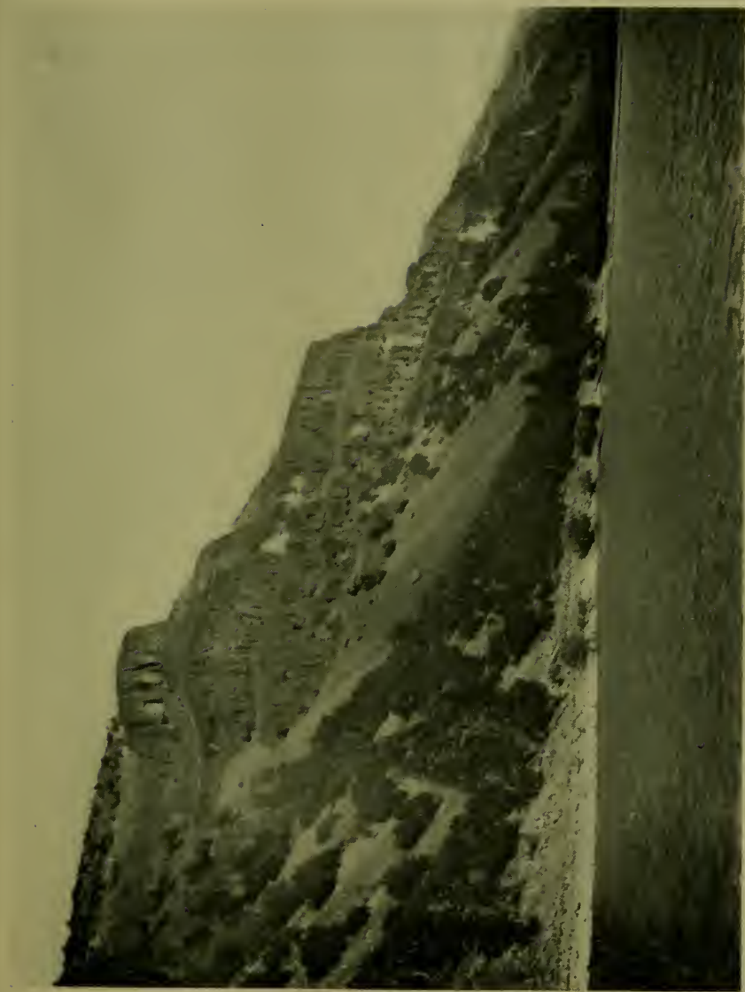
GRANT'S CASTLE, ON COLUMBIA RIVER.

Passed by Lewis and Clark in October, 1805.