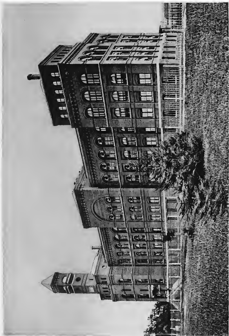
Bureau of Engraving.