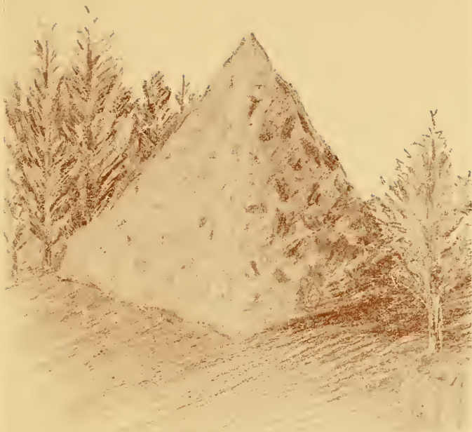
Pyramid to the First Law Giver, Moses. Erected by Joaquin Miller.

As we follow His commandments so shall our peace be And in wise obedience find true liberty.