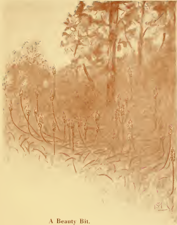
A Beauty Bit.

Bending blue of benediction; Fantasy of leaf and fern. Mid sun-mist incense on earth's altar The candles blossom, blaze and burn.