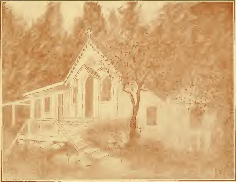
Joaquin Miller's "Abbey."

Crescent, cross and rays of the sun— All symbols of the eternal One.