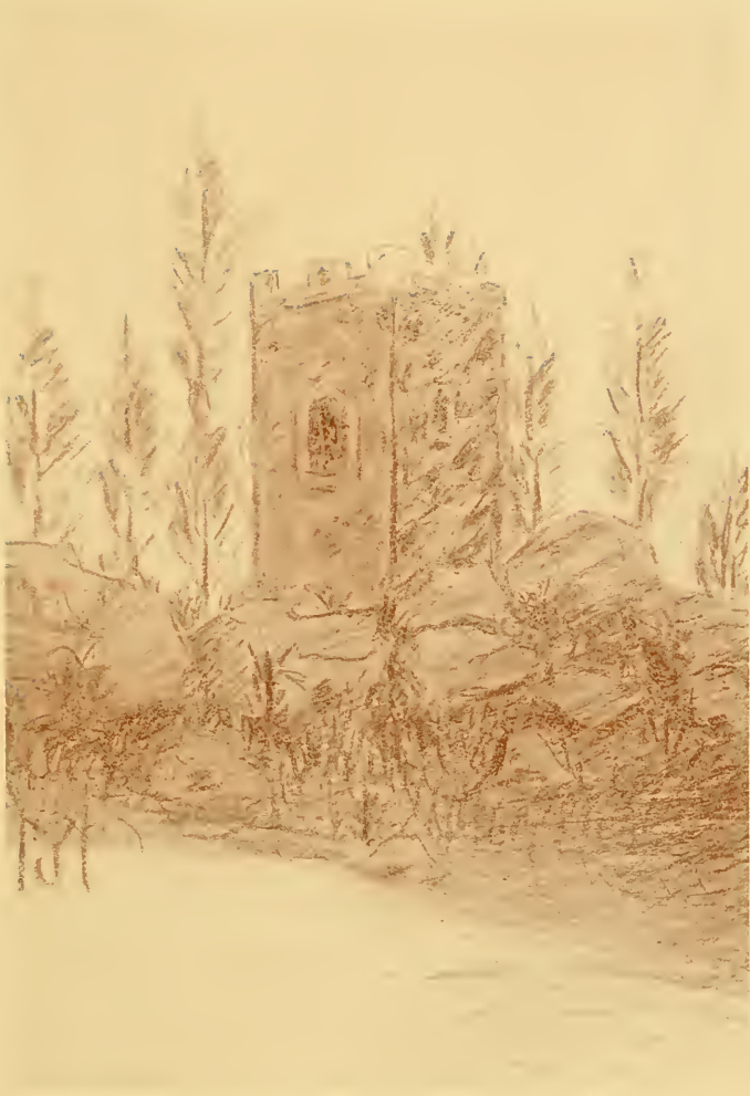
Erected to John C. Fremont by Joaquin Miller.

From where the pathfinder saw the sun sinking in golden splendor at the strait And so called it "The Golden Gate."