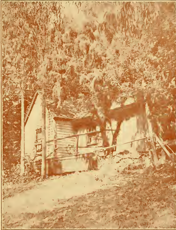
The Guest Cottage.

Where artists followed their favorite muse And came and went as fate might choose.