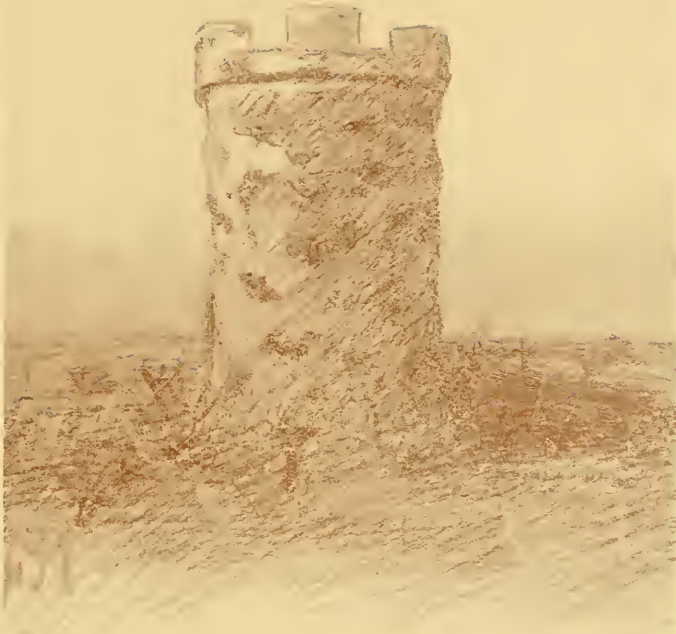
Tower to Robert Browning. Erected by Joaquin Miller.

Sensitive "Poet of the Soul" Leading us ever to a sacred goal Where dwell the spirit people of the brain And where "Childe Roland to the dark tower came."