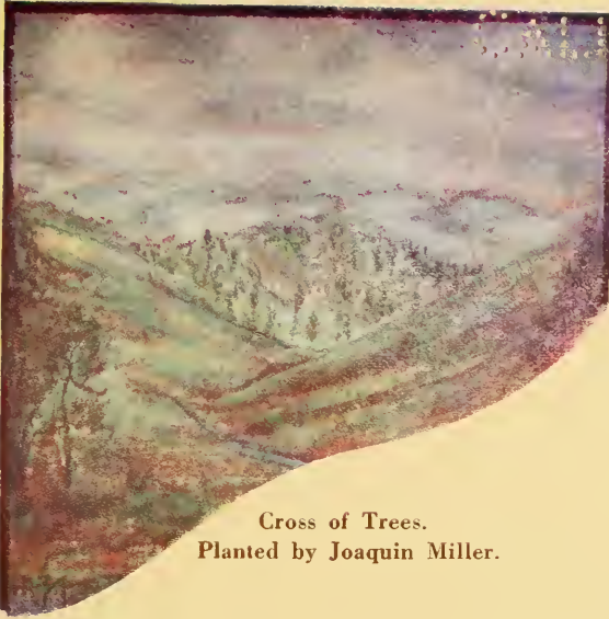
Cross of Trees. Planted by Joaquin Miller.

May we remember to bear our cross what- ever it be Bide patiently; both gain and loss they bal- ance eventually; They are part of the perfect plan And faith in God's greatest gift to man.