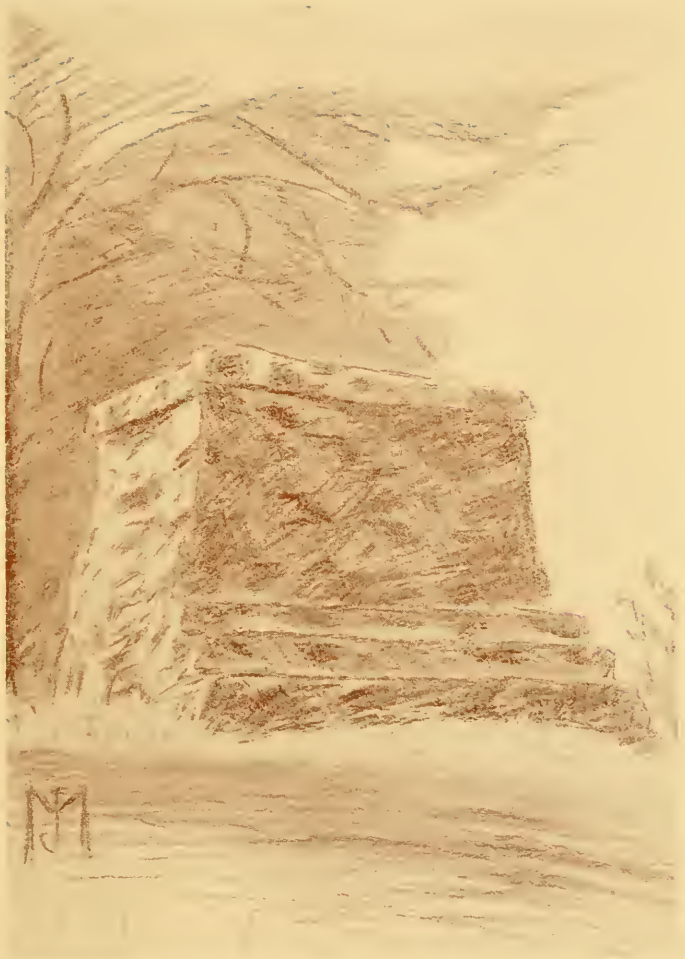
Funeral Pyre. Erected by Joaquin Miller.

That his ashes might ascend up to the sun in smoke and fire— Mingling with the elements, was his desire.