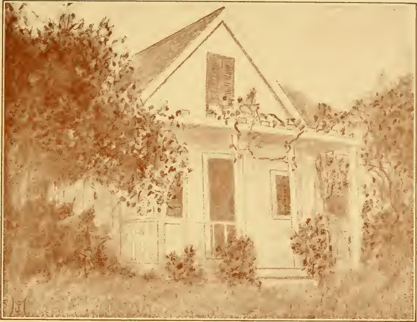
Occupied by the Poet's Mother.