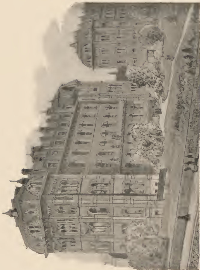
THE WETMORE PAVILION OF THE WOMAN'S HOSPITAL ASSOCIATION.