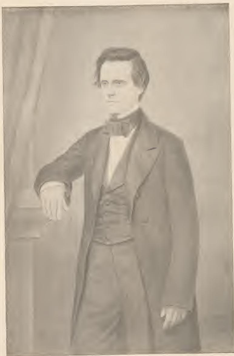
DR. MARION SIMS, 1857.