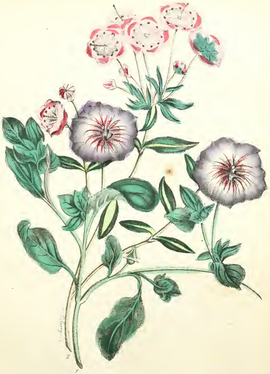
1. Volana prostrata . 2. Halmia glauca .