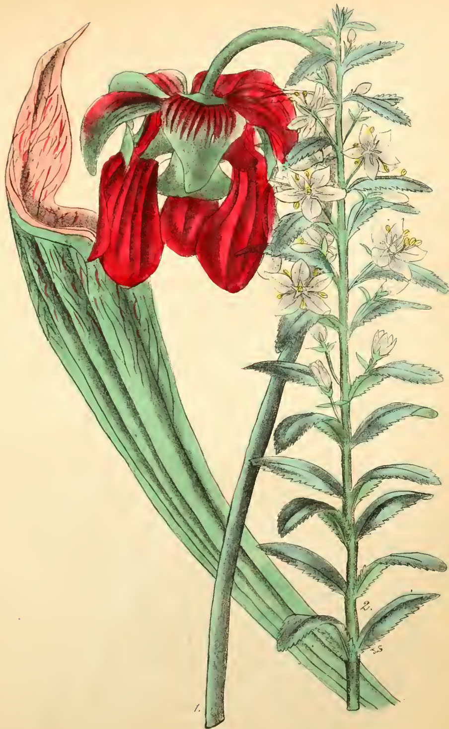
1. Sarracenia rubra . 2. Barosma cremulata .