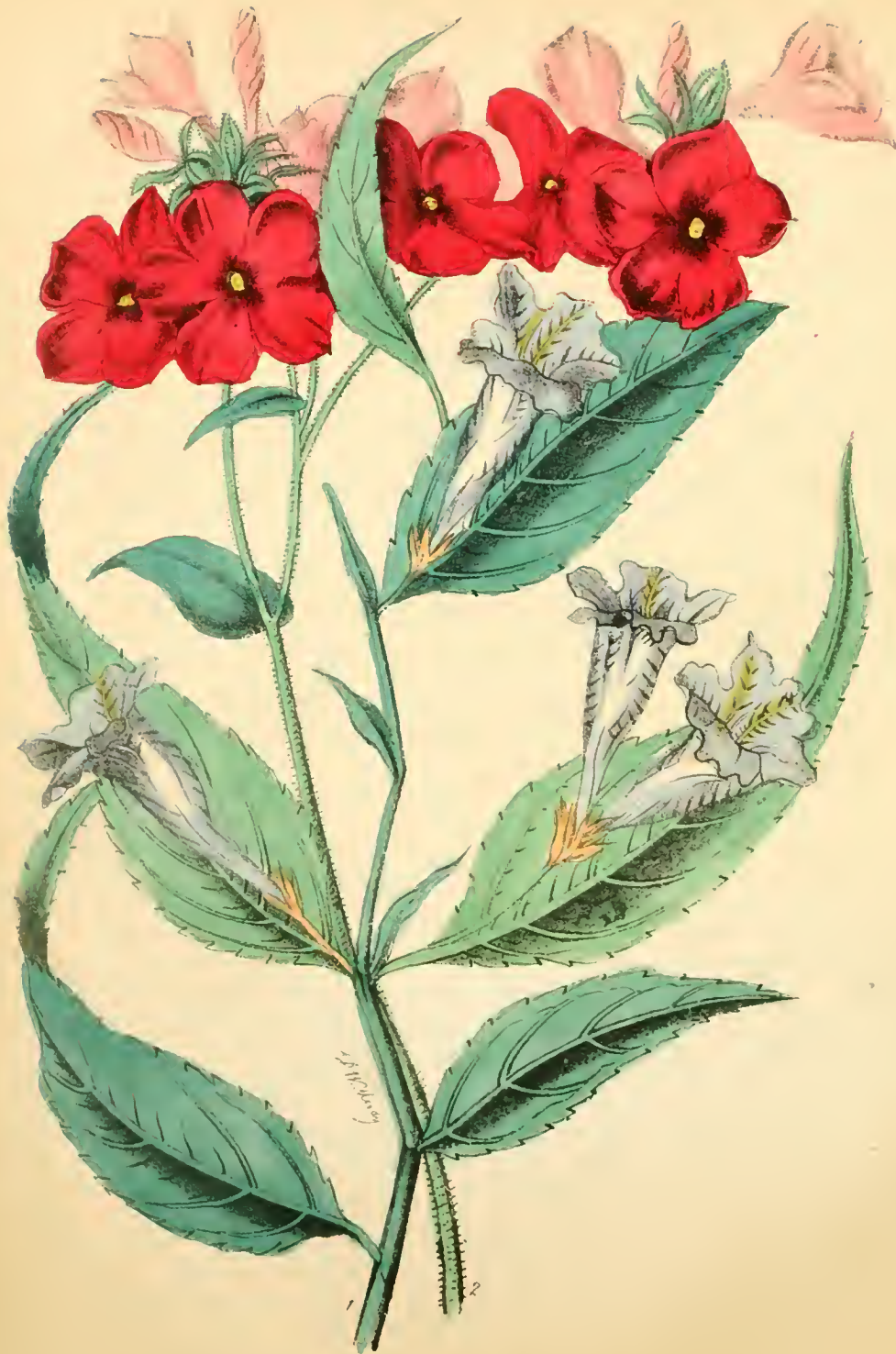
1. Goldfussia anisophylla . 2. Phlox Drummondii .