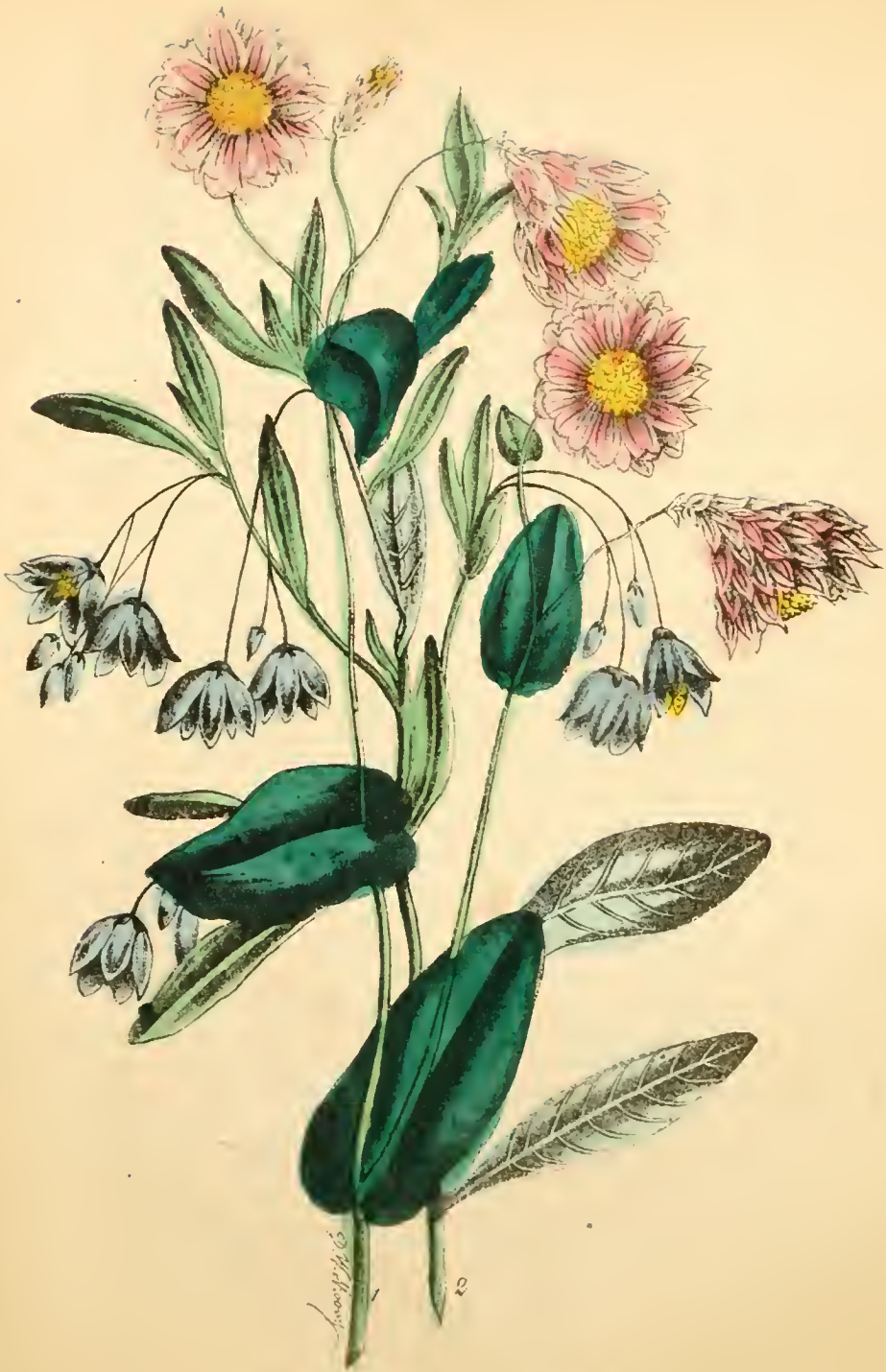
1. Rhodanthus Manglessii . 2. Sollya heterophylla .