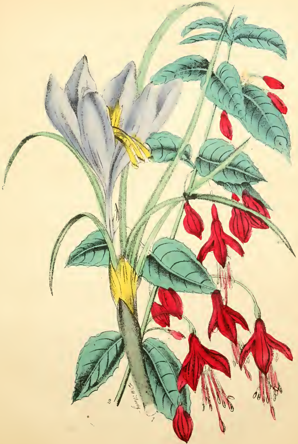
1. Crocus sativus 2. Fuchsia globosa