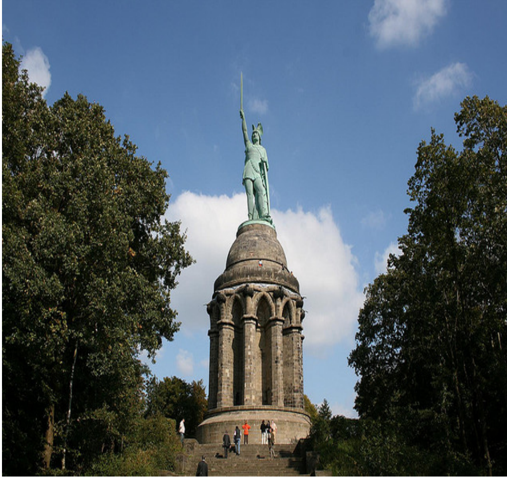
Figure 19. Ernest von Bandel, Hermannsdenkmal , 1875, Totenberg Forest. 75

The monument was created to celebrate the victory of Hermann over the Romans, of which has already been discussed. Bandel also incorporated other ideas into this monument that would form a nexus with the nation. First, it was to proclaim the constant vitality of the nation, meaning that whenever the nation has been under threat it has been youthful enough and strong to overcome it. To further this idea the pedestal, which raises Hermann to the skies, contains a Hall of Fame. This hall was intended to house the representations of great Germans from the past and those that would come in the future. This monument sought to remove the individual as an actor in the state and display the