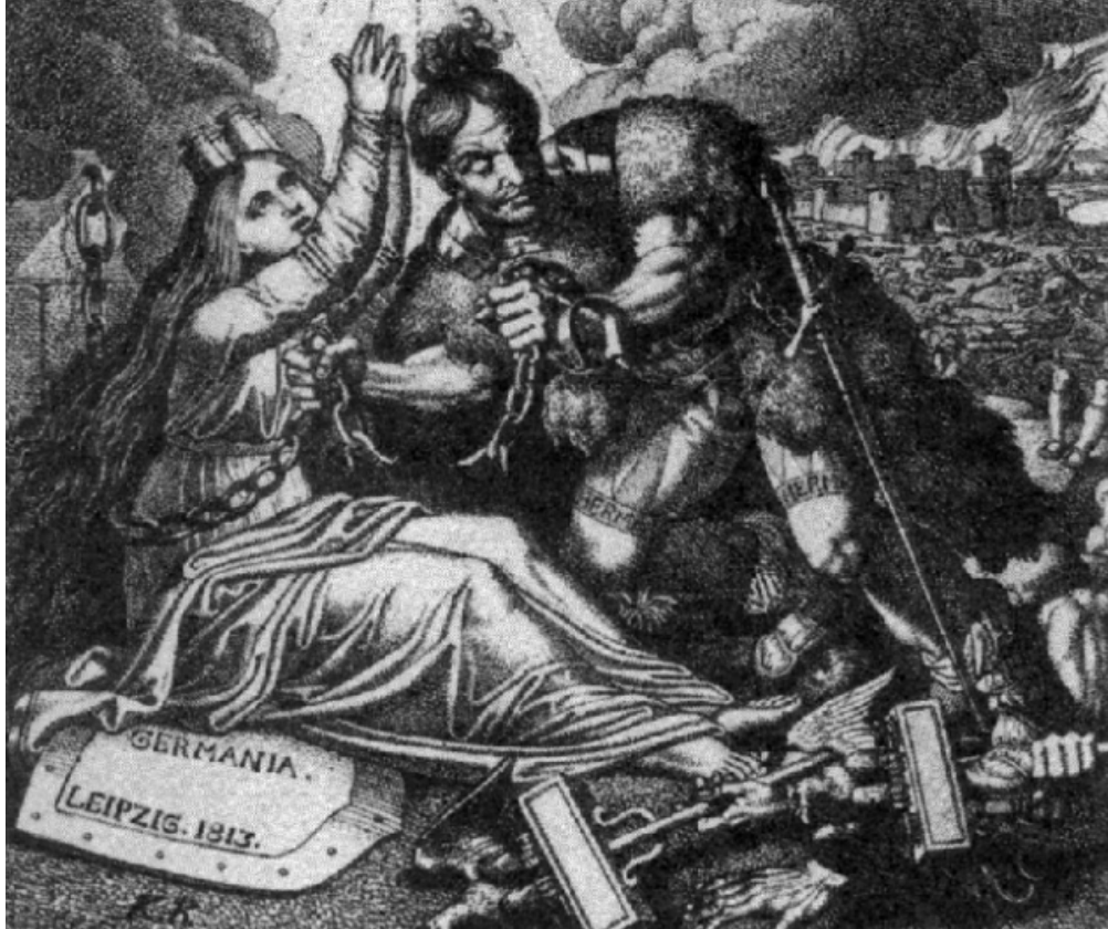
Figure 4. Karl Russ, befreit Germania , 1818. 43