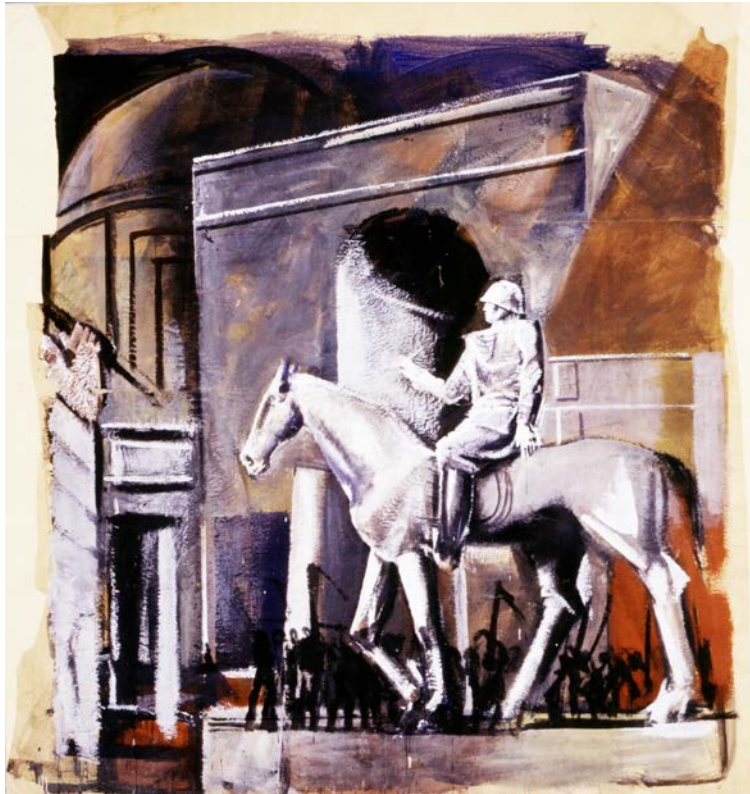
Figure 24. Mario Sironi, Leader on Horseback , 1934. 94

regime. 93 Figure 4.1 provides the nature of art produced by Sironi as well as the prevalent message found throughout art in Mussolini's Italy. The painting is titled, Leader on Horseback , informing us instantly that the soldier on the horse is Mussolini.