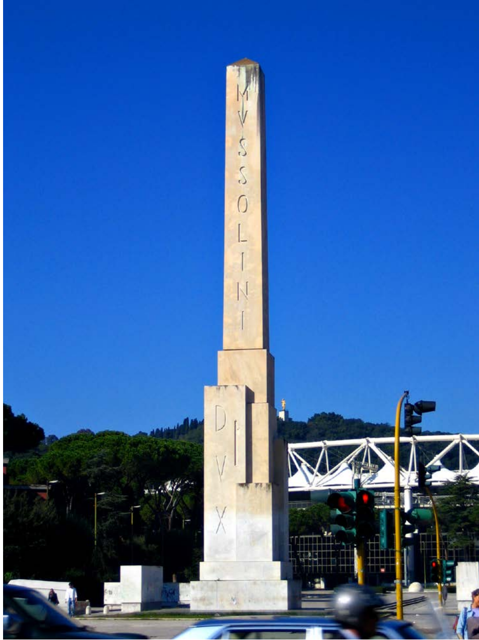
Figure 26. Constantino Constantini, Monolito , 1932, Rome. 96

The deification of Mussolini started 1923 with the publication of his biography, which projected him as a constant survivor escaping death on several occasions, as well