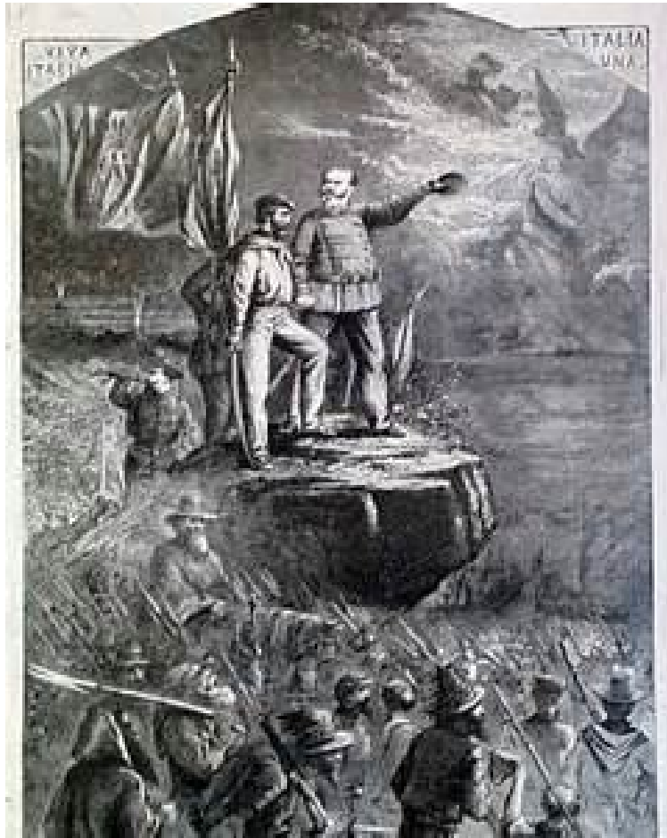
Figure 8. Thomas Nast, The uprising of Italy , 1866. 50

purpose. Most Italians related to Garibaldi as he was considered as an everyday Italian who sought to free Italy from the structure of Monarchy, effectively fighting for the lower and middle strata of society. Further, he was a living character of the war of unity and provided a channel for the energy contain in and the idea of nationalism to be passed through.