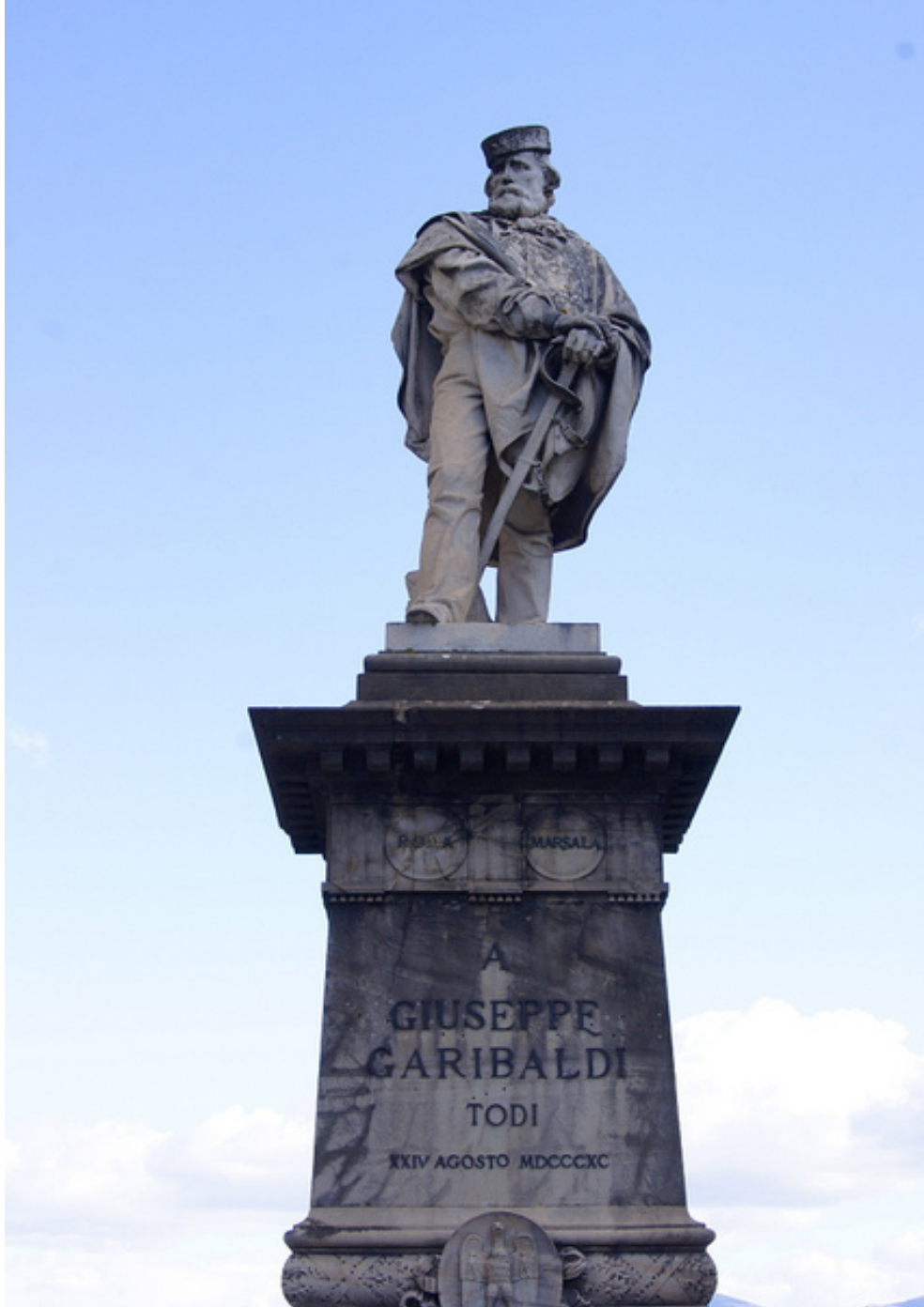
Figure 13. Giuseppe Garibaldi with hat, Todi, Italy. 58