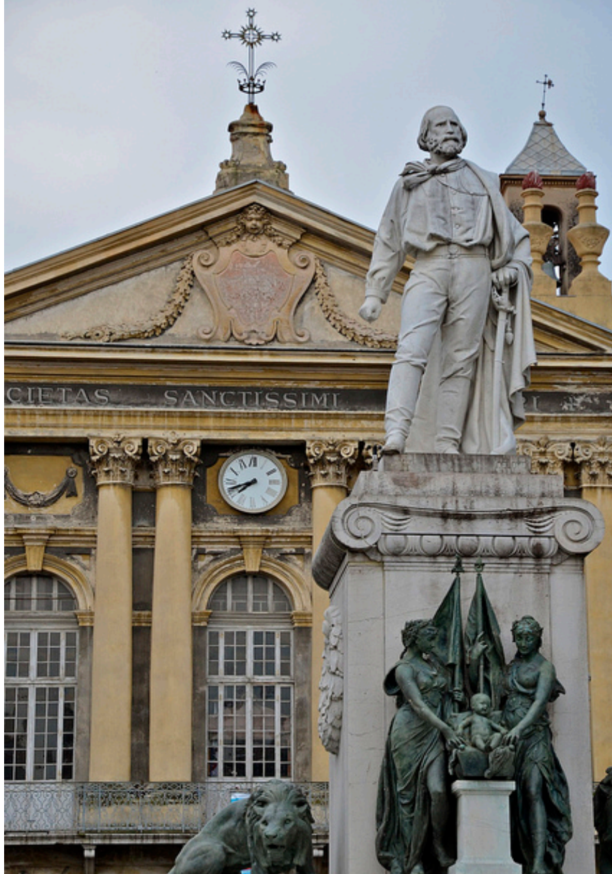
Figure 9. Giuseppe Garibaldi statue, in Provence-Alps-Cote-d'Azur. 54