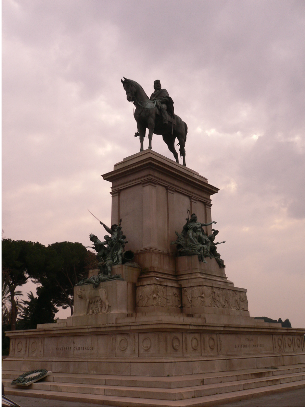
Figure 11. Giuseppe Garibaldi on horseback surround by warriors and gods. Rome, Italy. 56