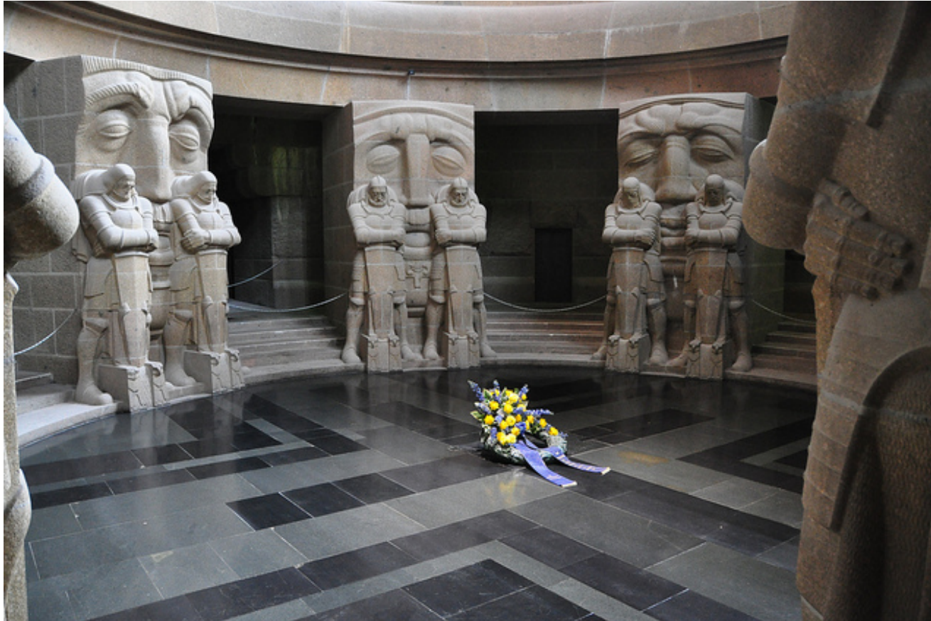
Figure 21. First Floor of Völkerschlachtdenkmal. 80