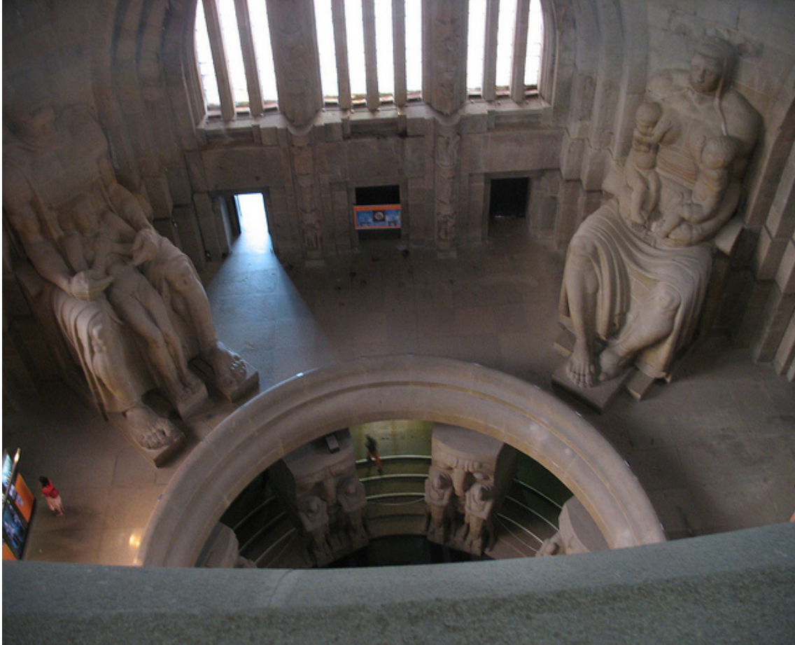
Figure 23. Third Floor looking down of Germania, Völkerschlachtdenkmal . 82

The monument is in commemoration and celebration of the Battle of the Nations. The first floor is dedicated to the Germans that died in battle. Their sacrifice provided Germany the opportunity to become the unified state it was today. The modern German owed it to those that sacrificed their life to not dishonor the nation. The second floor houses the statues of German national heroes. The monument intended to represent the whole German population; this was accomplished by removing the locational or regional symbols that many of the other national monuments contained. The second photo illustrates the intentions of this monument to be a place of worship. In the final figure we