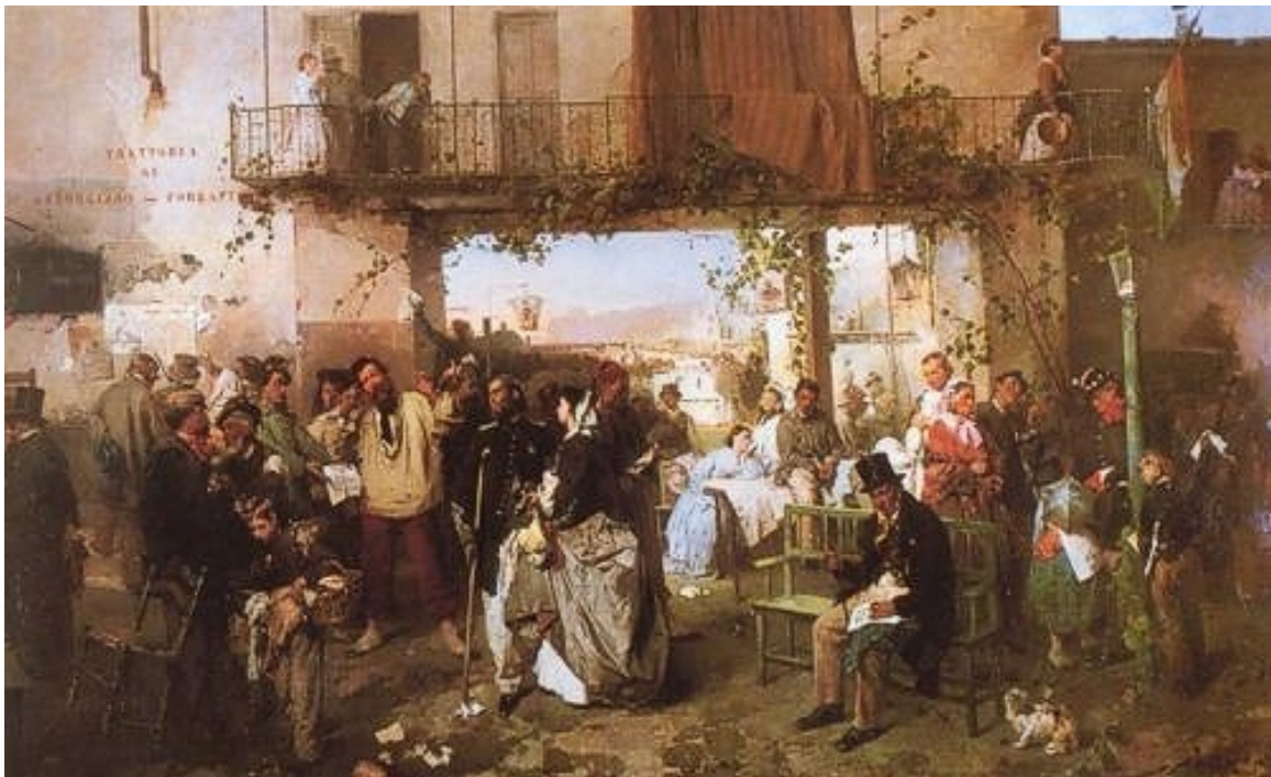
Figure 3. Domenico Induno, Bulletin Announcing the Peace of Villafranca , 1860. 39

This political victory was short-lived as Napoleon viewed the growing Italian national unity as a threat and unilaterally signed a peace treaty with Austria halting the momentum of the military victory in Lombardy. Domenico Induno displays the fallout from the treaty in his painting, Bulletin Announcing the Peace of Villafranca .