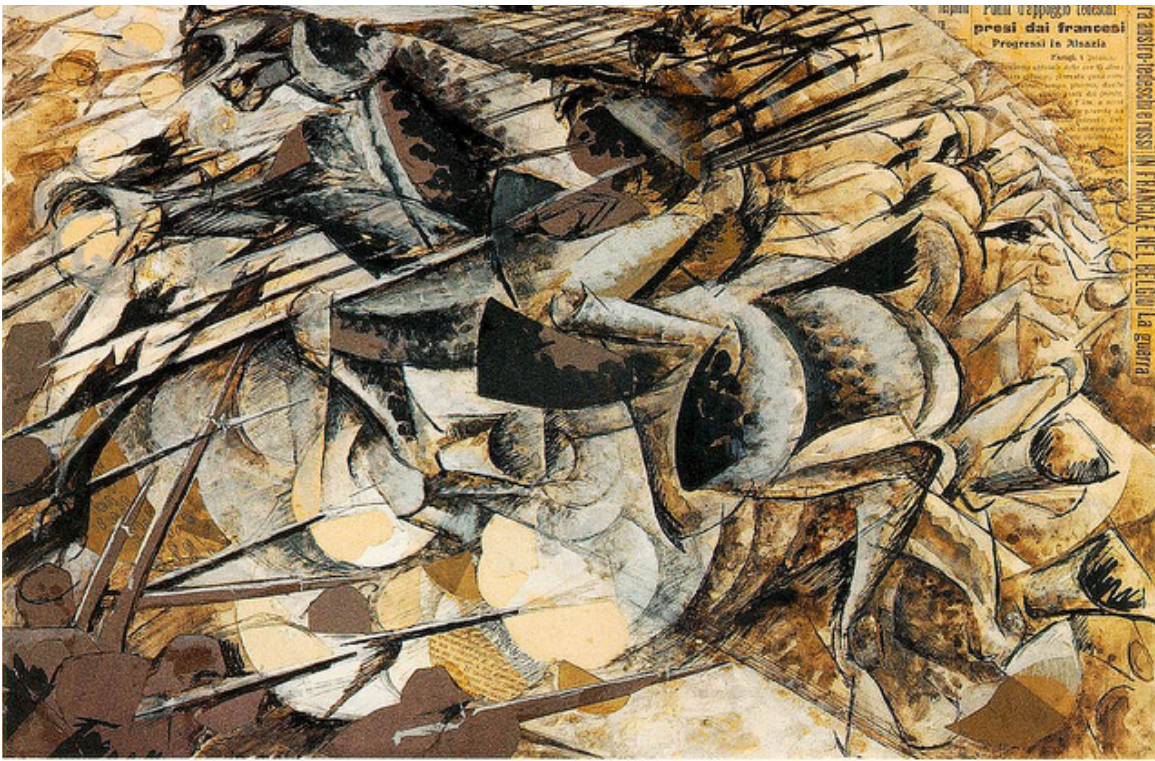
Figure 15. Umberto Boccioni, Charge of the Lancers , 1915. 67

Futurism as an ideology focused on speed and the necessity of violence. This speed, accompanied by modern technologies (cars, trains, and planes) lay at the fingertips of man. Key to the idea of controlling such uncontrollable forces such as time and space is unity of man. The individual exists only as part of the larger whole, in which all component parts must think and act in unison for society to overcome the hurdles to modernity; this was the highest form of culture. It is through the synthesis of man and machine that Futurists reach social purity. Futurist art boldly communicates these ideas.