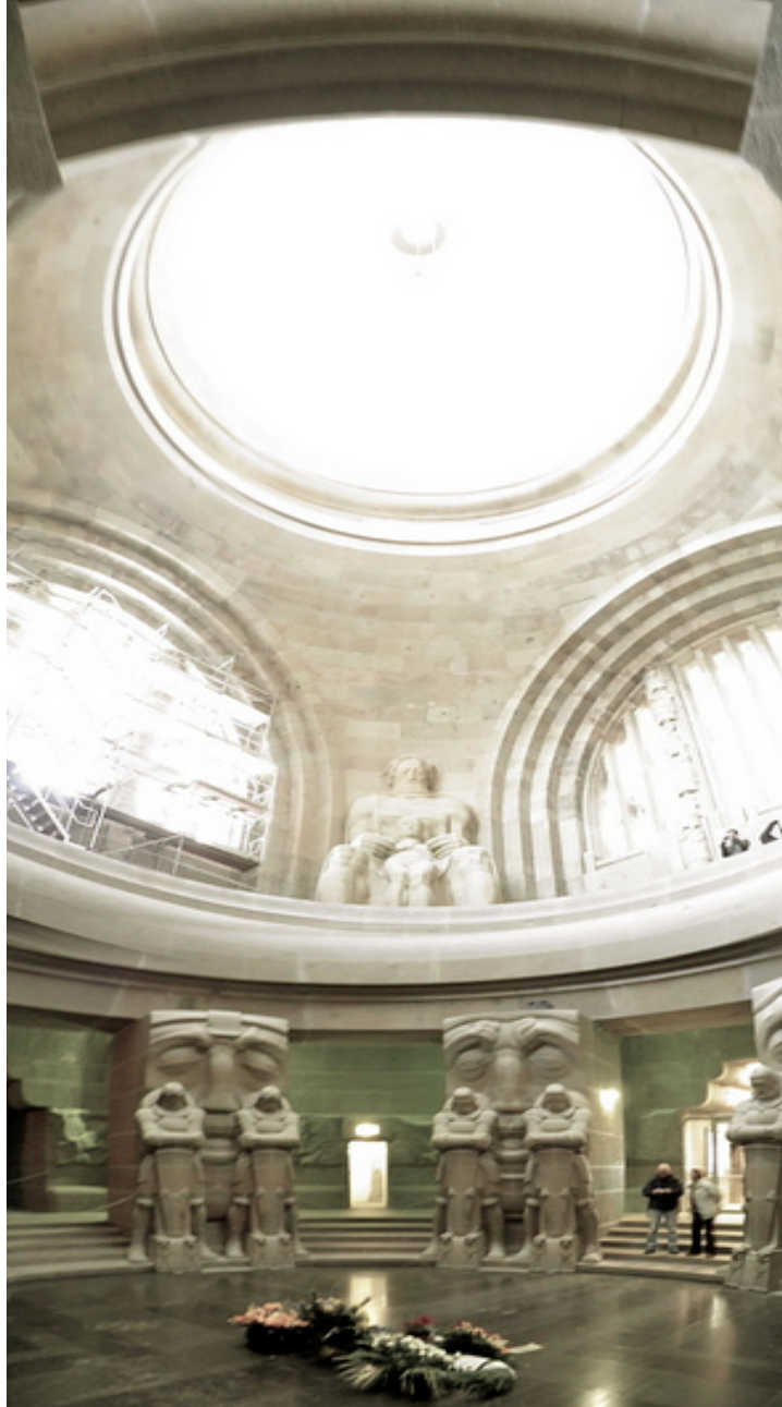
Figure 22. First Floor with view of dome, Völkerschlachtendenkmal . 81