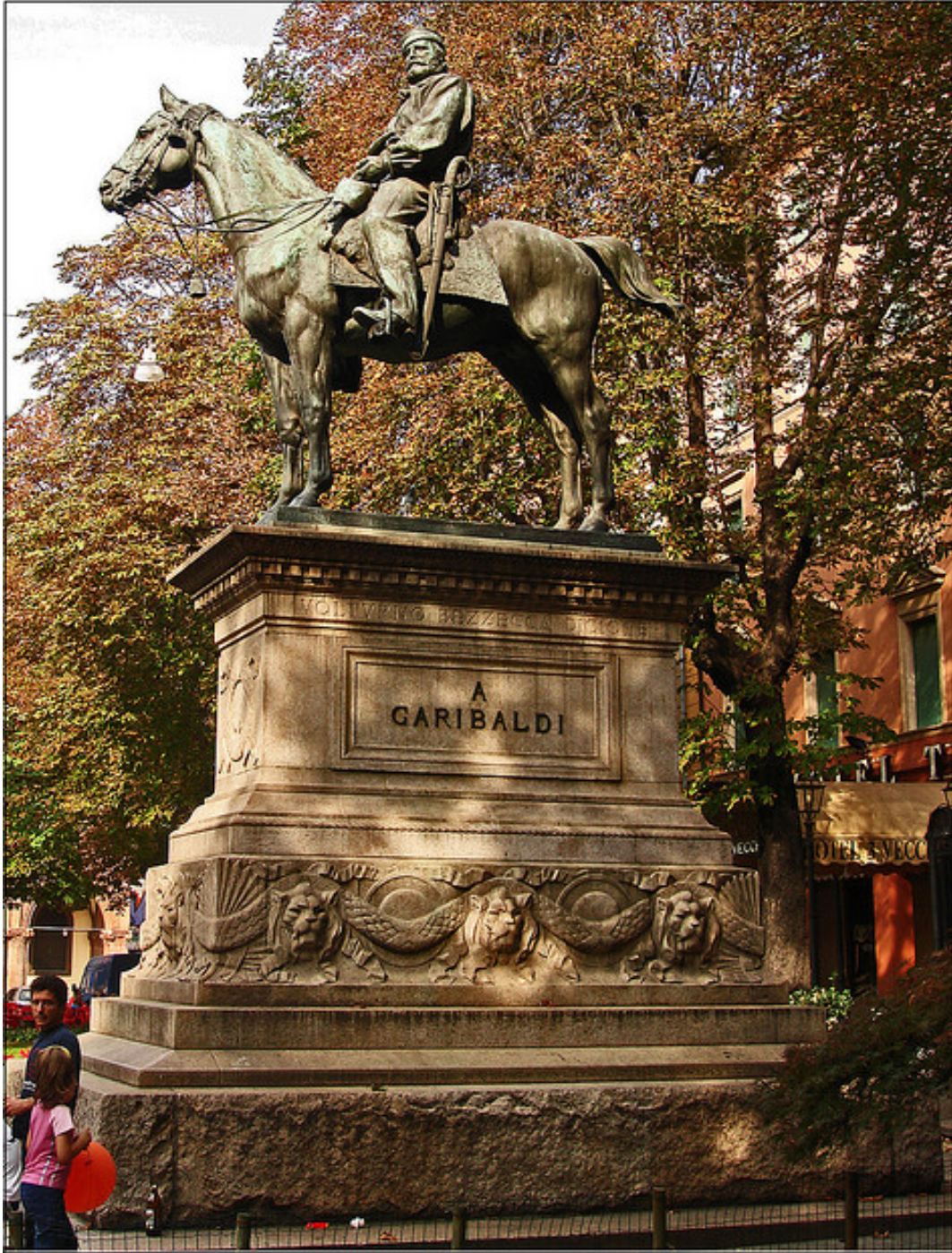
Figure 12. Giuseppe Garibaldi on horseback, Bologna, Italy. 57