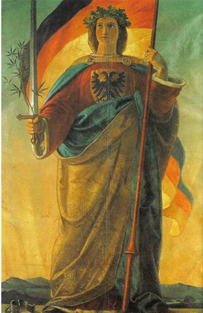
Figure 5. Philip Veit, Germania , 1848. 45

Philip Veit's work Germania , painted in 1848, captures the mass political revolution in Germany during the late 1840s. The public was pushing for a unifying constitution that would result in democracy, a German confederation of states, and male