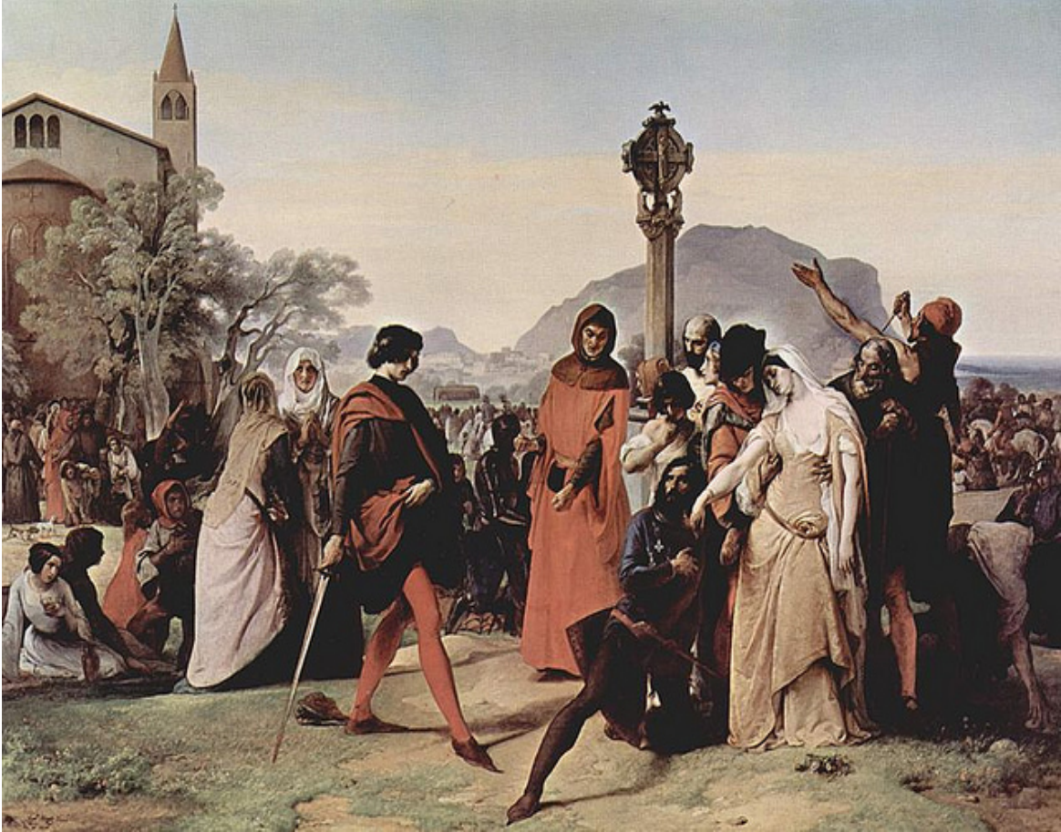
Figure 1. Francesco Hayez, Sicilian Vespers , 1846. 34

The painting represents two places in time, history act as the metaphor for the present. The first issue is the historic reality of foreign rule on the peninsula and the problems associated with occupation. The second issue is the contemporary problem of multiple outside rulers preventing the unification of Italy. The event depicted by Hayez occurred in 1286, which at that time provided the catalysts for Sicilians to overwhelm their French colonizer and gain independence. The setting of the work is outside a church in the evening and the Christian faithful have gathered for evening prayer, known as Vespers. A French soldier, named Drouet, was inspecting Italians for weapons, typical behavior of the French colonizers. He approached a woman intent on searching her and