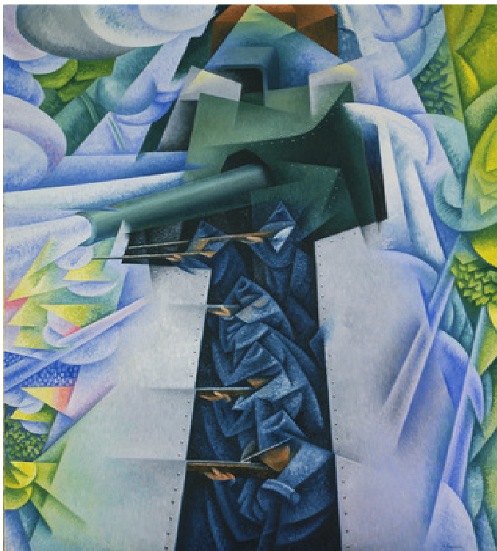
Figure 17. Geno Severini, Armoured Train in Action , 1915. 69

The synthesis of politics and Futurism occurred in 1919; however, in its time as a social and artistic movement it contributed much to Italian political evolution. First, the movement laid the foundation for nation-state symbiosis. The individual had no identity in Futurist ideology. The way a person found worth was to act harmoniously with others in the goal of uplifting Italy. The apparatus that the unified work was to be done in and through was the state. The state function was that of using the unified nation and its