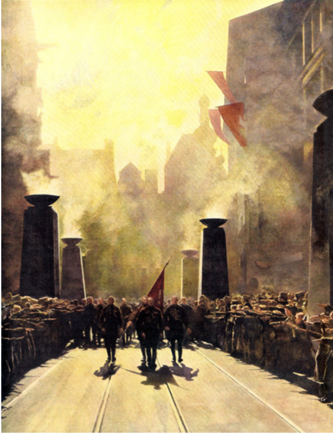
Figure 30. Paul Herrmann, Die Fahne , 1938 111