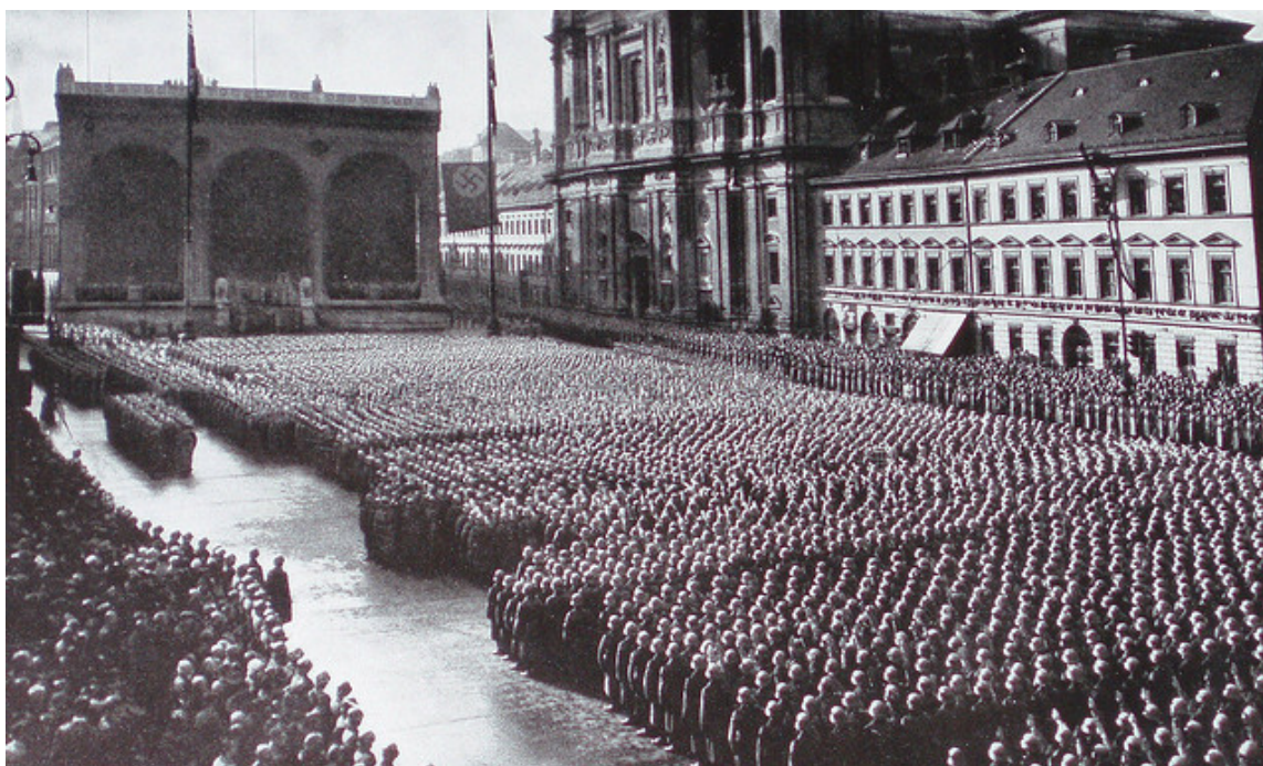
Figure 32. Nazi Commemoration the Beer Hall Putsch, Odeonsplatz Munich. 114

The secular religion that had begun in the 19th century had become a tool for the Nazi regime. Through mass celebrations and gatherings the Nazis were able to indoctrinate society with state ideology. This is not to say the nation did not embrace the Nazi ideology or that it was forced upon them, the Nazis simply used the infrastructure already in place and molded it for their purpose. The use of German culture and tradition simply made embracing or supporting Nazism easier, as it was seen as representing the German nation. The political liturgy became the high culture for the masses and was perceived as such. High culture in its previous form still existed, but for a very select group. In this way high culture had taken back its previous life of being available to only a few. However, for nationalistic purposes it had little value as the masses were engaged with marches, festivals, and posters.