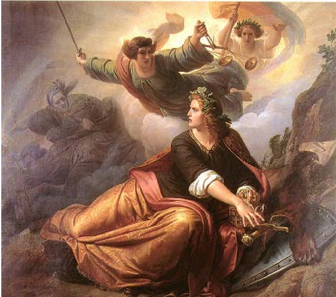
Figure 6. Christian Köhler, Germania Awakening , 1849.

excluded Austria. The republic's efficacy, however, was only in letter and not action. 48 In 1849 Christian Köhler painted Germania Awakening (Figure 6) to remind the public of the dangers still surrounding the nation and the goals of German nationalism, democracy.