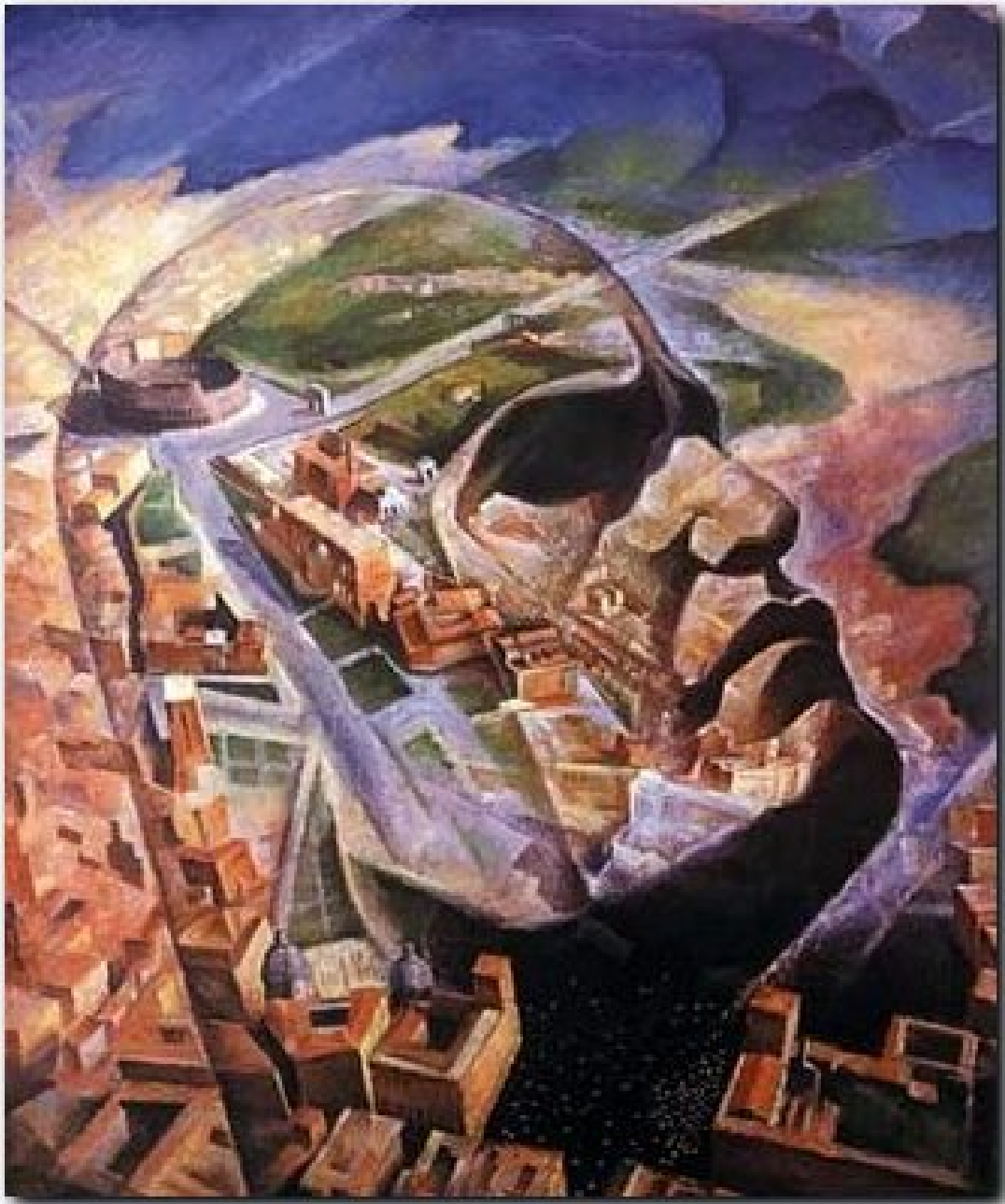
Figure 28. Gauro Ambrosi, Aviator Benito Mussolini , 1930. 99