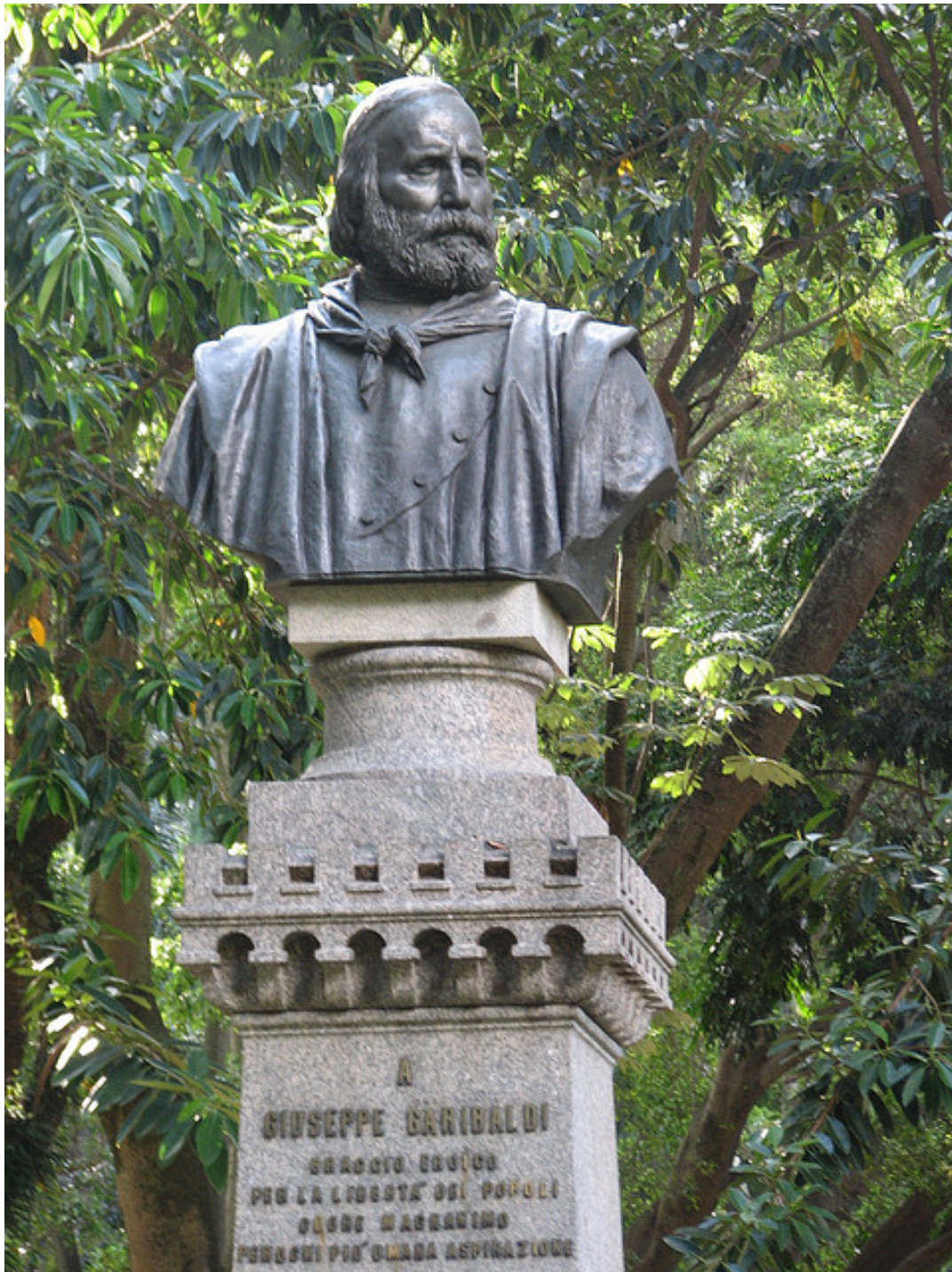
Figure 10. Emílio Gallori, Giuseppe Garibaldi bust. 55