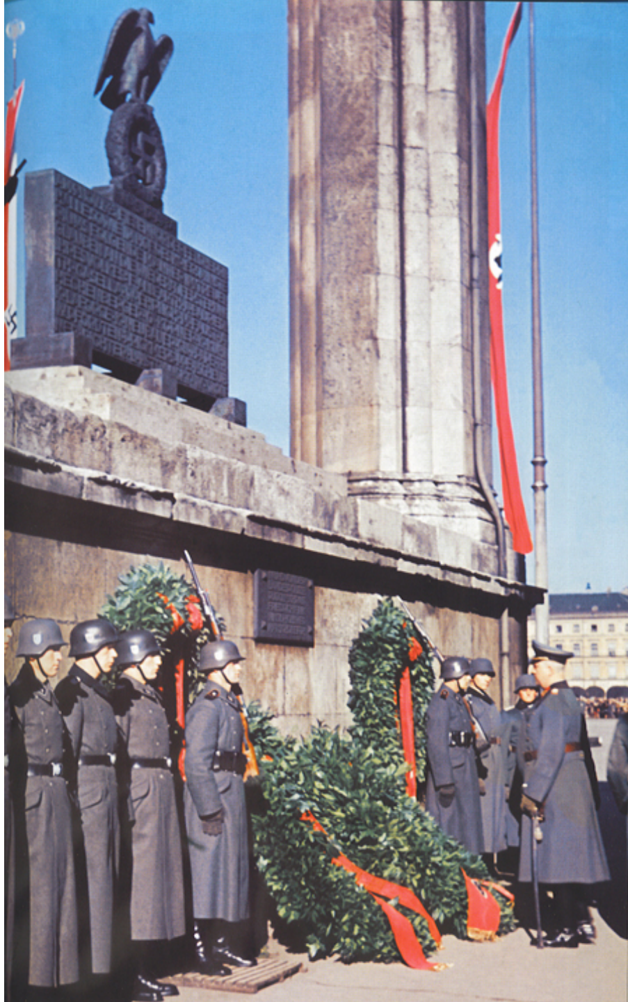
Figure 31. Nazi Commemoration the Beer Hall Putsch, Odeonsplatz Munich. 113