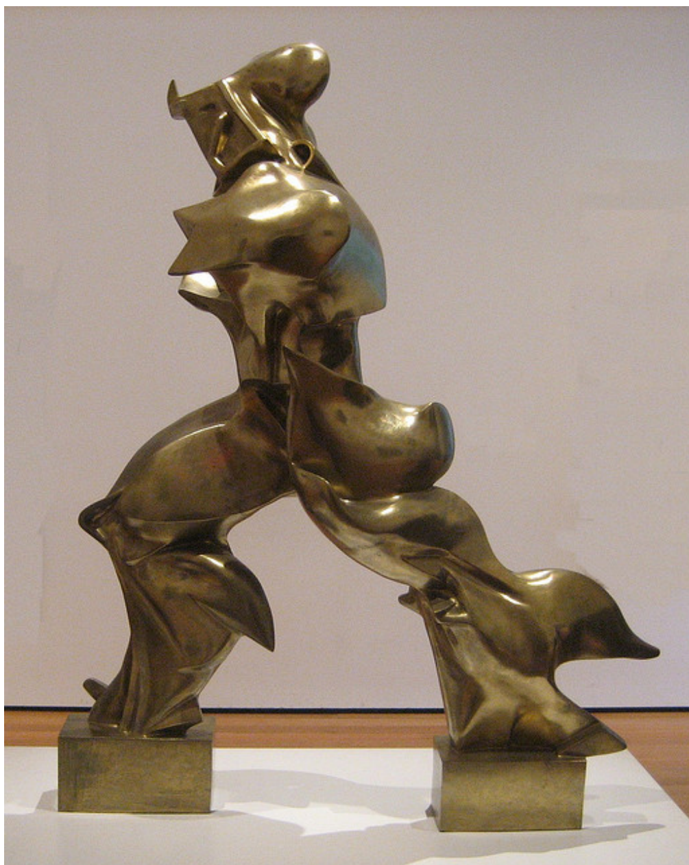
Figure 16. Umberto Boccioni, Unique Forms of Continuity in Space , 1913. 68