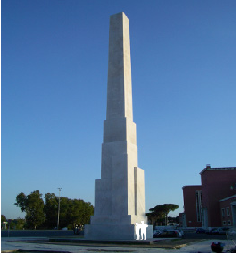
Figure 25. Constantino Constantini, Monolito , 1932, Rome. 95