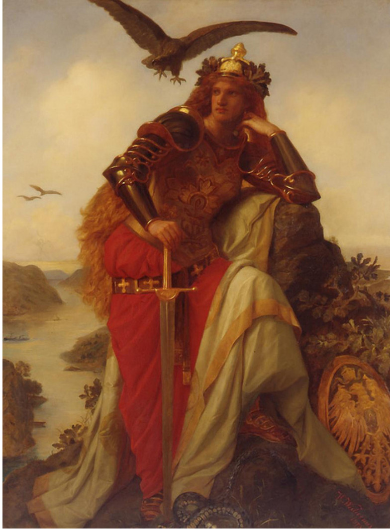
Figure 18. Hermann Wislicenus, Germania at the Watch on the Rhine , 1873. 73

This image was also a reflection of the changing social and political characteristics. The army was regarded as the protector of the German nation, from both the external threats as well as internal. The internal threats, to national greatness, were the church, which was always subject to outside influences, the social democrats, who were linked to weakness due to their social and political policies, and liberals, who were seen as revolutionary. Increasingly the view of the educated middleclass German deteriorated,