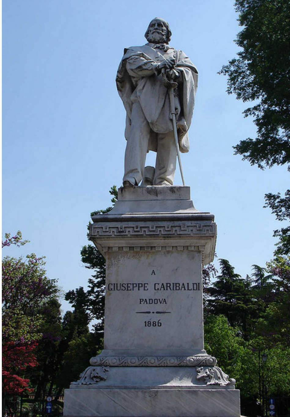
Figure 14. Giuseppe Garibaldi, 1886, Padova, Italy. 59