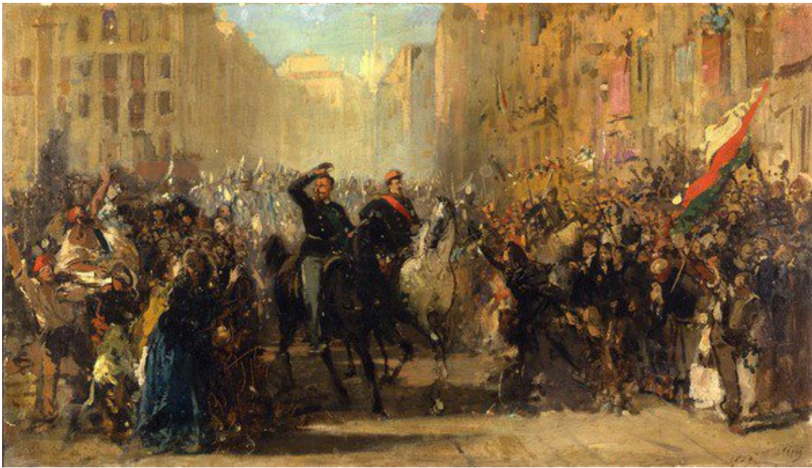
Figure 2. Giuseppe Bertini, Victor Emmanuel II and Napoleon III enter Milan , 1859.

The nationalist artwork of the Macchiaioli contained Italian cultural symbols and historical forms of representation to ensure that their production of high culture was seen as truly Italian. As the nationalist movement in Italy took shape and progressed to the culminating point of statehood art reflected this energy and began to push for the formation of a nation-state. Upon achieving their goal, Italian nationalist artists moved away from the emotional metaphors that made an attempt to arouse the population to come together and form a united Italy. The Macchia painters turned their focus on celebrating those that led and participated in the revolution and defaming others that hindered nationalist progress. Two paintings show the rapid change in emotion of the nationalist movement and Italian politics.