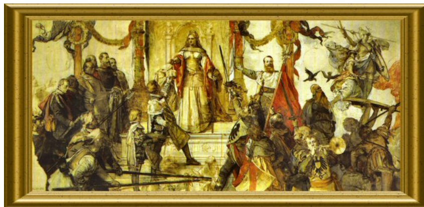
Figure 7. Anton Von Werner, Heil Germania , 1872. 49

The conclusion of the Franco-Prussian war led to the political and administrative unification of the nations of Prussia and Bavaria. Heil Germania , by Anton Von Werner, 1872 captures the ceremony at the Hall of Mirrors in Versailles. Germania is the focal point of the painting. She stands central in the painting in front of a royal throne, accepting the crown of the new German nation from a Bavarian envoy. The men on either side of her are dressed and armed in battle attire. She also symbolizes the military dominance that earned the German nation its sovereignty. The right side of the photo shows men rejoicing in the moment while on the left the men are reluctant and solemn on the occasion. The painting makes public the political lines that had divided the nation states. The painting, however, tells that the German people are victorious and the burden of unity rest with them. Werner's painting is not a dramatic show of military victory against an outward threat, but an accomplishment that will strengthen the German's ability to repeal any such assault.