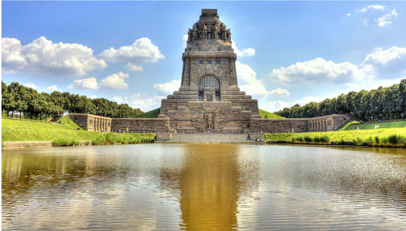
Figure 20. Bruno Schmitz, Völkerschlachtdenkmal , 1913, Location Leipzig. 79