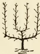
Four-Arm 6 to 8 feet Apples Pears Plums only $12.00 each

The kinds of fruits which are available for the different Espalier forms are listed herewith: