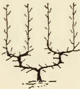
Double-U 6 to 8 feet Peaches Nectarines Only $12.00 each