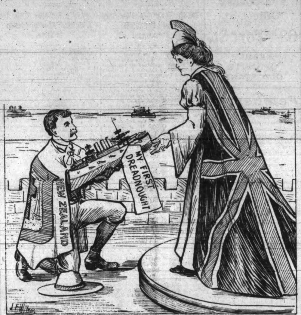
FOR THE EMPIRE

Seranton, Pa., March 25.—Having reaffirmed the position they took last October when they formulated certain demands which have been rejected by the mine operators, an dividing decided to remain at work while the district officers of the union make another effort to reach an agreement with the employers, the delegates to the tri-district convention of the United Mine Workers returned to their homes to-day. The whole matter of negotiating an agreement with the operators is now in the hands of the executive board of the anthracite region, and it is probable a conference with the coal road presidents will be requested for next week.