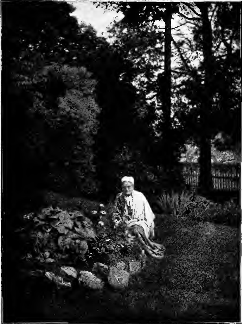
The Circle on the Lawn