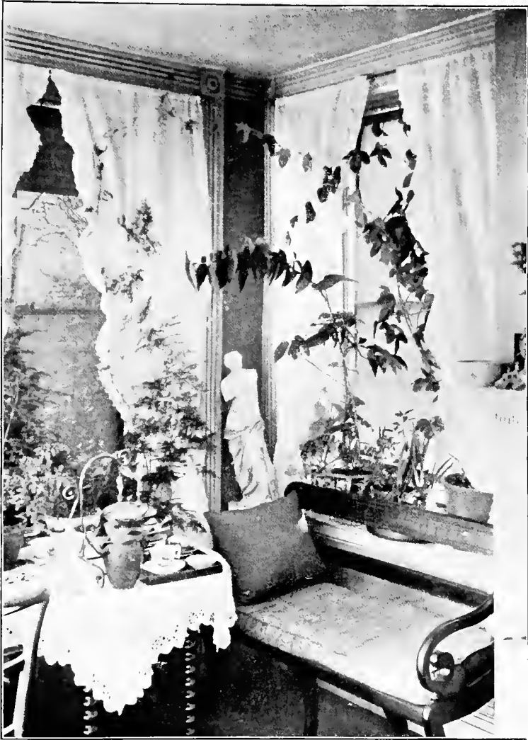
Winter Corner at The Lilacs