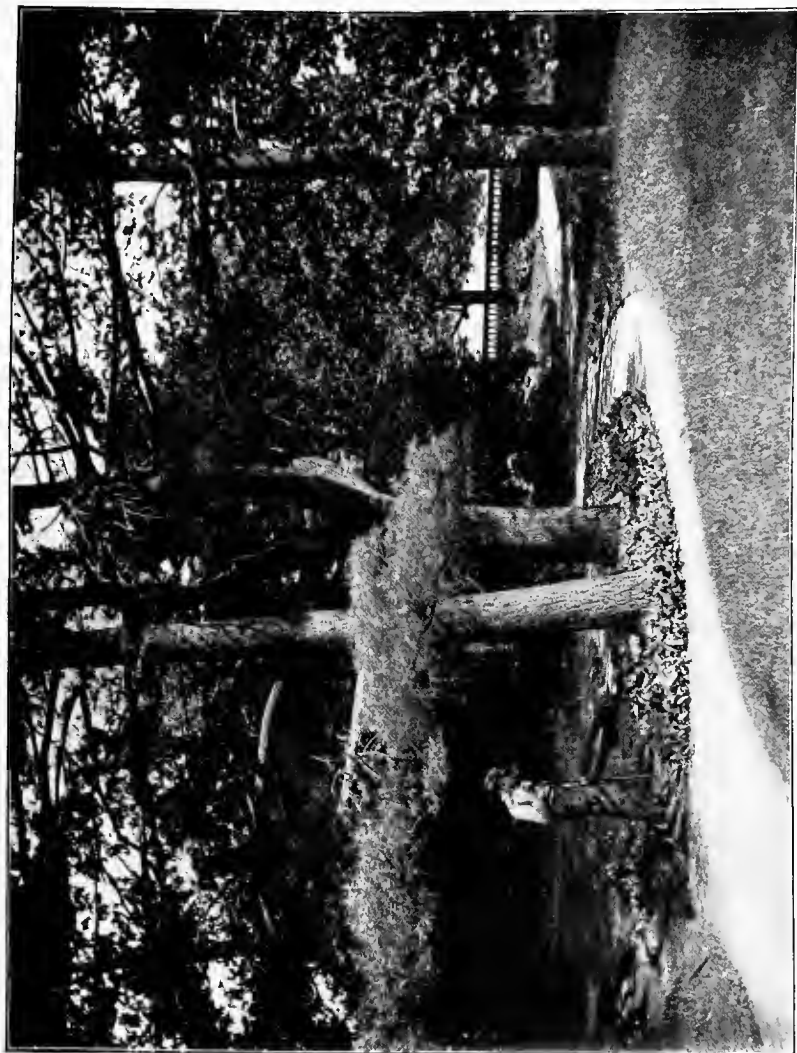
The Man with the Hoe