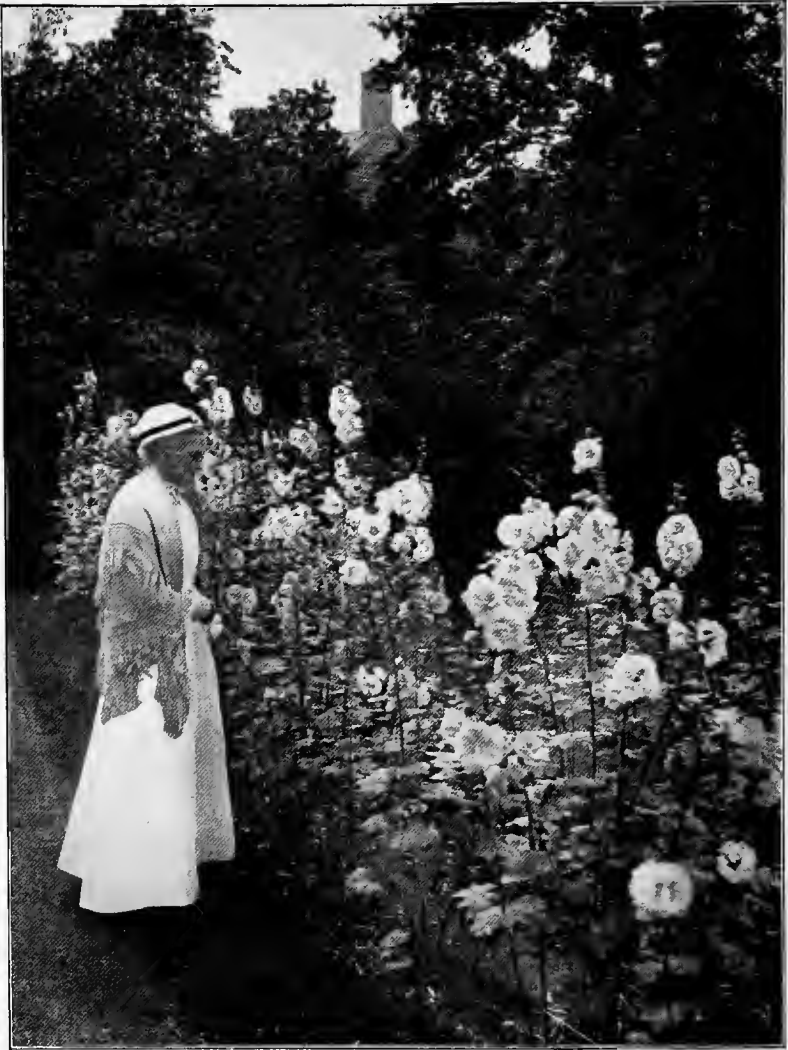
The Hollyhock Bed