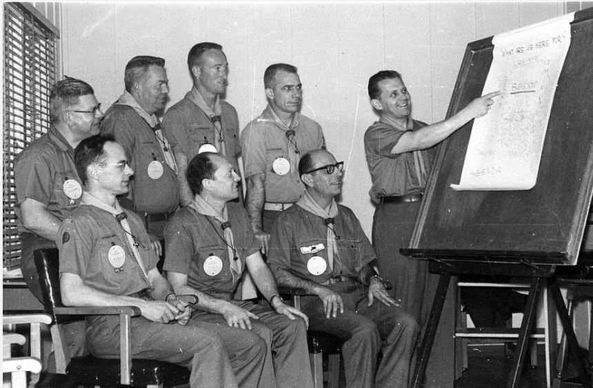
Szentkiralyi [CC BY-SA 3.0]