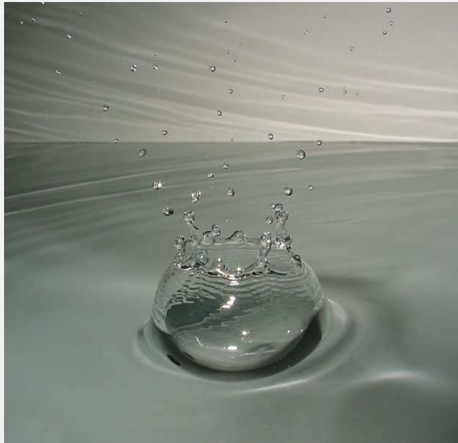
Roger McLassus [CC-BY-SA-3.0]