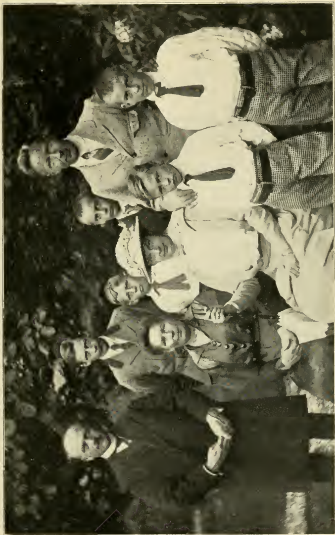
THE CROWN PRINCE AND CROWN PRINCESS WITH THEIR CHILDREN AND WITH THE MAYOR OF WIERINGEN AND HIS WIFE