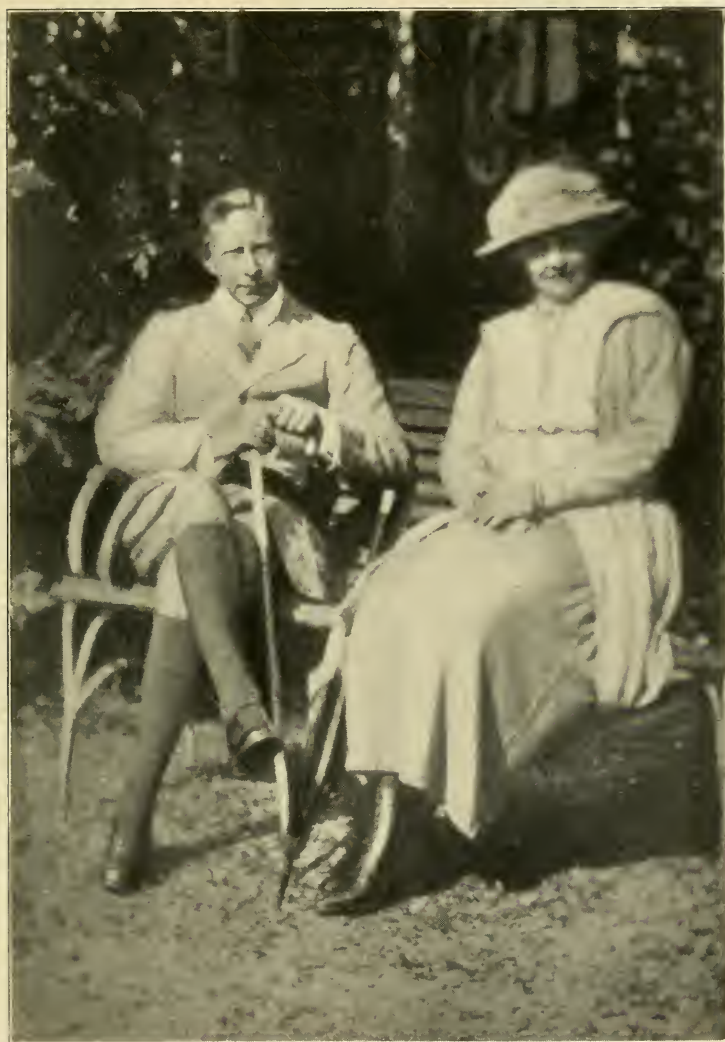
THE CROWN PRINCE AND CROWN PRINCESS AT WIERINGEN