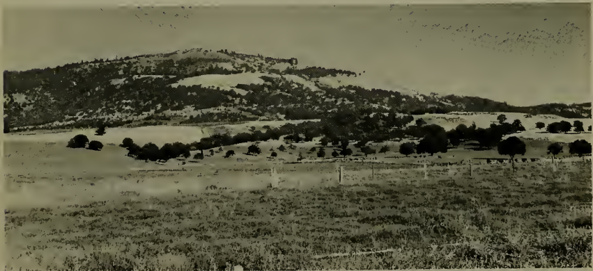
Fig. 3. Quercus groves and diversified farmland east of Medford. Ceanothus spp., Rhus diversiloba , and oak groves on the west slope of Mount Baldy are interrupted with open areas of short grasses and annuals.

The remaining portion of Jackson County is mountainous and dominated by coniferous forest. This upland part of the county is in the Oregonian Province (Dice 1943:31), which includes the Cascade Mountains of northern Jackson County west and north of Union Creek