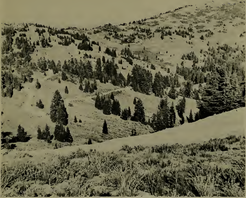
Fig. 7. Plants on the south side of Mount Ashland include Abies magnifica shastensis , A. procera , Chamaecyparis nootkatensis , and species of Ceanothus and Arctostaphylos .