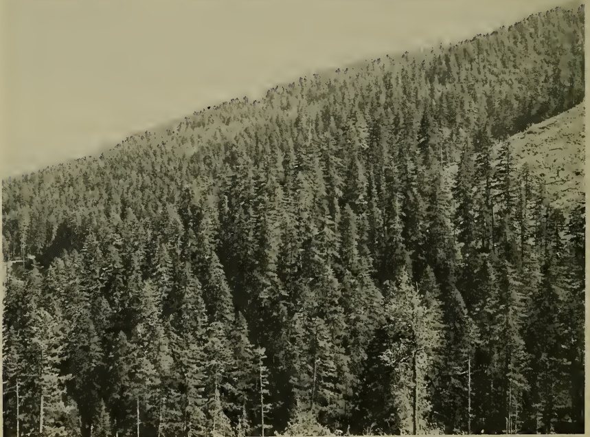
Fig. 4. Pseudotsuga menziesii on the western slope of the Cascade Mountains in Mixed Conifer Forest.

Pinus ponderosa and P. lambertiana (mostly secondary growth) associated with Pseudotsuga menziesii are dominant along the Upper Rogue River between Shady Cove to Prospect and east of Union Creek. Pinus lambertiana and Pseudotsuga menziesii are dominant from Prospect to Union Creek.