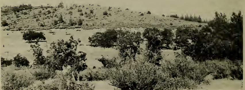
Fig. 2. Foothills east of Medford. Quercus groves and Pinus ponderosa are the predominate trees. Ceanothus and Arctostaphylos spp. occupy most of the foreground. Elevation, about 610 m.

The eastern Bear Creek foothills are characterized by larger and more abundant Quercus groves, scattered trees of Pinus ponderosa , and an understory of Rhus diversiloba (Fig. 2). Most of the southern and western slopes of Roxy Ann Peak and Baldy are dominated by nearly impenetrable Rhus diversiloba , often over 3 m high, interrupted only