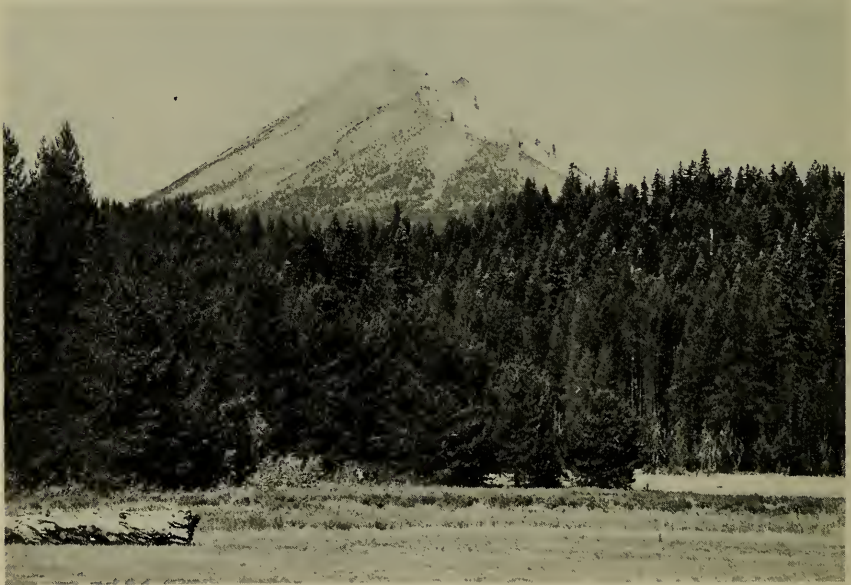
Fig. 6. True Fir Forest near Lake of the Woods (Klamath County) at 1,524 m. The summit of Mount McLoughlin is in the background.

Timberline Forest. —The highest elevations of Jackson County are typically forested by small subalpine forests; two Cascade Mountain peaks (Mount McLoughlin and Brown Mountain) are above timberline (Fig. 6). Pinus albicaulis , Tsuga mertensiana , Abies lasiocarpa , Cassiope spp., and Phyllococe spp. are the dominant plants above about 1,829 m. Juniperus communis , Pinus monticola , Cassiope spp., and Phyllodoce spp. are dominant plants in the higher Siskiyou Mountains. The Timberline Forest includes the Tsuga mertensiana Zone and the Alpine Zone of Franklin and Dyrness (1973).