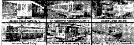
Examples of Rail Transit Systems Subject to FTA State Safety Oversight Program

Source: Pennsylvania DOT; Seattle Center Monorail; San Francisco Municipal Railway; Cable Car; Port Authority of Oregon County (Oregonian).