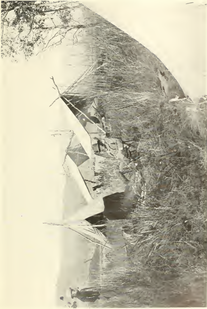
JOHN HAY AND HENRY ADAMS CAMPING IN YELLOWSTONE PARK, 1894