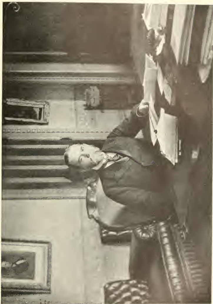
SECRETARY HAY IN HIS OFFICE IN THE STATE DEPARTMENT