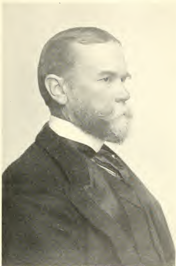
in 1897