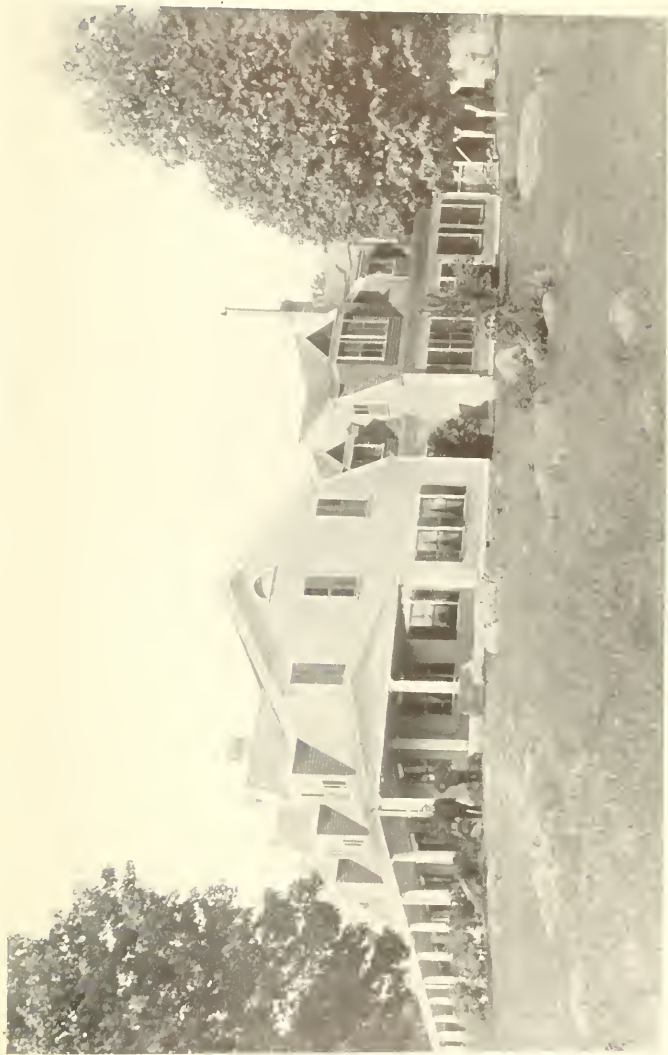
JOHN HAY'S SUMMER HOME, "THE FIELDS," AT NEWBURY, ON LAKE SUNAPEE, NEW HAMPSHIRE