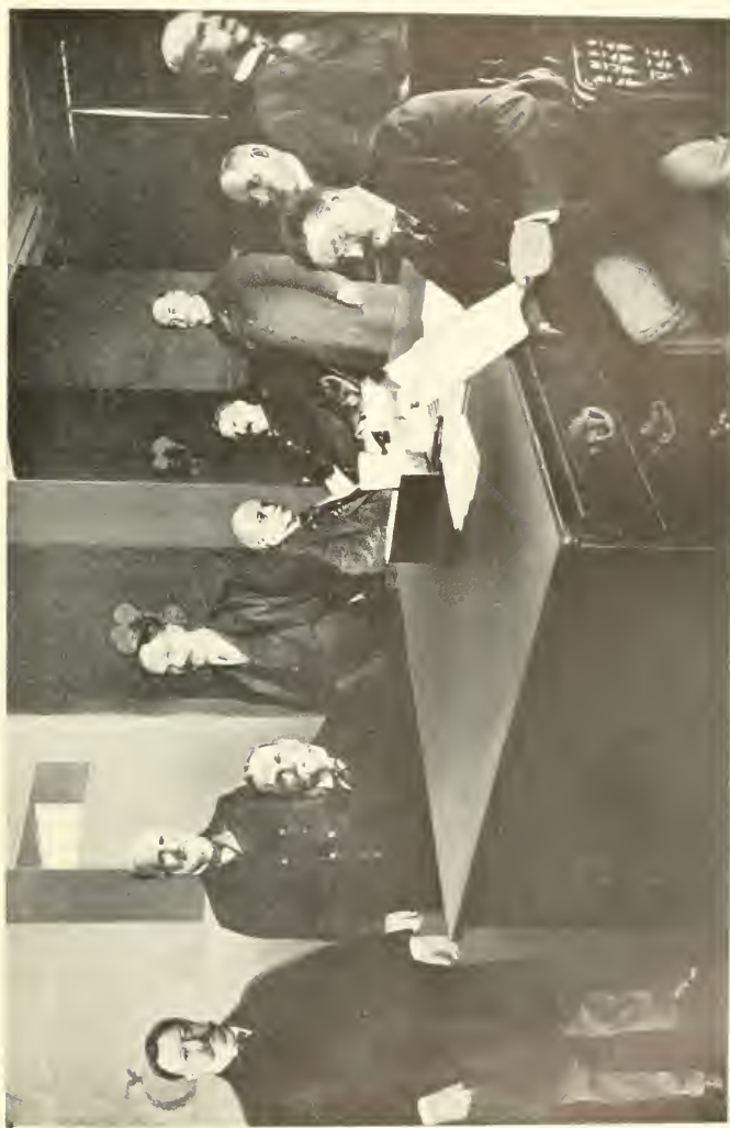
PRESIDENT ROOSEVELT AND HIS CABINET Taft, Wilson, Hay, Morton, Hitchcock, Moody, Wynne, Roosevelt, Metcalf, Shaw