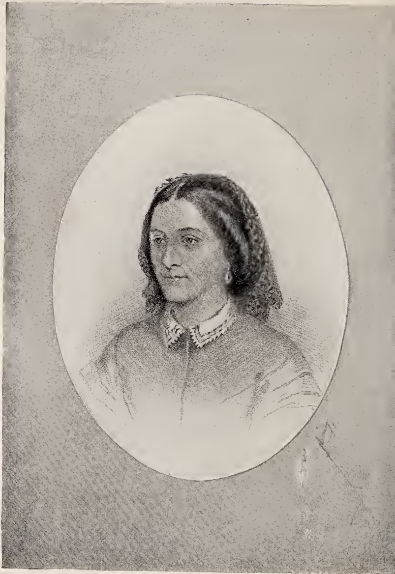
ADELAIDE A. PROCTER.