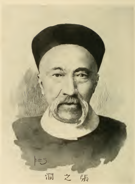
VICEROY OF HUPEH AND HUNAN