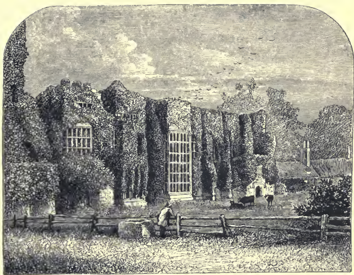
A TUDOR ENGLISH MANSION. RUINS OF COWDRAY, SUSSEX.