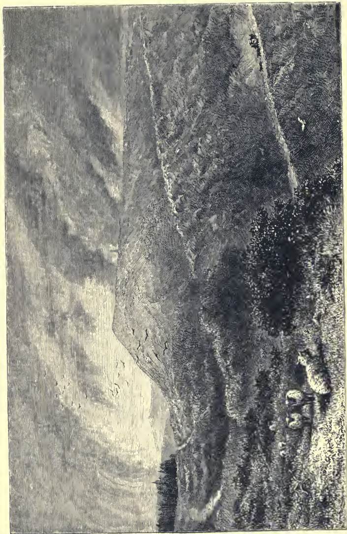
THE OLD PORTSMOUTH ROAD. HINDHEAD, BORDERS OF HANTS AND SURREY.