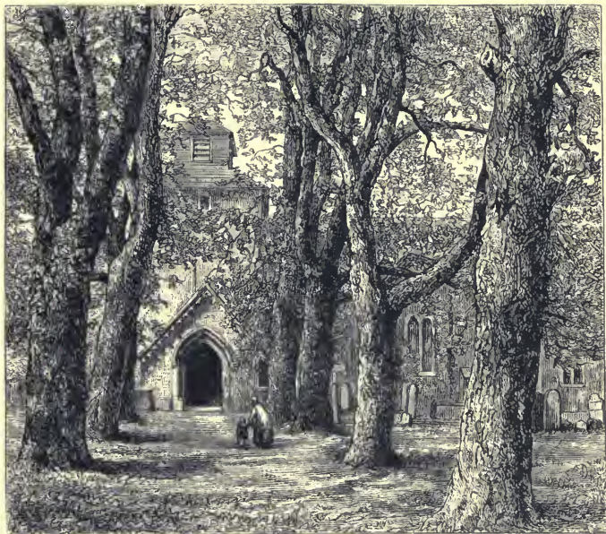
AN ENGLISH COUNTRY CHURCH. WOTTON, SURREY.