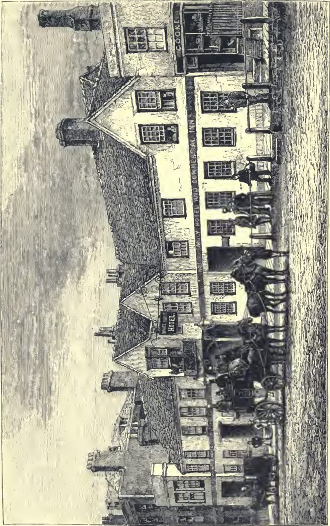
AN ENGLISH COUNTRY INN. "THE WHITE HORSE," DORKING.