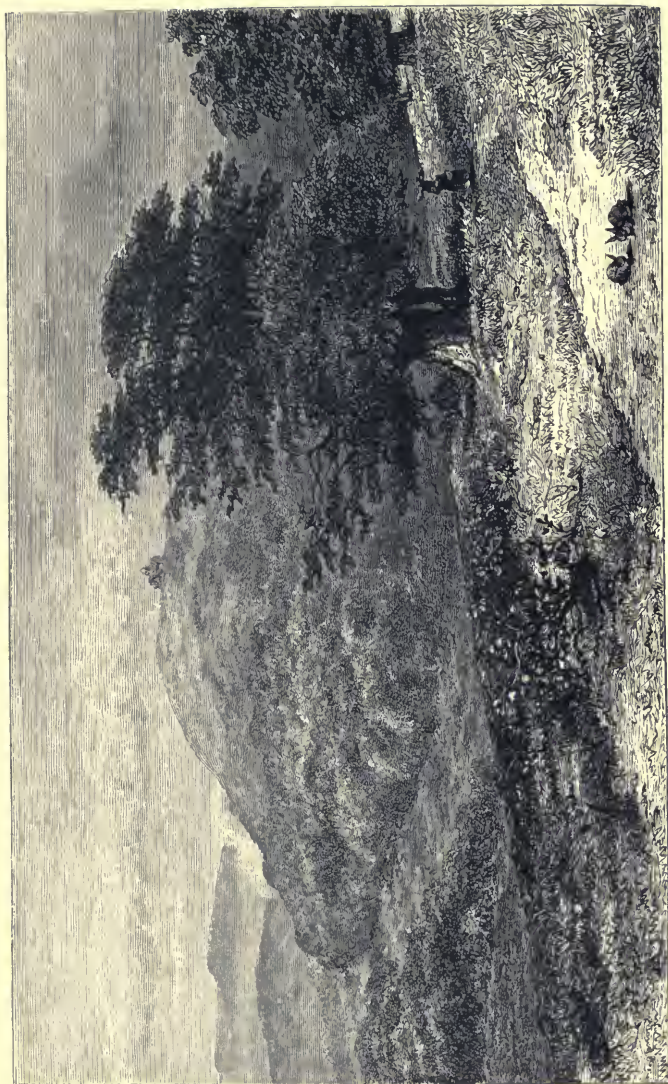
AMONG THE CHALK DOWNS. ST. MARTHA'S CHAPEL, FROM NEWLAND'S CORNER.