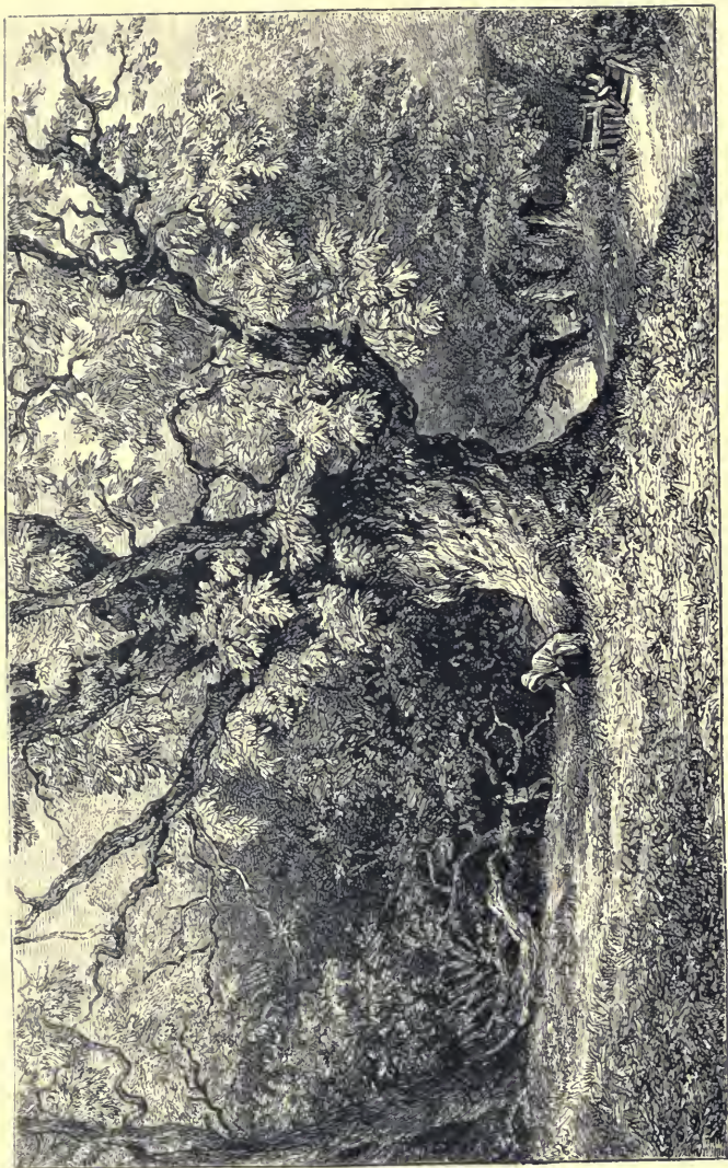
ENGLISH PARK SCENE. BETCHWORTH, SURREY.