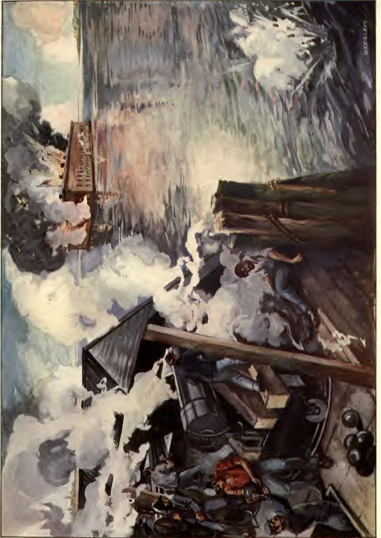
THE BOMBARDMENT OF FORT SUMTER