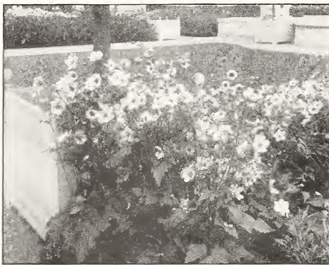
Anemone Japonica. See page 7.

ECHINOPS ritro , also called Globe Thistle , is a plant of coarse growth, with thistle-like heads, quite interesting and really very beautiful. Very hardy anywhere, and well adapted to grouping. 3 feet. 25 cts. each, $2.50 per doz.