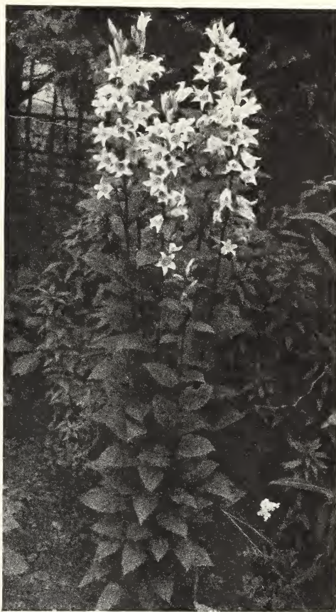
Campanula Lactiflora Caerulea

Minneapolis. —The stock which you sent me last year came in wonderful shape.