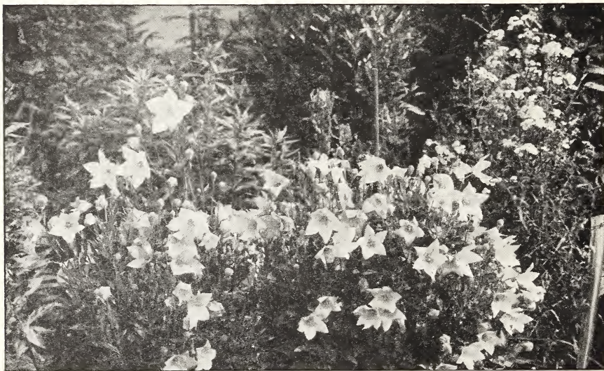
Dwarf Campanulas (see page 15)

Pennsylvania. — I never before received plants put up as nice as yours are, and I am pleased with what I have growing.