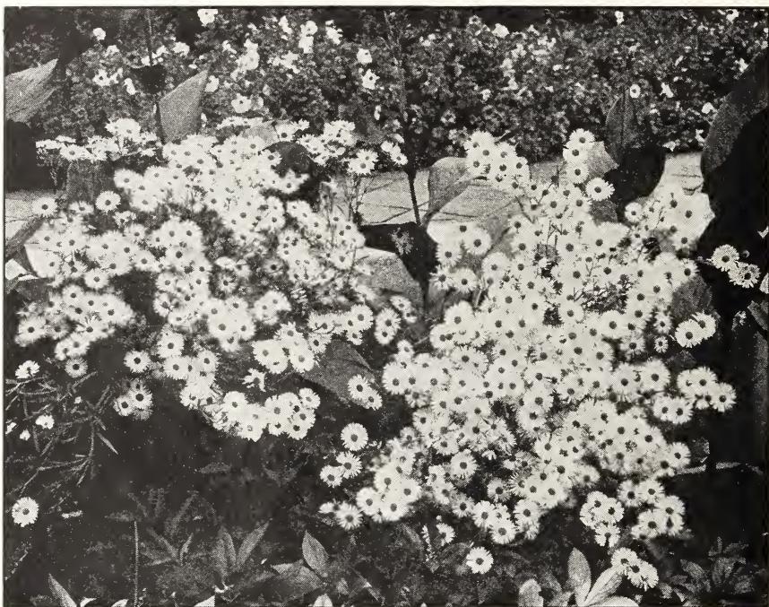
Boltonia Asteroides , much like Michaelmas Daisies in habit

Their culture is most easy. They will do fairly in any garden soil with moderate watering and either in full sun or very light shade. The very best results will be had in a rich, well-worked soil of any class with rather abundant watering. Plant 15 to 18