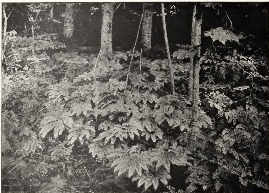
Adiantum pedatum , Five-Finger Ferns

most pleasing green and very fragrant. They die to the ground in the winter, but make an astonishingly rapid growth in the early spring. I especially recommend planting this with other Ferns liberally in new beds, for they grow almost as well the first year as afterward, and keep the bed attractive while slower Ferns are establishing themselves. Very large plants, $1 each. Good plants 50 cts. each, and very satisfactory small plants at 25 cts. each. Special rates on quantities.