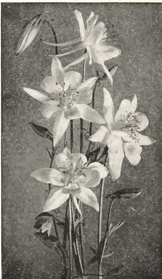
Handsome, showy, dainty, graceful Columbines

This wonderful race was secured by crossing A. caerulea blue, A. chrysantha yellow, and A. skinnerii for orange and scarlet tints. The resulting race is easily amongst the finest of all garden flowers. There are no blues quite so delicate as the delicate A. caerulea , but still they are fine. They come mixed and are in whites, creams, blues, pinks, and some tending to rose-purple and many in scarlet and orange. I have several of the noted strains and this year offer my Scotch Strain with the largest flowers that I have seen and mostly in white, cream, and soft pink shades. 30 cts. each, $3.00 per doz. Dreers Hybrids are a good well-mixed strain. 25 cts. each, $2.50 per dozen. Rose Queen . See "Not Novelties." All three extra fine plants, sure to flower.