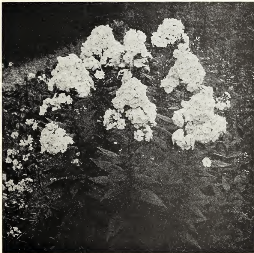
Phlox is seen to best advantage in masses with a background of greenery

New Jersey.—The bulbs you sent me last year are in splendid condition and are the joy of my garden. Every one just now is infatuated with the Dog's-Tooth Violets, both pink and yellow, which are in full bloom.