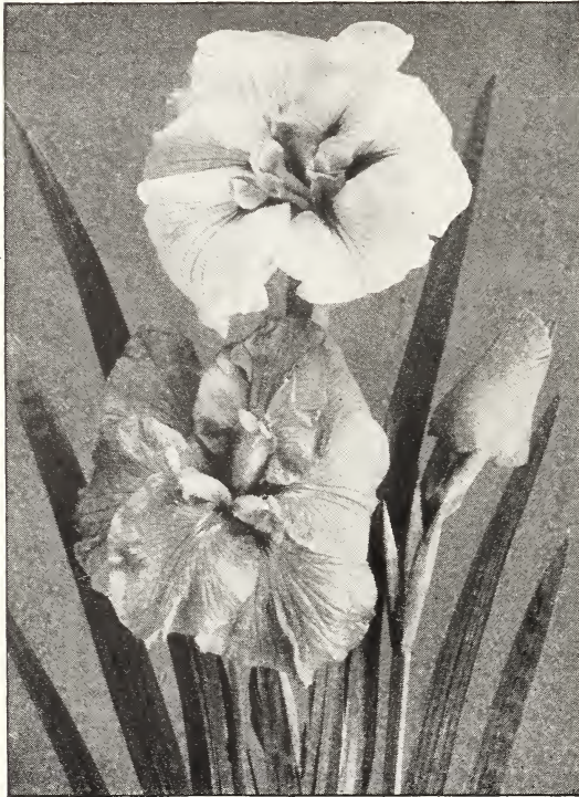
Glorious, beautiful Japanese Irises

Japanese Irises are gloriously beautiful plants worth much trouble for success. At their best the stiff stems are 4 feet in height, the brilliant flowers 6 inches or more across, the foliage bold and striking. The colors are delicate and the texture of the