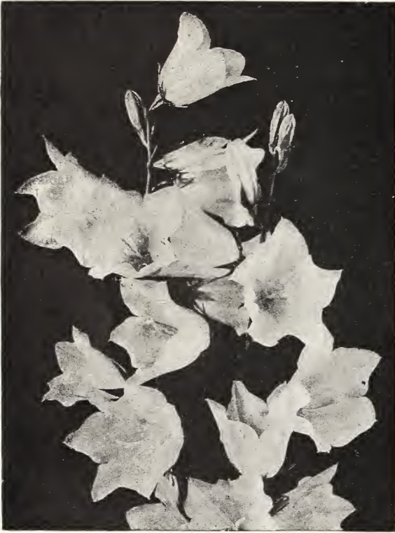
Campanula persicifolia. Flowers blue or white, bell-shaped

stems a foot or so high, bearing a dense head of violet-blue flowers. Fine border plant. 25 cts. each, $2.50 per doz.