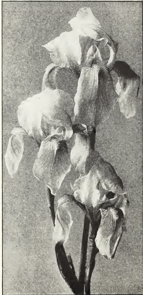
In the flower the upright petals are termed the "standards," while the bottom drooping petals are known as "falls."