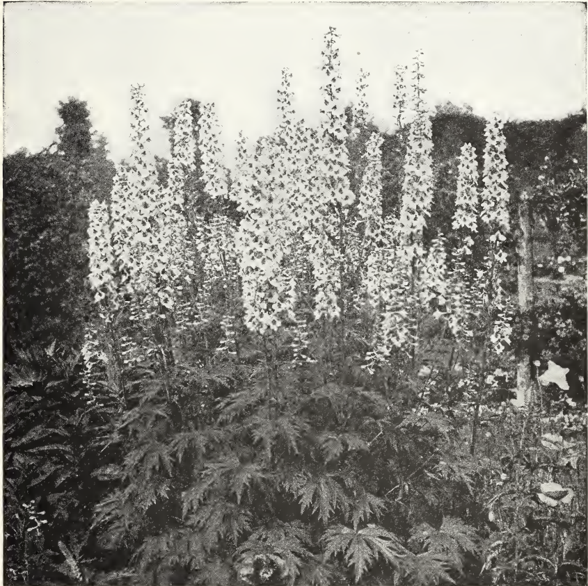
Delphiniums are tall, stately and excellent for cutting

CYNOGLOSSUM. Our California Hound's-Tongue, Cynoglossum grande , has proved hardy in Massachusetts. Its leaves are large, and it is a bold, strong plant. Many blue flowers are borne in early summer, each white-rimmed at its center. 20 cts. each, $2.00 per doz.