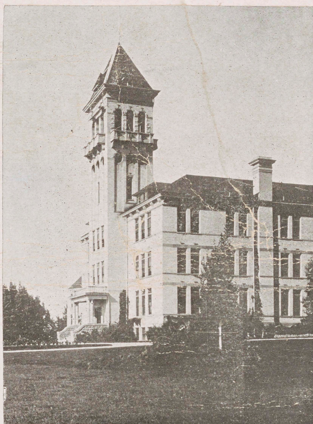
The Utah Agricultural College, representing the State and the United States Department of Agriculture, is utilizing a large part of its Student Body, its Regular Teaching and Experimental Force, as well as its Extension Division, to the end that Utah, as always in the past, may do more than its full duty in the present critical agricultural and food situation.

M oreover, they must, O n all sides, increase the acreaage now R eceiving cultivation. E very farmer