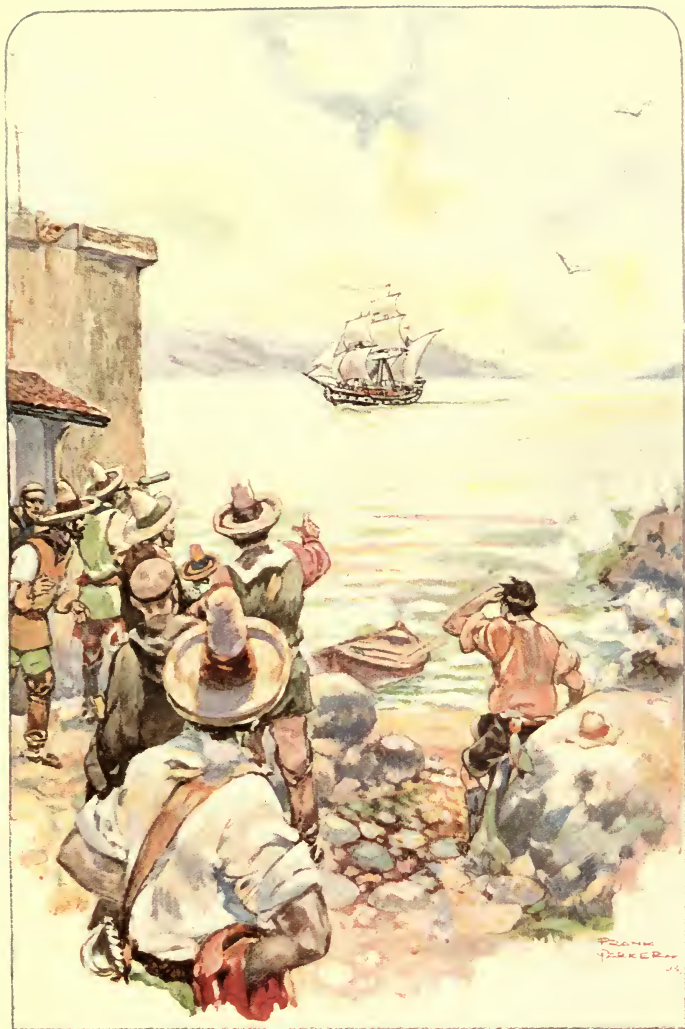
What he had taken for a pile of fallen rocks was a fort and a group of excited men at its gates. Page 9.