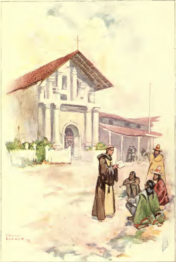
The white red-tiled church *** built of adobe, with no effort at grandeur but with a certain novel simplicity of outline. Page 72.