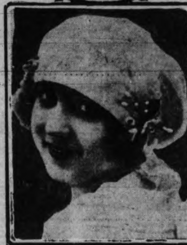
STILL HOPE TO GET HUSBANDS —These three chic Parisian young ladies are wearing St. Catherine's bonnet because they haven't found a husband yet. But they still have hopes. On her feast day, the French and French-Canadians celebrate the quaint ceremonies of bonneting all the old maids. On this day in Paris, old maids, protected by the bonnet of St. Catherine, can flirt and make eyes as much as they please. French and French Canadians alike refer to spinsters of a certain age as having "bonneted St. Catherine," meaning either that they have donned St. Catherine's bonnet, or that they could qualify for the ceremony of placing a bonnet on St. Catherine's statue which is also a yearly rite. The ceremony is in honor of St. Catherine of Alexandria, who remained obdurate even to the impassioned wooing of the Roman Emperor Maximianus, by whom she was ultimately put to death.