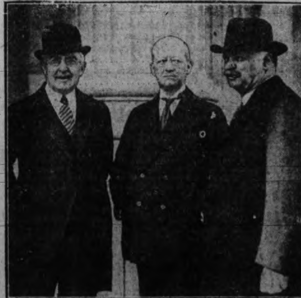
HOLD POWER AT WASHINGTON —The two men upon whom has fallen the mantle of the late Senator Henry Cabot Lodge are shown above, together with the newly-elected Senator from Rhode Island. Left is William Butler of Boston, chairman of the Coolidge presidential machine, and recently appointed as senior senator from Massachusetts, to serve out the unexpired portion of Lodge's term. Centre is Senator Jesse H. Metcalfe of Rhode Island, who is expected to be a power around the Capitol, despite the fact that he is a newcomer. Right is Senator Charles Curtis of Kansas who succeeds Lodge as leader of the majority party in the Senate.