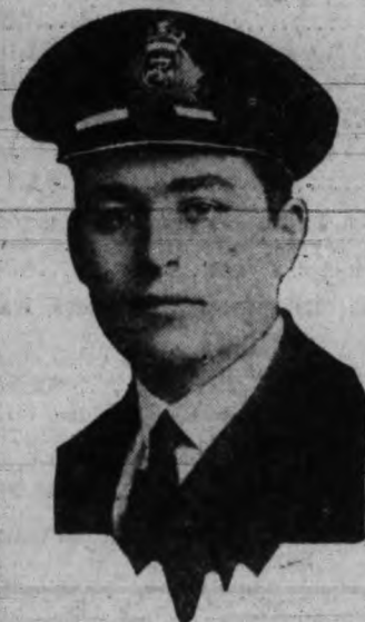
QUITS LLOYD GEORGE —Lieut.-Com. J. M. Kenworthy, who is one of the group of radical Liberals who have refused to follow the lead of ex-Premier Lloyd George, Kenworthy is the eldest son and heir of Baron Strabolgi.