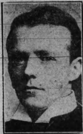
GOES OWN WAY —Walter Runciman, most prominent of the group of British Liberal members who have resolved to go their own way in the House.