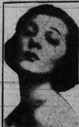
ILL —Miss Gertrude Lawrence, co-star with Beatrice Lillie, in "Charlot's Revue," is in Wellesley hospital Toronto, suffering from pneumonia.