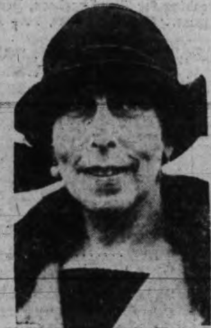
WOULD SET UP COURT —Grand Duchess Cyril of Russia who has just arrived in New York. She was accompanied from the liner to her hotel by a detachment of motorcycle police, since demonstration were feared as the result of the action of her husband in having declared himself as emperor of all the Russians and in having launched an anti-communist campaign.