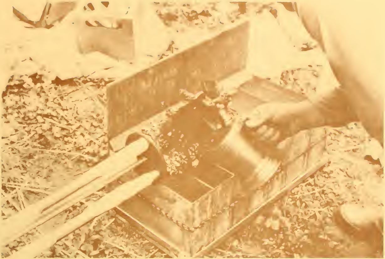
Figure 5. Thawing sample with a blowtorch (note subsampling tray).

subsampler and thawed with a blowtorch fueled with white gasoline (fig. 5). Sediments freed from the core drop directly into the boxes below. Large particles in the sample can be dislodged with a cross-peen or rock hammer and placed in the appropriate boxes.