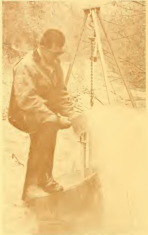
Figure 1. Tri-tube sampler in operation.

but the freeze-core sampler was more accurate (Walkotten 1976). It is also more versatile, functioning under a wider variety of weather and water conditions, but it has a disadvantage. The gravel cores obtained by the single-tube, freeze-core sampler are often too small to allow the core to be stratified into representative subsamples.