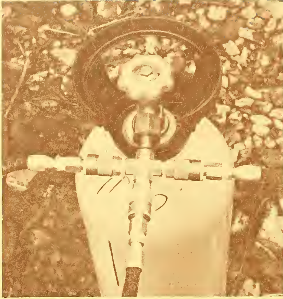
Figure 2. Carbon dioxide storage tank with hand-wheel valve and three-way delivery manifold with nut-gland attachments.