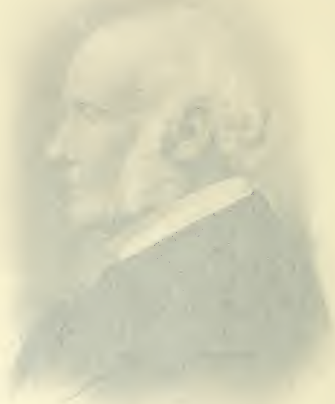
From a photograph taken in 1892