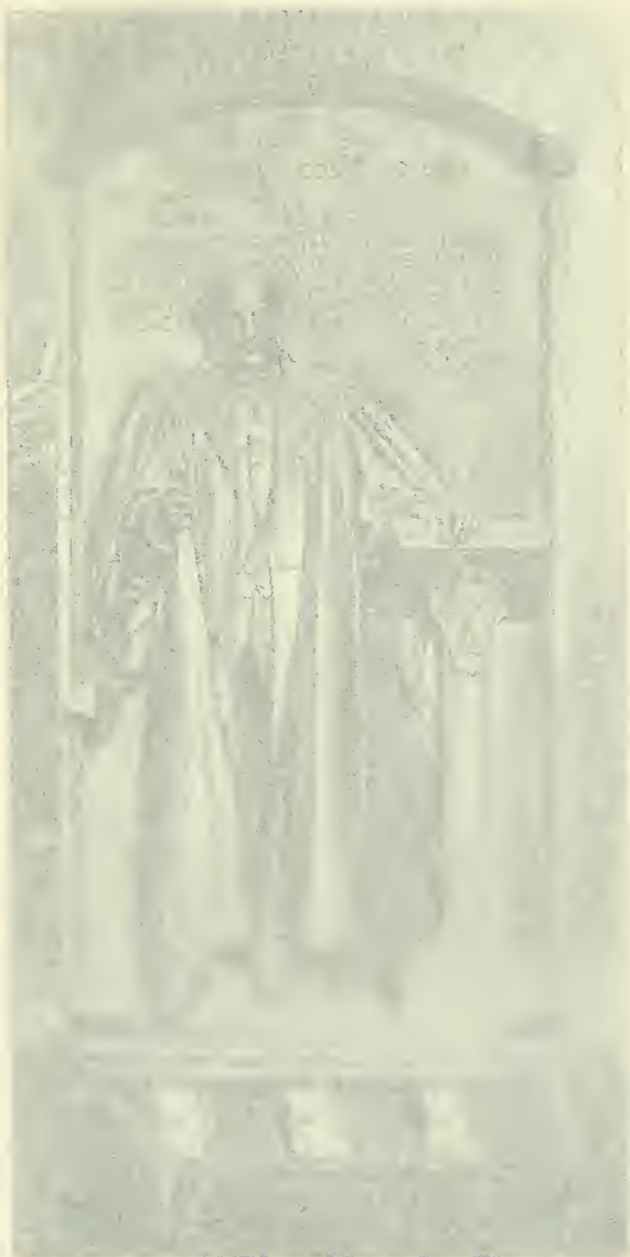
From the Alto-Rilievo by St. Gaudens in the Marquand Chapel, presented in 1889 by the Class of 1879