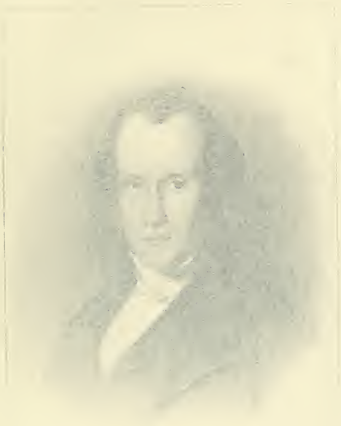
From a portrait painted in 1847