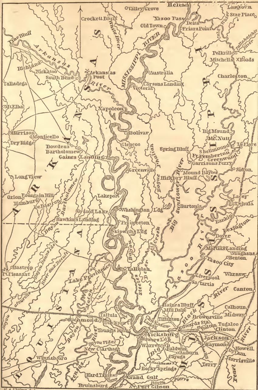
THE VICKSBURG CAMPAIGN.