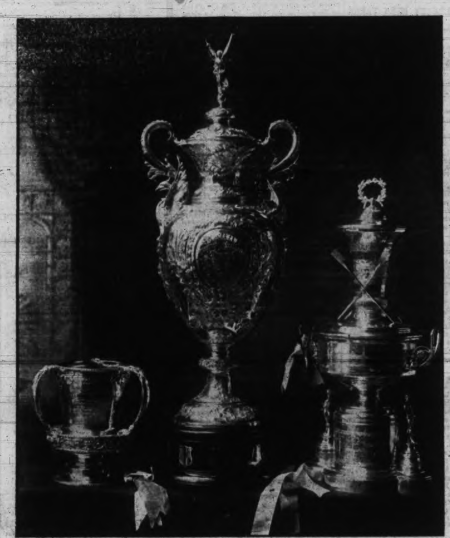
Some J. B. A. A. Trophies-Famous Buchanan Cup in Centre.