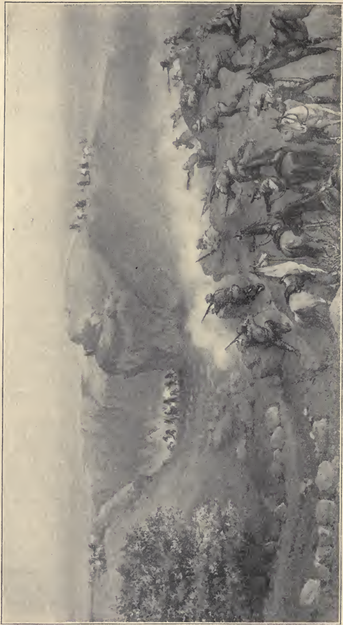
POCKET CAÑON FIGHT BETWEEN HUNTERS AND COMANCHE WARRIORS, AT EASTERN EDGE OF STAKED PLAINS.