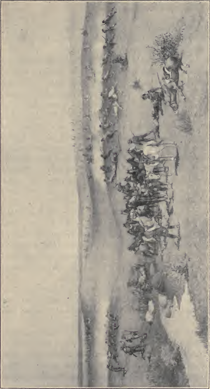
BUFFALO-HUNTERS FIGHTING COMANCHES AND APACHES, MARCH 18, 1877, ON THE STAKED PLAINS.