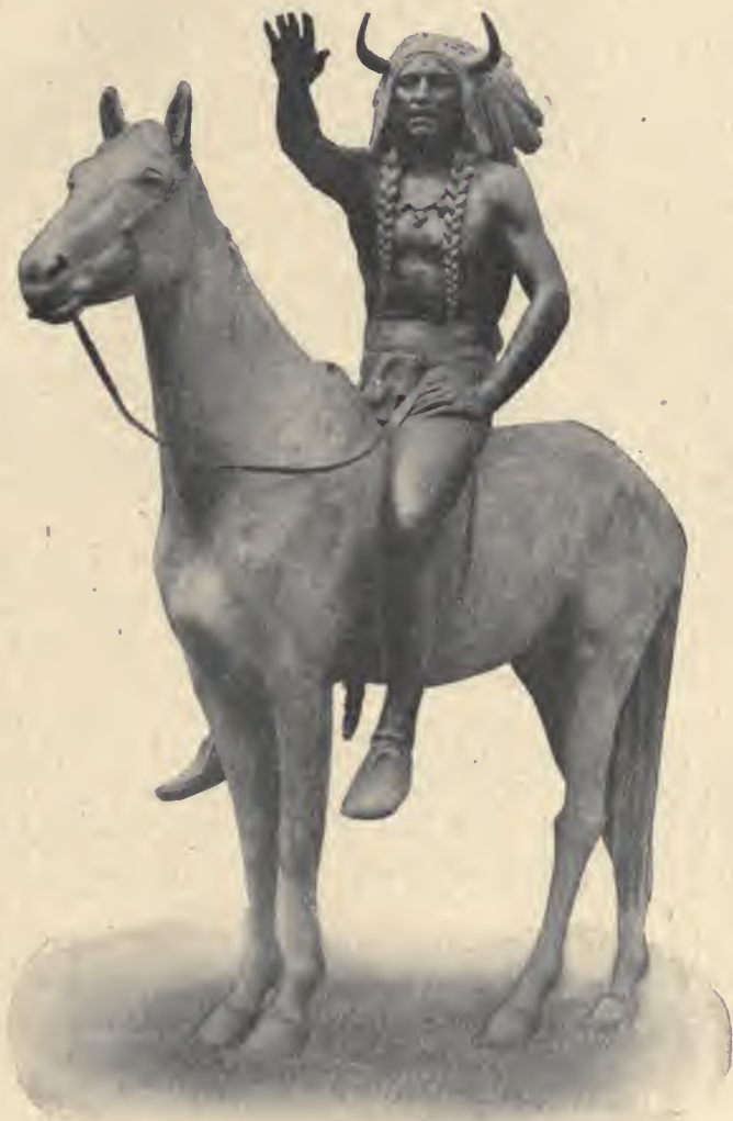
COMANCHE MEDICINE MAN.