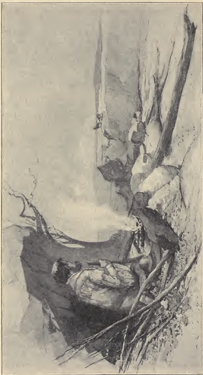
COOK SERENADED BY WOLVES.