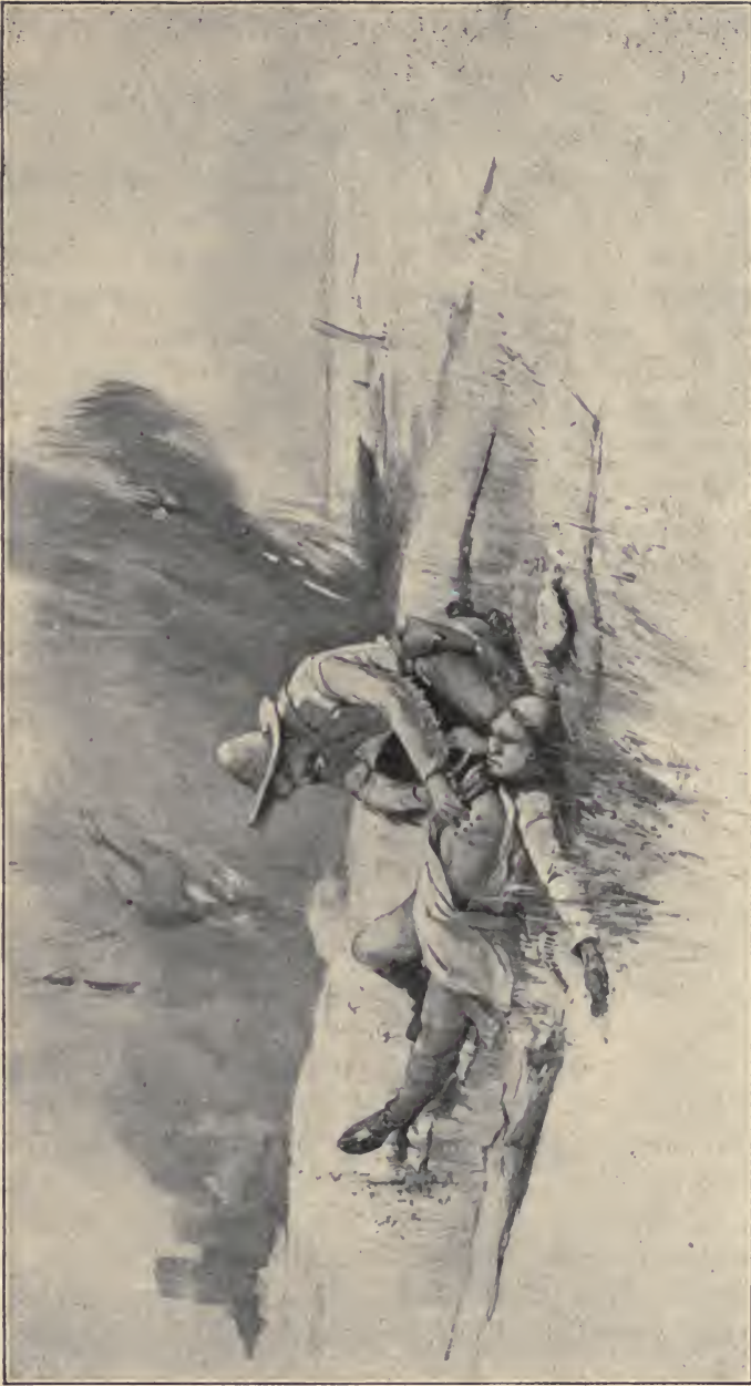
SOL REESS FIGHT WITH INDIAN.