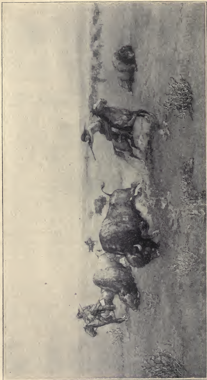
INDIANS KILLING BUFFALO IN TEXAS.