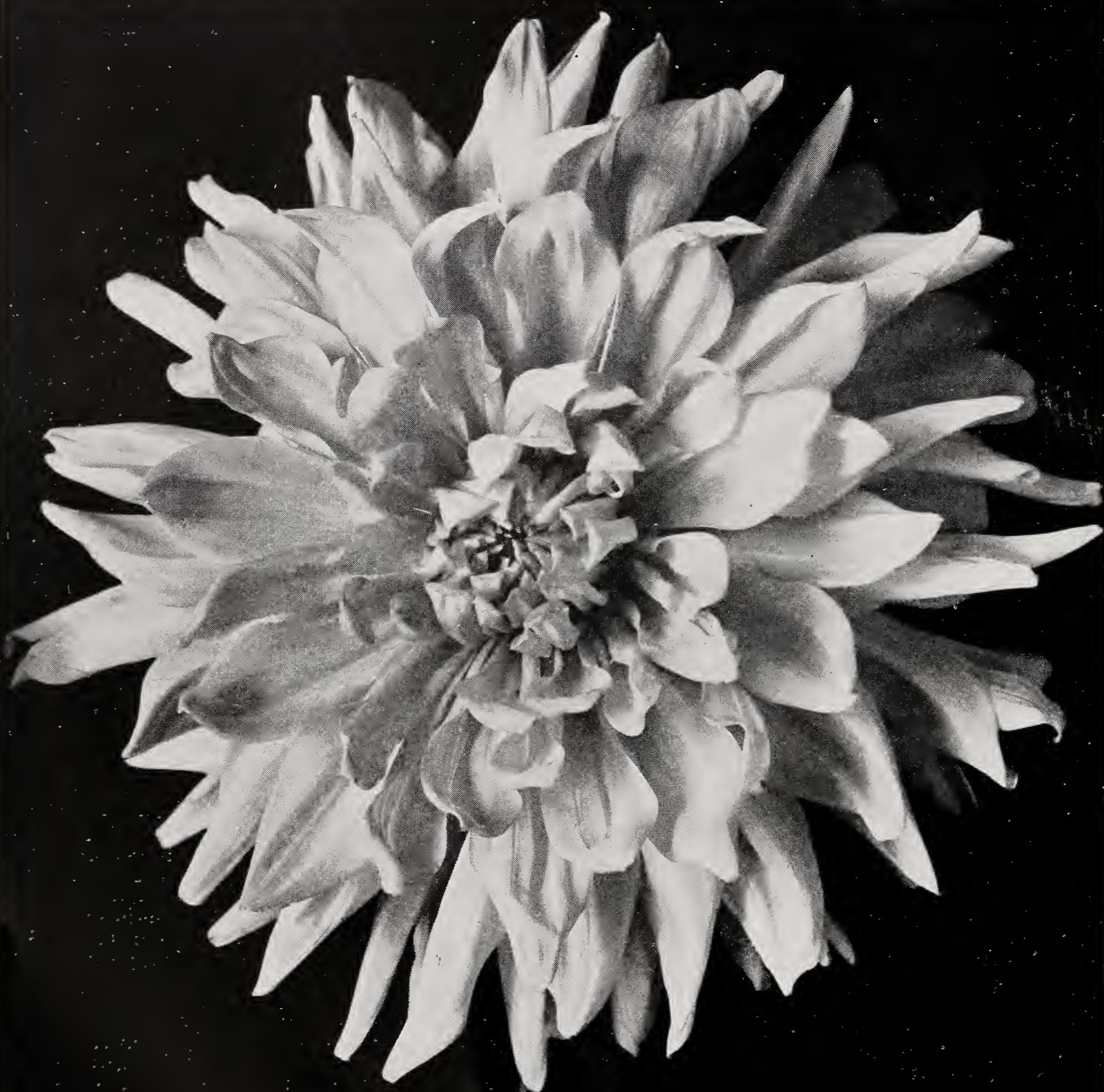
Glory of California