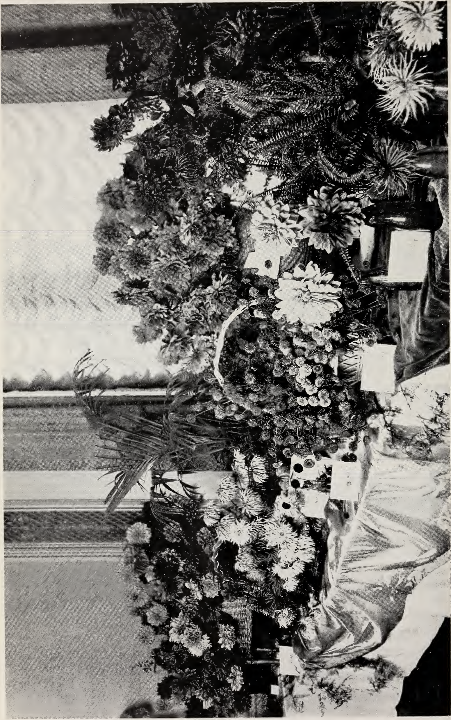
A partial view of our recent exhibit, which won First Prize for the "Most Artistic Exhibit" awarded by the Dahlia Society of California, at the Palace Hotel. Our prize-winning vase of fifty "Ammun Ra" can be seen in the window. The sunlight, shining through the golden amber curtains enhanced the beauty of these magnificent blossoms. In the foreground is our basket of California Pompons, which won First Prize.