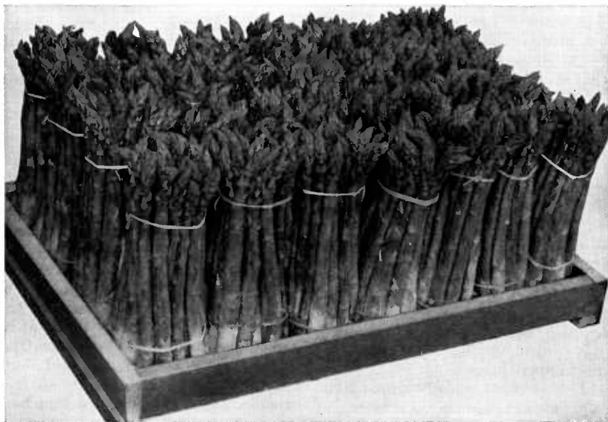
Figure 4. —Bunches of asparagus placed on damp moss in flat to keep them fresh.