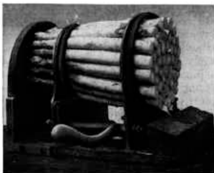
Figure 6.—One type of asparagus-bunching device. Note that the spears have been cut to a uniform length.

Where asparagus is grown in large quantities for commercial purposes it is essential to have a mechanical buncher for holding the stalks while they are being bunched and tied. There are various devices on the market for this purpose (fig. 6). Some of the large plantations are equipped with machinery that cuts the spears to the desired length, but much of the trimming is done by hand. A large number of spears can be trimmed at one operation by placing them in a frame which holds all the tips even, and the extra length of stem can then be cut off with a large knife.