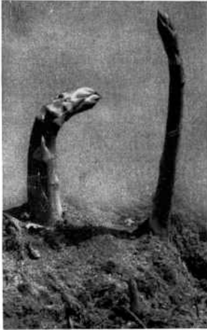
Figure 2. —The deformed spear on the left is a typical result of cutting-knife injury to young shoots. Growth is slowed down on the injured side of the young shoot, and the spear develops with a pronounced crook. Shoots damaged by cutworms are deformed in the same way.

causes them to develop into crooked spears (fig. 2).