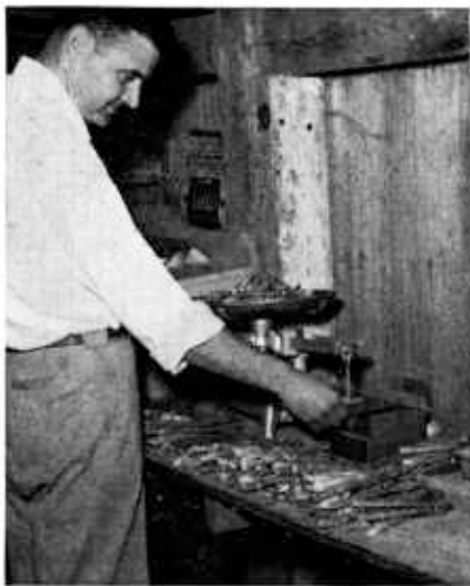
Figure 5.—This inspector has selected a representative sample from a shipment of asparagus and is inspecting it to determine the grade. Grading procedures vary in different parts of the country and for different markets.

The present specifications classify asparagus on diameter of stalks as follows: Very small, less than \frac{5}{16} inch; small, between \frac{5}{16}