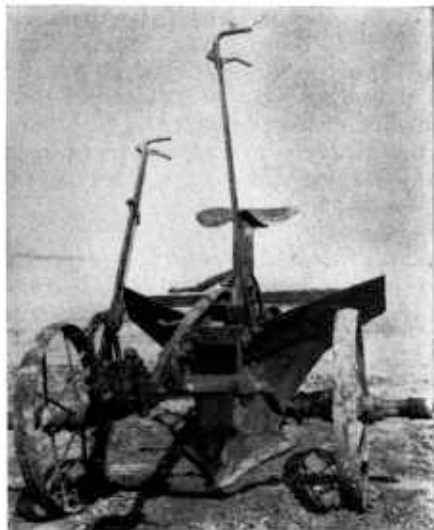
Figure 1.—This implement is one type used to open furrows for setting asparagus crowns. The blade can be adjusted to make furrows of the proper depth.

The soil in which asparagus crowns are to be set should be plowed deep and worked down by thorough disking. Furrows for the crowns can be opened with a lister or some other suitable implement (fig. 1), the depth of the furrow depending on the soil type. A deeper furrow is required in loose soil than