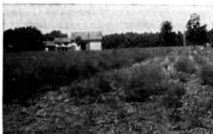
Figure 9.—An old asparagus field killed out by rust (foreground). The new field of the Reading Giant variety on the left was grown as a breeding field for rust-resistance work.

slightly less resistant than Martha Washington, is sufficiently resistant for planting except where rust attacks are severe. The earliness and large size of Mary Washington make it especially desirable for general planting. When first introduced, the two Washington varieties generally showed a high resistance to rust, but of late years there have been occasional losses from rust on varieties reported to be either Mary Washington or Martha Washington. It is possible that high rust resistance may not have been maintained in some stocks of these varieties, or possibly there are strains of the rust fungus to which they are not highly resistant. When buying either of the Washington varieties, the grower should obtain information regarding the previous performance of the stock with respect to rust resistance.