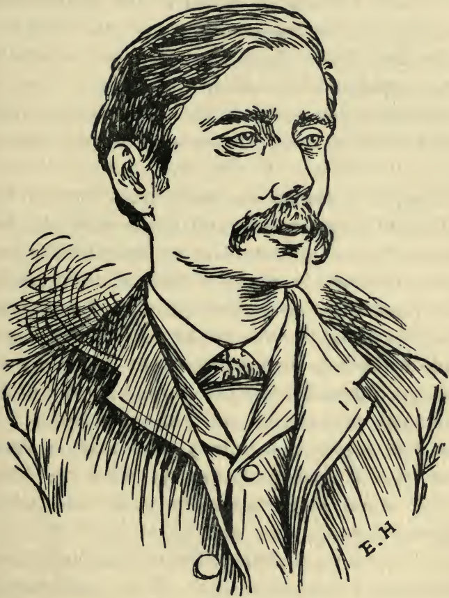
H. G. WELLS, 1899