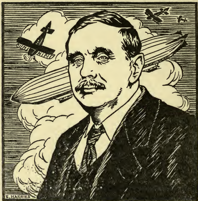
H. G. WELLS