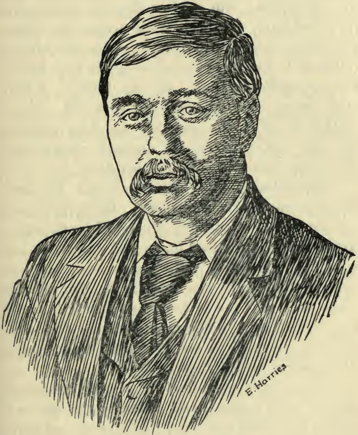
H. G. WELLS, 1901