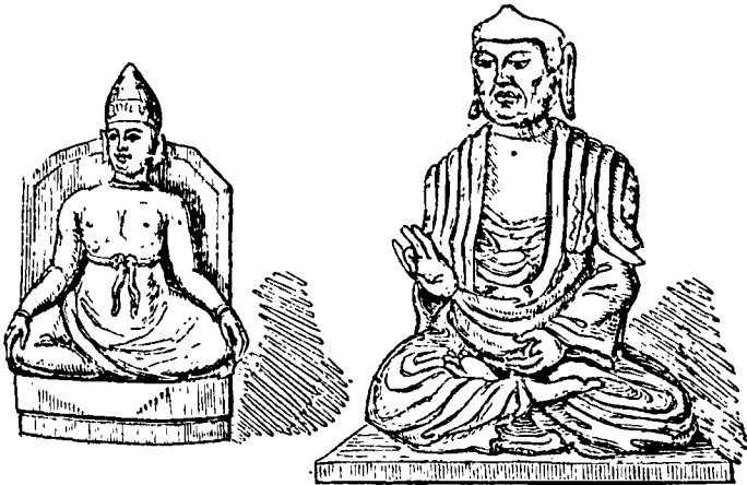
Images of the Cochin Chinese Buddha.

“The population of the hills appeared to be extremely scanty. We saw but two villages. The inhabitants spoke the Burman language, but were dressed in the costume of the Shans. There is, however, a wild race on the mountains, known to the Burmans under the name Danno, but we saw none of them.”