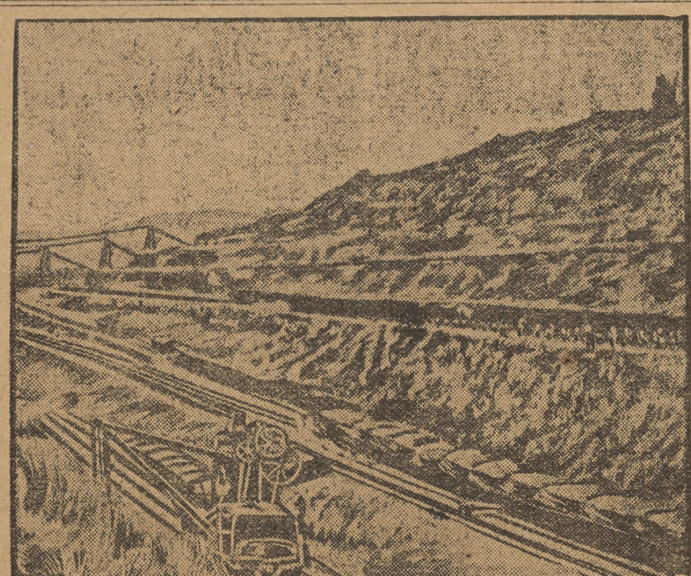
VIEW OF THE PANAMA CANAL, IN THE CULEBRA CUT.