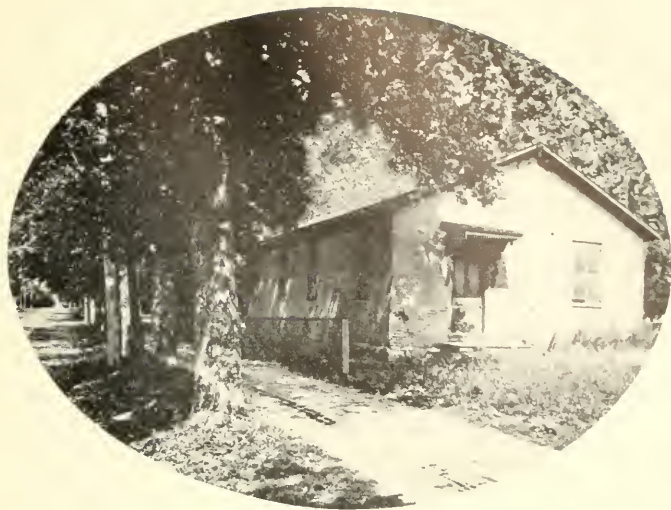
SCHOOLHOUSE AT WARSAW, ILLINOIS