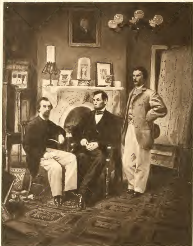
Lincoln and his Secretaries Nicolay and Hay