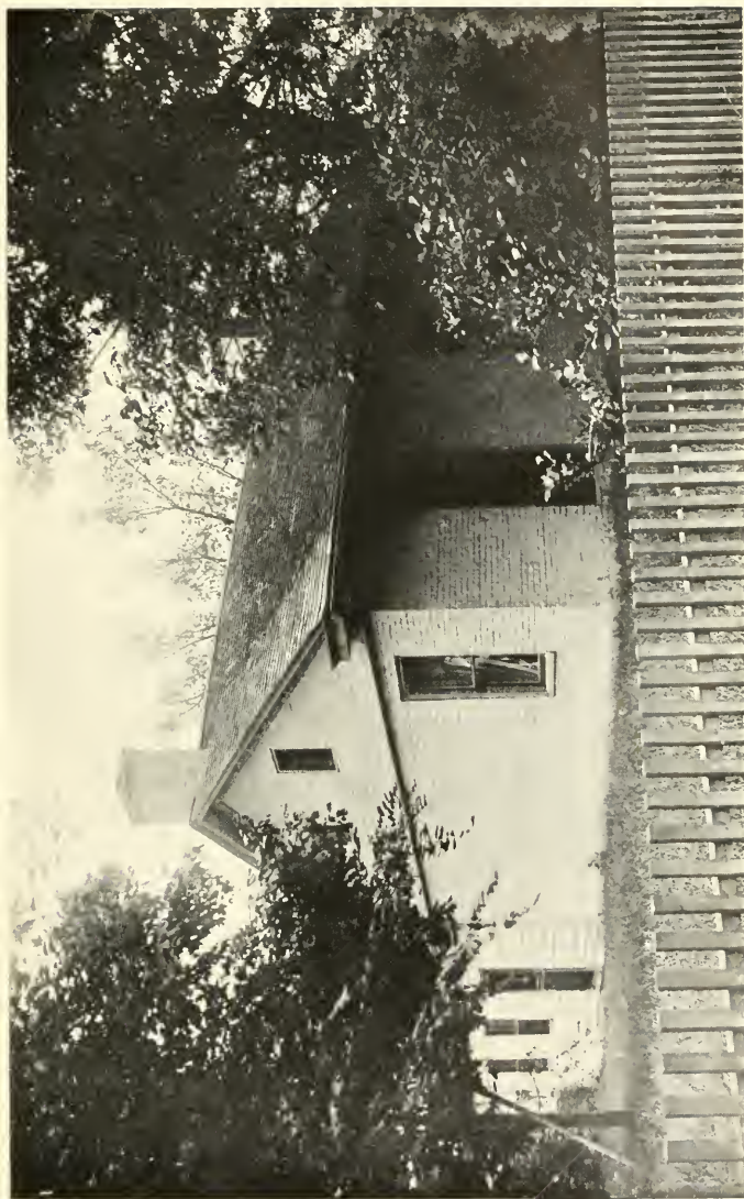
JOHN HAY'S BIRTHPLACE, SALEM, INDIANA