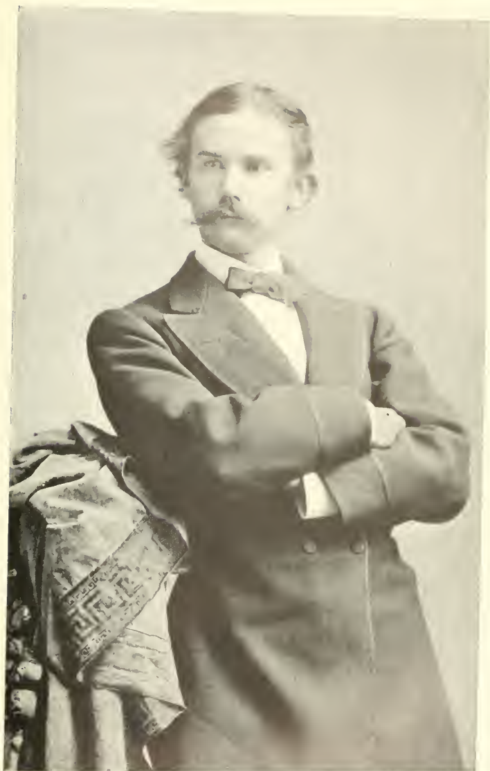
JOHN HAY AT THE TIME OF HIS MARRIAGE IN 1874