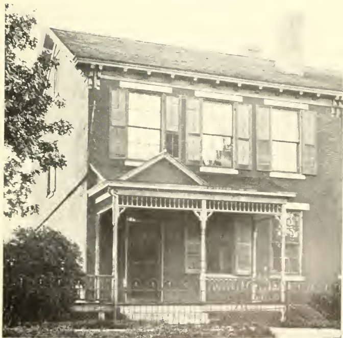
JOHN HAY'S EARLIEST HOME AT WARSAW, ILLINOIS