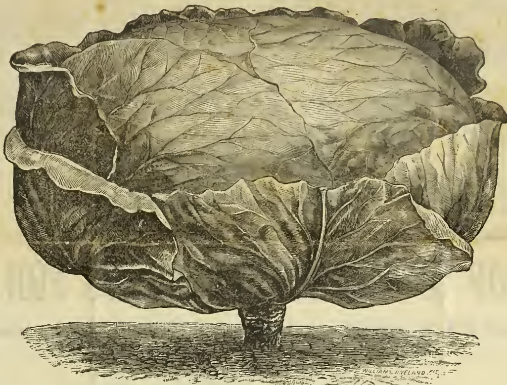
CABBAGE. BUCKBEE'S MAMMOTH LATE FLAT DUTCH.