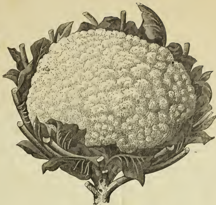
CAULIFLOWER—Extra Early Favorite.

NO ORDER IS COMPLETE WITHOUT H. W. BUCKBEE'S EARLY NEW QUEEN CABBAGE.