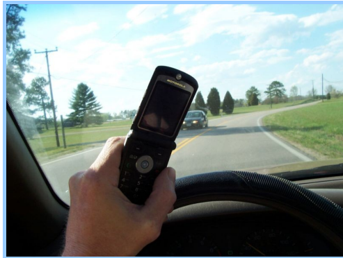
Mobile phone in use while driving.

hand held devices while driving. Botswana and New Zealand are debating similar measures.