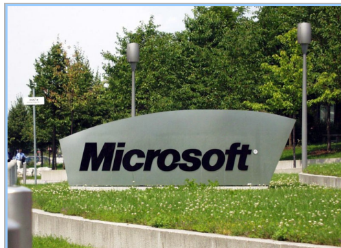
Microsoft's logo at a German campus.

The visit to Microsoft follows her meeting with United States President Bush.