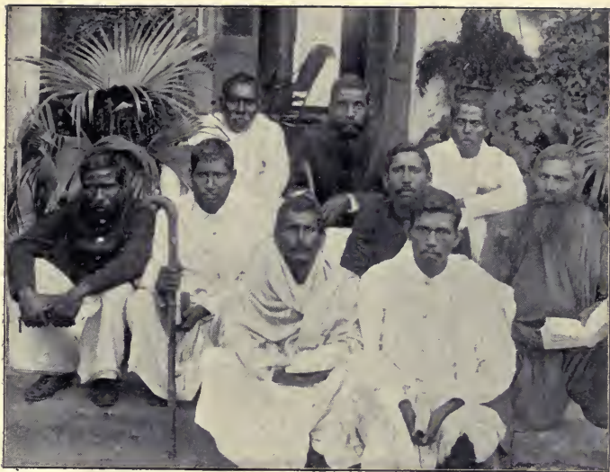
A GROUP OF NATIVE PREACHERS. ORIYA AND BENGALI.