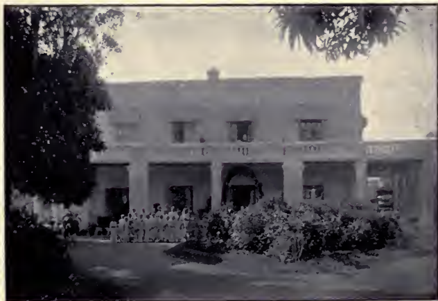
MISSION HOUSE AT BALASORE.