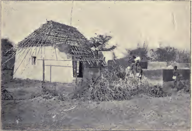
BUILDING A MUD HOUSE.