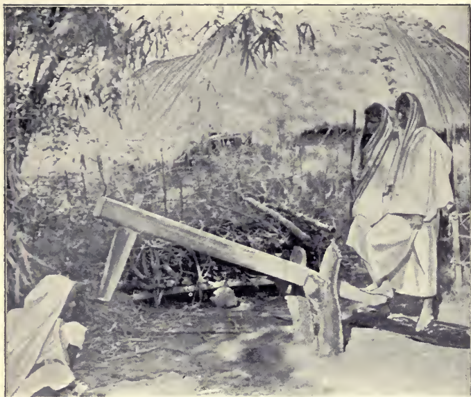
WOMEN HULLING RICE.