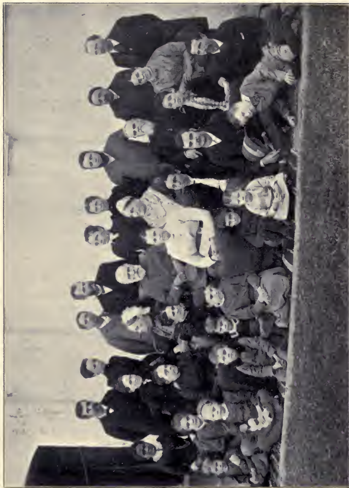
A GROUP OF FREE BAPTIST MISSIONARIES OF SOUTHERN BENGAL, 1893.