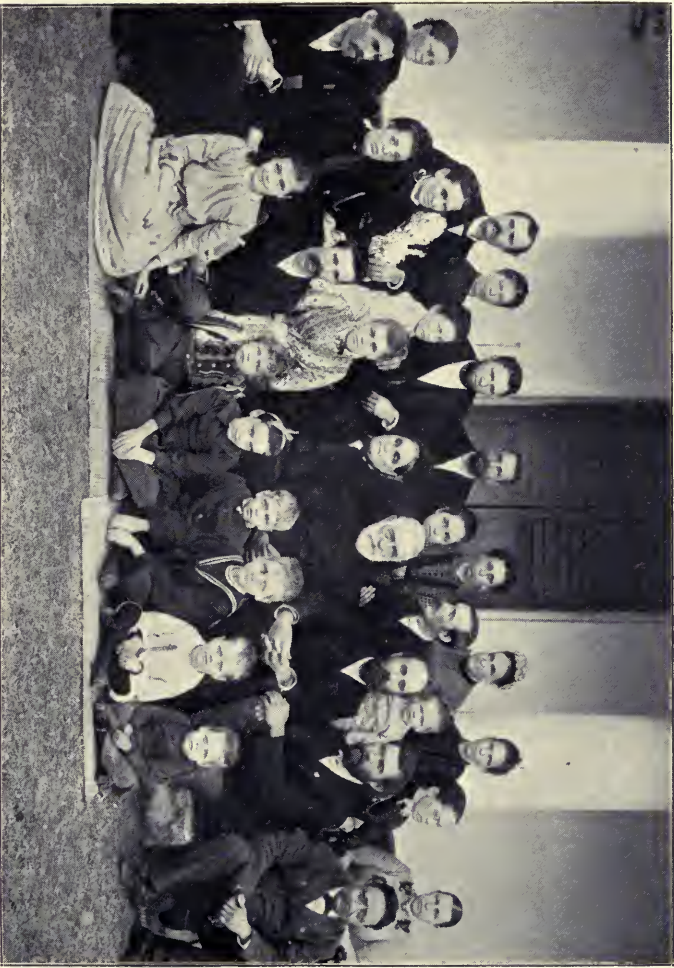
GROUP OF FREE BAPTIST MISSIONARIES IN SOUTHERN BENGAL, 1891.