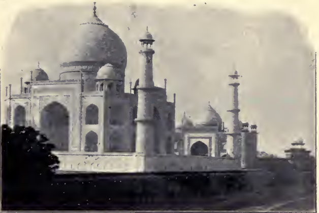
TAJ MAHAL AT AGRA.