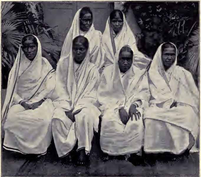
A GROUP OF ORIYA CHRISTIAN BIBLE WOMEN.