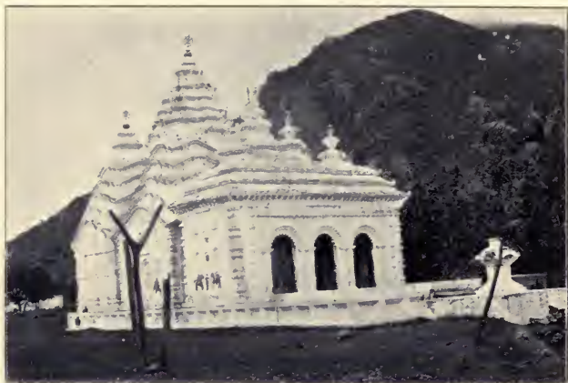
TEMPLE OF JUGGERNAUT