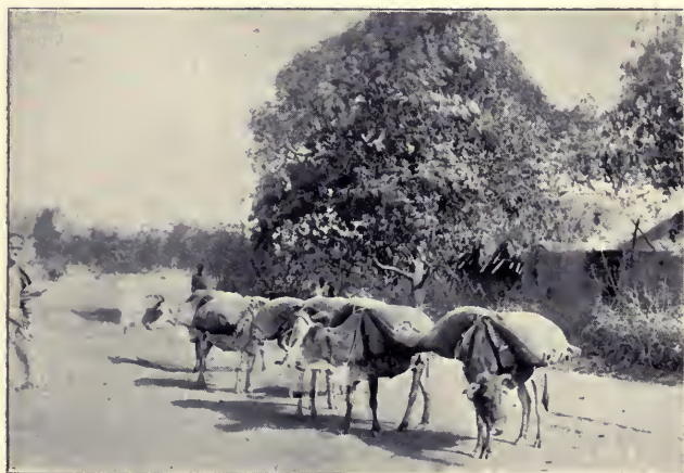
BULLOCKS TAKING RICE TO MARKET.