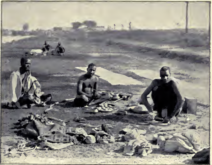
PILGRIMS GOING TO JUGGERNAUT.