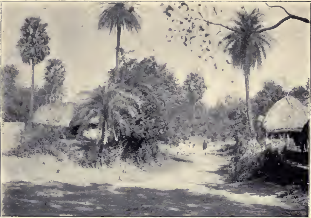
A BENGAL HINDU VILLAGE.