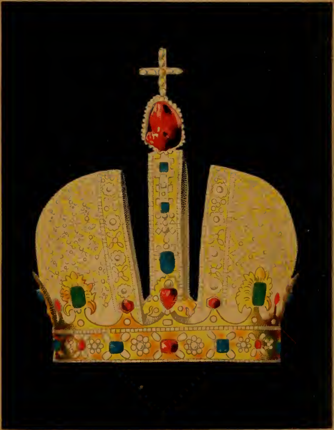
CROWN of the EMPRESS ANNA IVANOVNA RUSSIA.