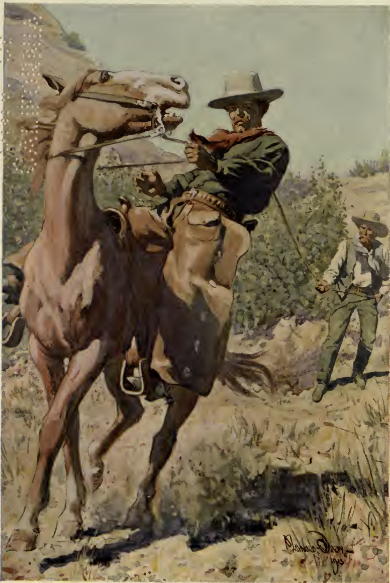
Suddenly a rope . . . yanked him from the saddle