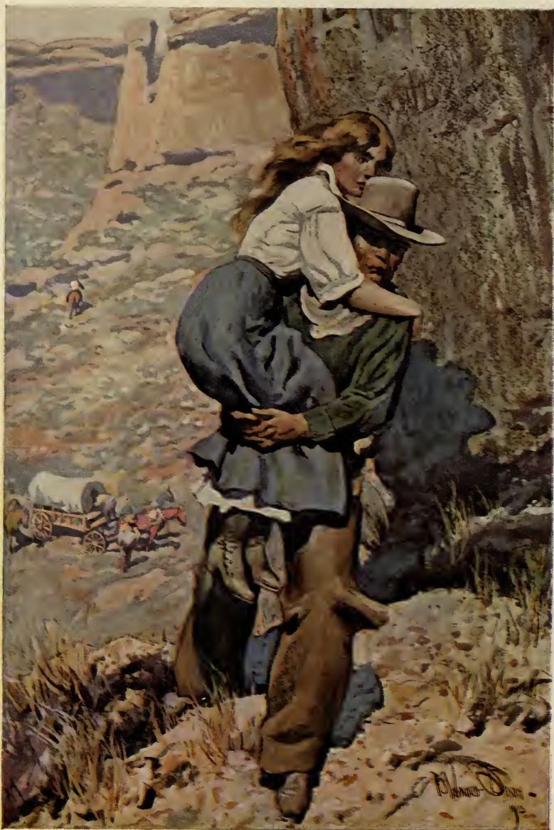
"It's Injuns, close after us"