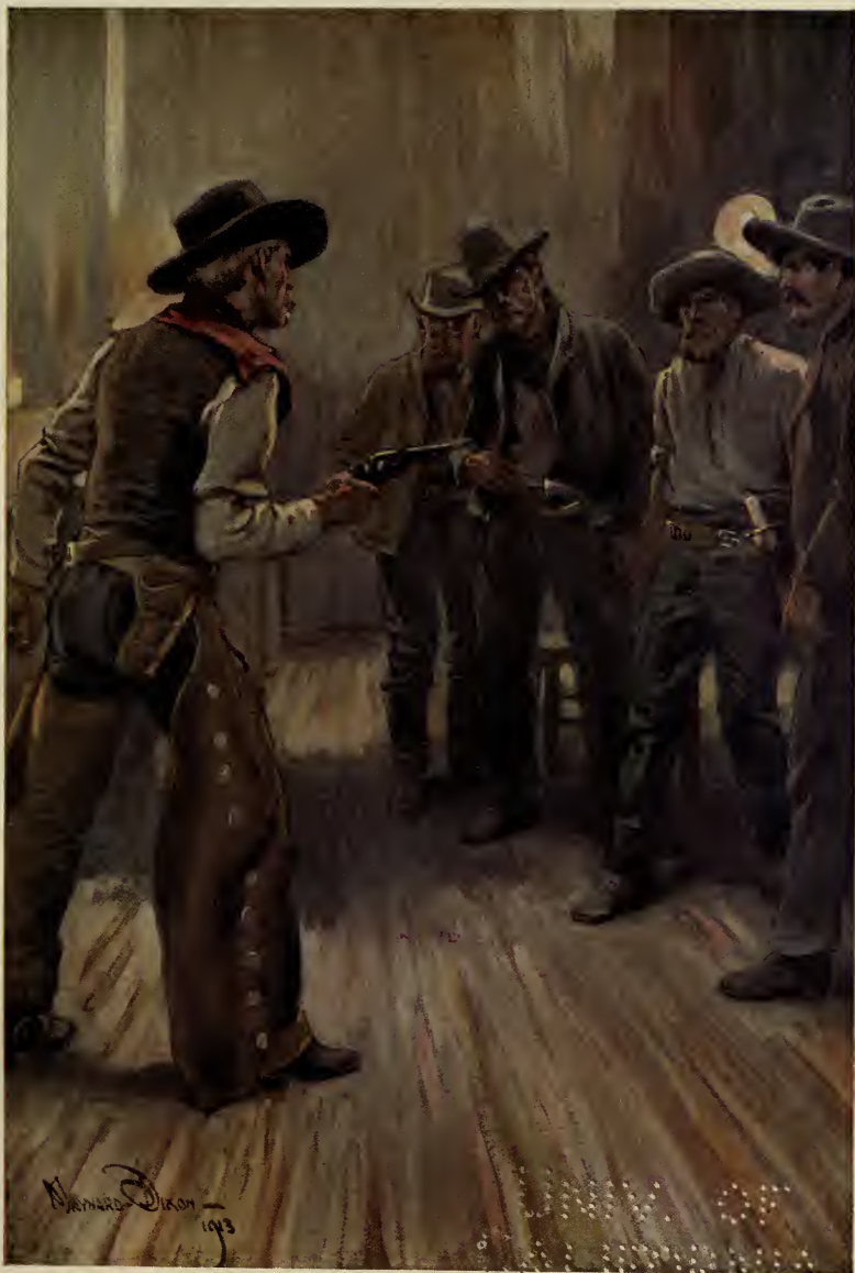
“Yo’re a liar!” rang out the vibrant voice of the cowman