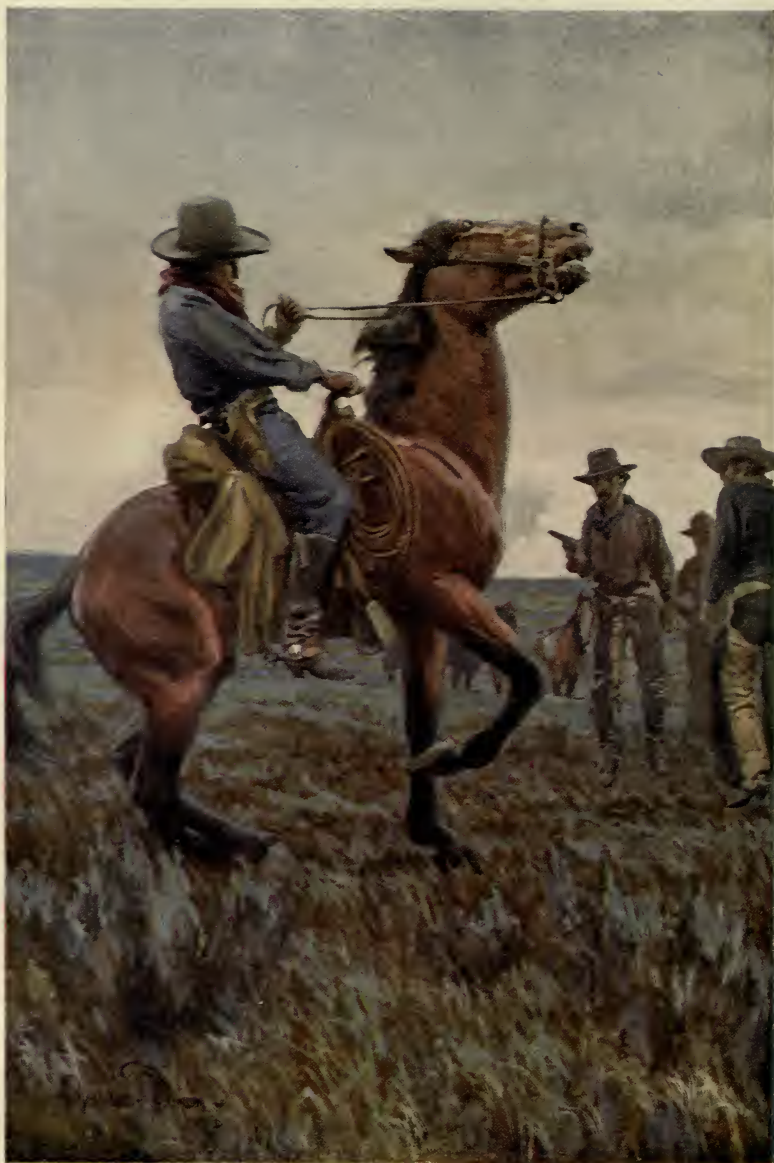
There was a sharp report