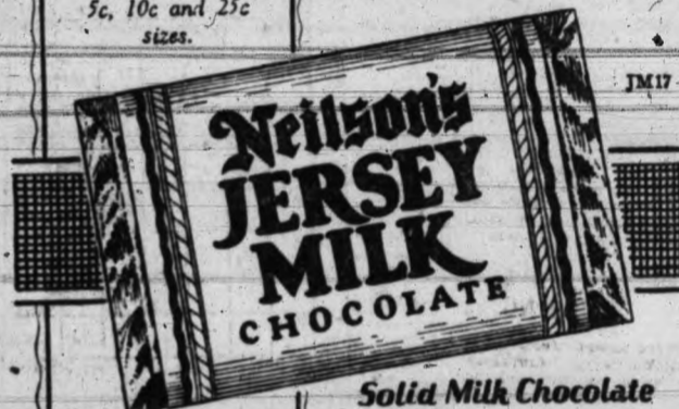
Solid Milk Chocolate