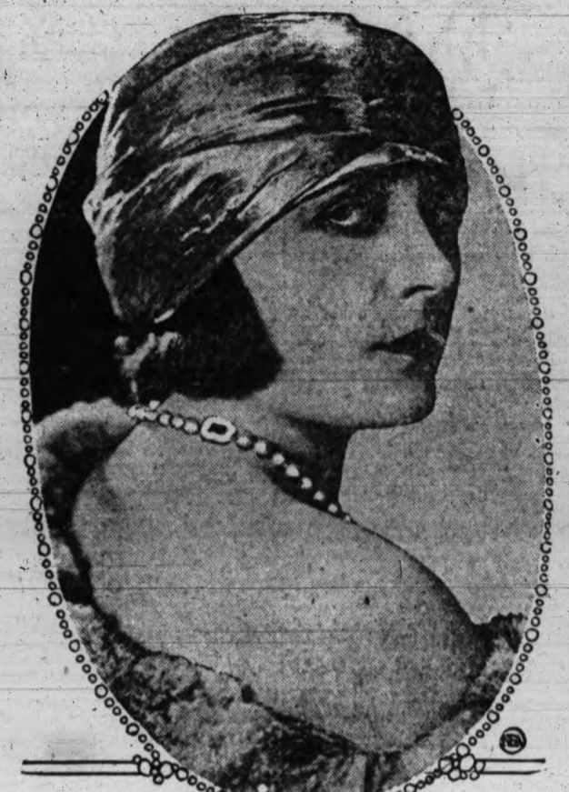
TURBAN HIDES POLA'S BOB —When Pola Negri got to Paris she found her short bob wasn't quite the latest thing. So Pola promptly got three jump ahead of everybody else by introducing this silver band turban, which not only concealed her bob but put her right in fashion's front rank. And that's that.