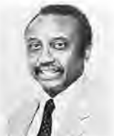
John Chaney Head Coach