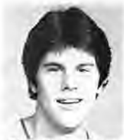
Blair Rasmussen Center