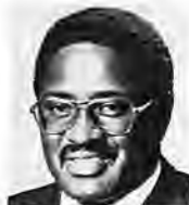
Willis Reed Head Coach