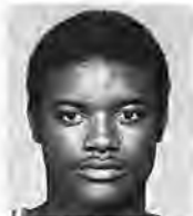
Benoit Benjamin Center