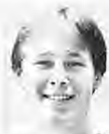
Andy Franklin Center