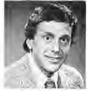
Larry Brown Head Coach