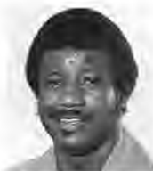
Nolan Richardson Head Coach