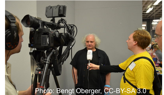
Using the video camera for an interview at the Gothenburg Book Fair.