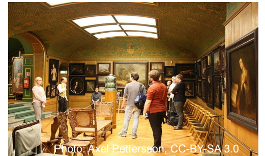
The art gallery at the Hallwyl museum.