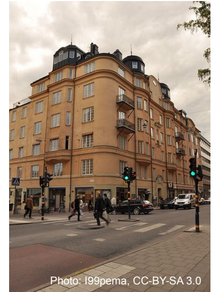
Our office in Stockholm.