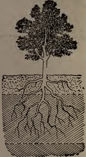
How a Tree grows on Dynamited ground.

Our modern Dynamite Farming methods hasten the growth, increase the quantity, and improve the quality of Fruit, Lucerne, Vines, Vegetables, and all kinds of Crops.