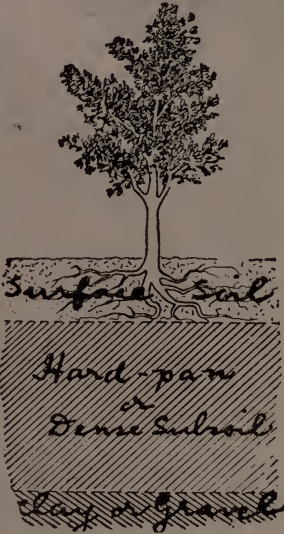
How a Tree grows on ground not Dynamited.

Our modern Dynamite Farming methods hasten the growth, increase the quantity, and improve the quality of Fruit, Lucerne, Vines, Vegetables, and all kinds of Crops.