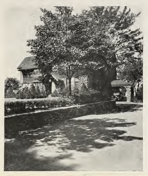
These Maples Provide Cool Comfort on Hot Days