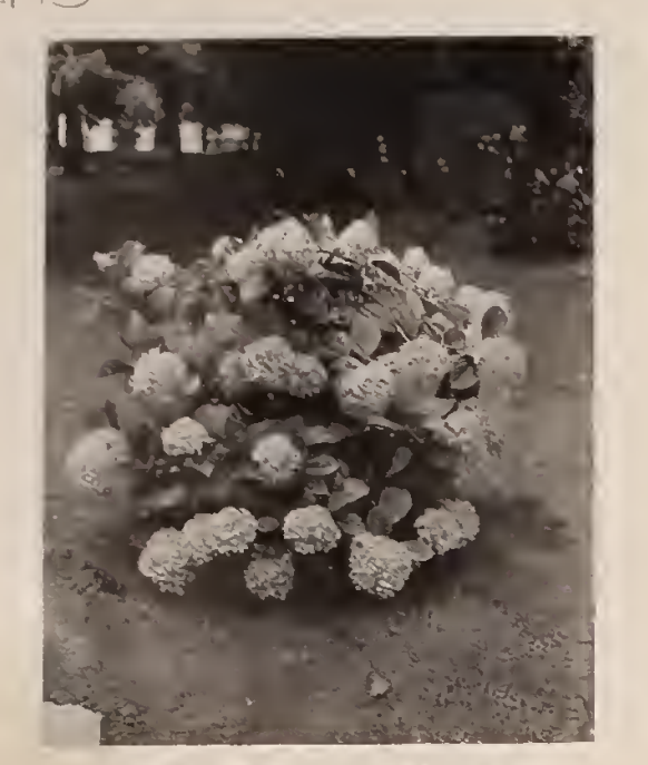
Hydrangea Blooms in Mid-Summer