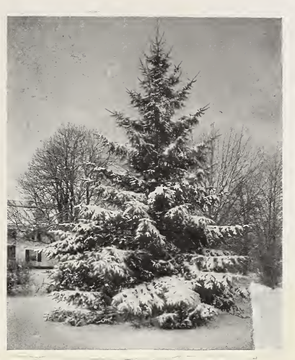
This Beautiful Norway Spruce Brightens Winter Landscape