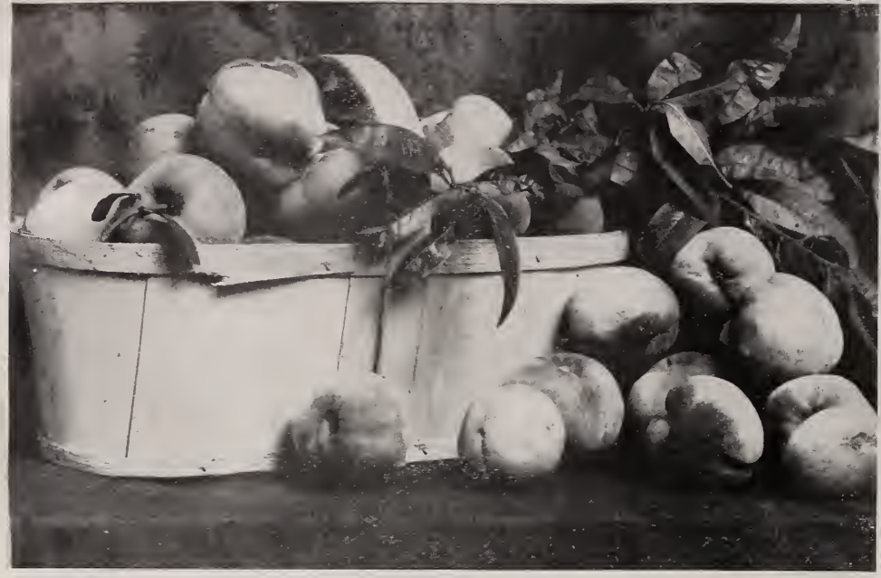
Why Not Taste the Joy of Picking Peaches from Your Own Trees