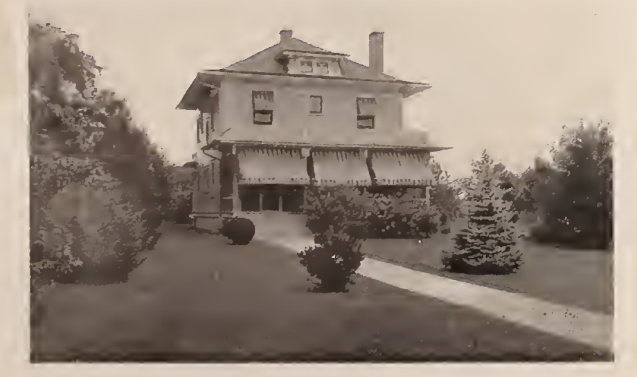
Planting can be made to express idens—dignity, friendliness, reserve, etc. Study the examples shown here to see how the results you admire were obtained.