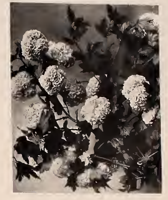
show vall Tyrburnum, Delie Dig Clusters

made. Then refer to Barnes Bros. Catalog to determine exact varieties and sizes you desire. If in doubt, send us your plan and tentative list; we will help you to complete the list. Start early so that you can get your order in well ahead of planting time.