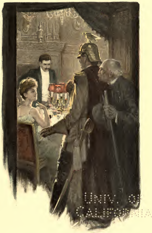
At sight of her the Emperor stopped on the threshold