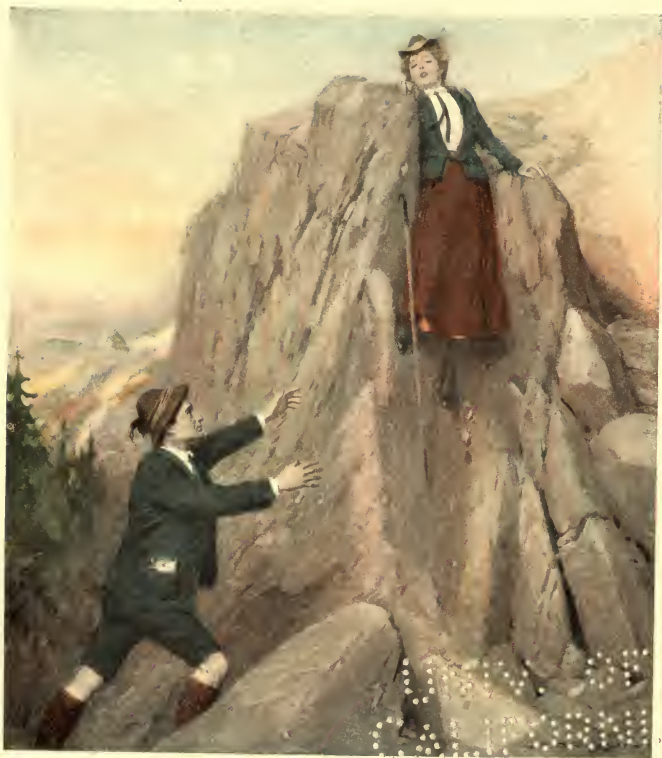
She lost her scant foothold, slipped, tried to hold on, failed, and slid down the rock