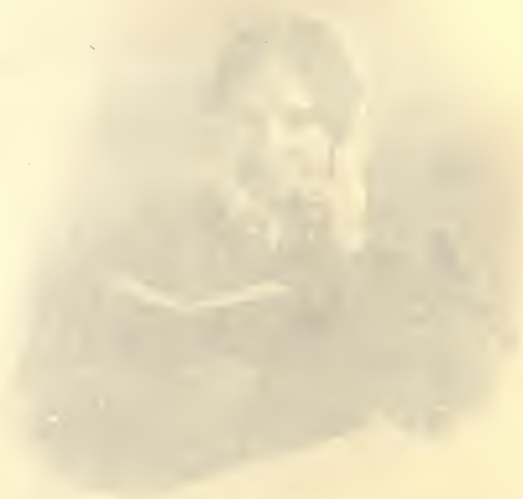
Lydia Maria Child