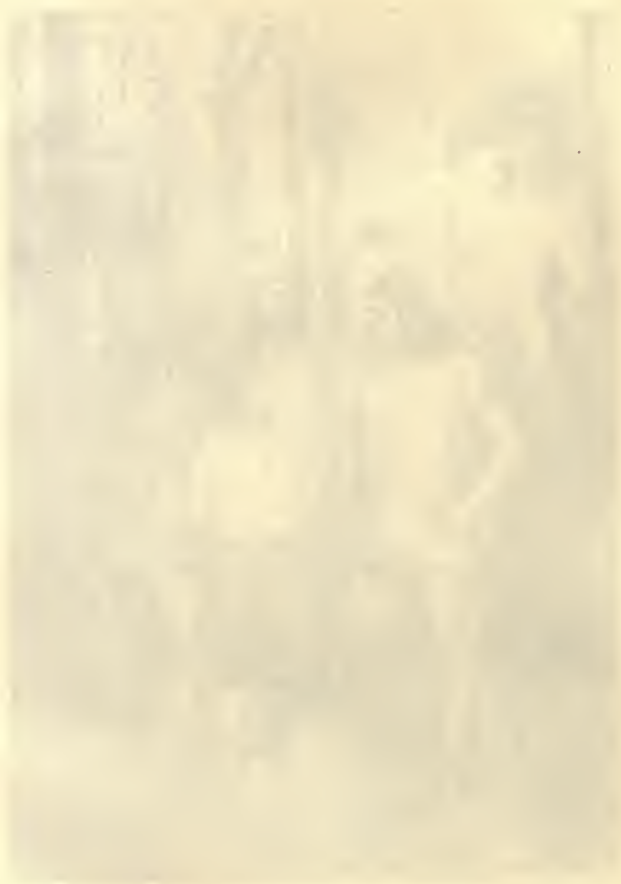
The Boy Captives