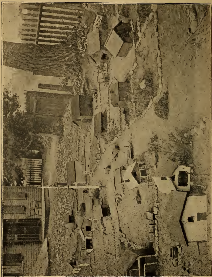
THE SAND PILE.