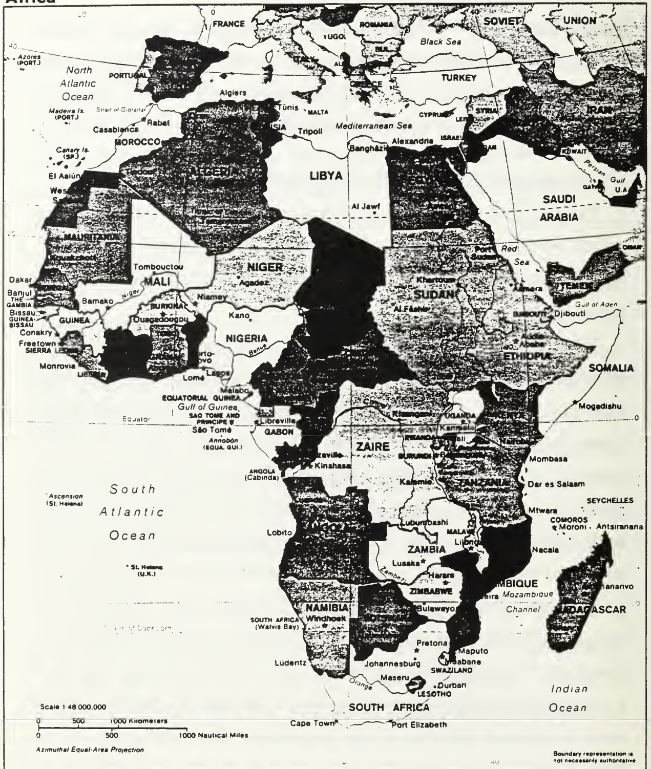
Figure 1. Map of Africa—Strategic Choke Points