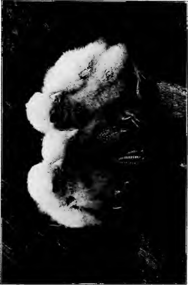
YOUNG SPARROW HAWKS