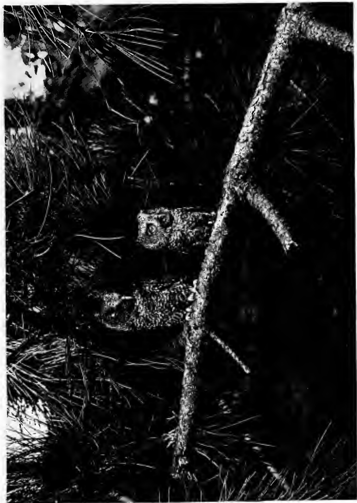
"BILLY" AND "BETTY"