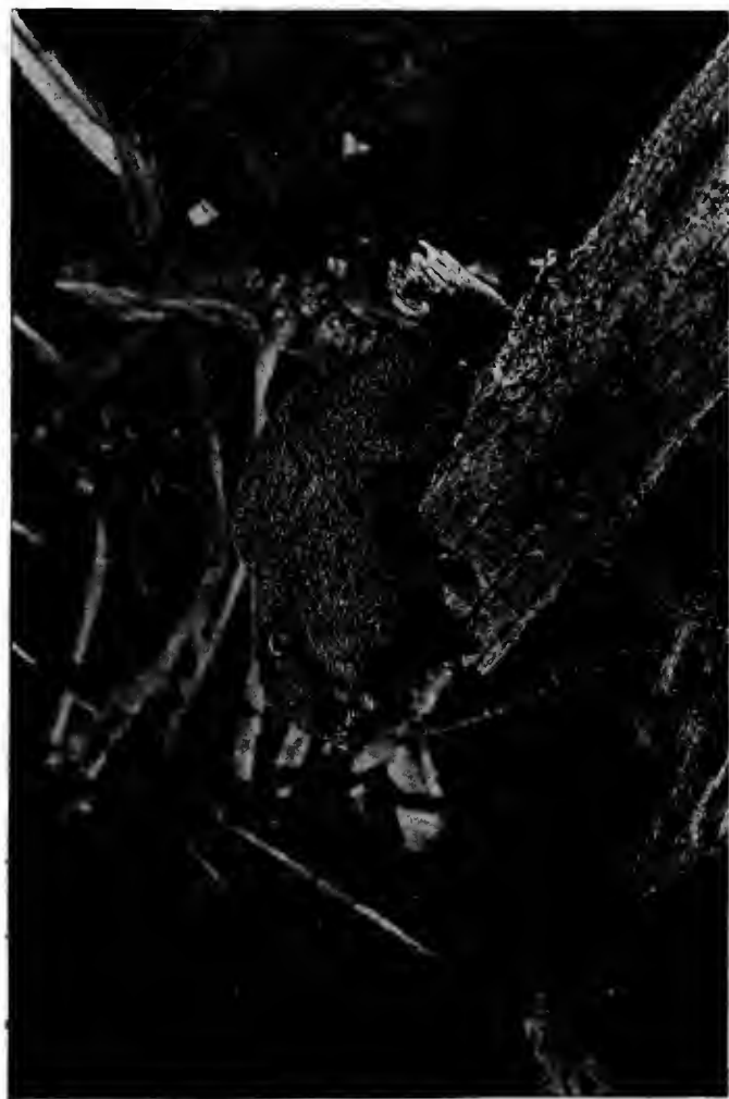
THE MOTHER WOODCHUCK ON THE FENCE