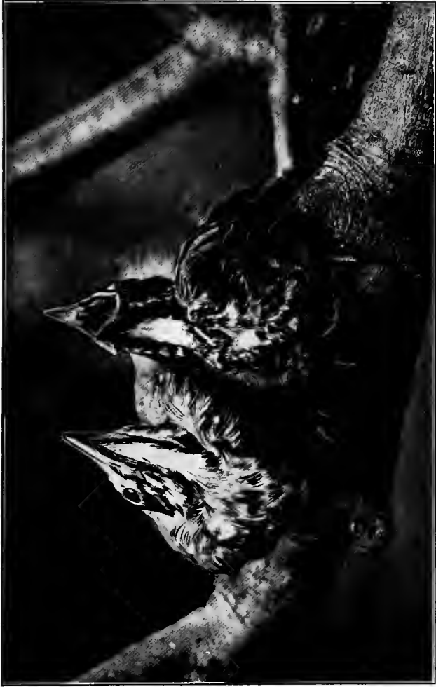
YOUNG ROBINS THIRTEEN DAYS OLD