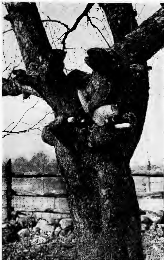
IN THE ORCHARD