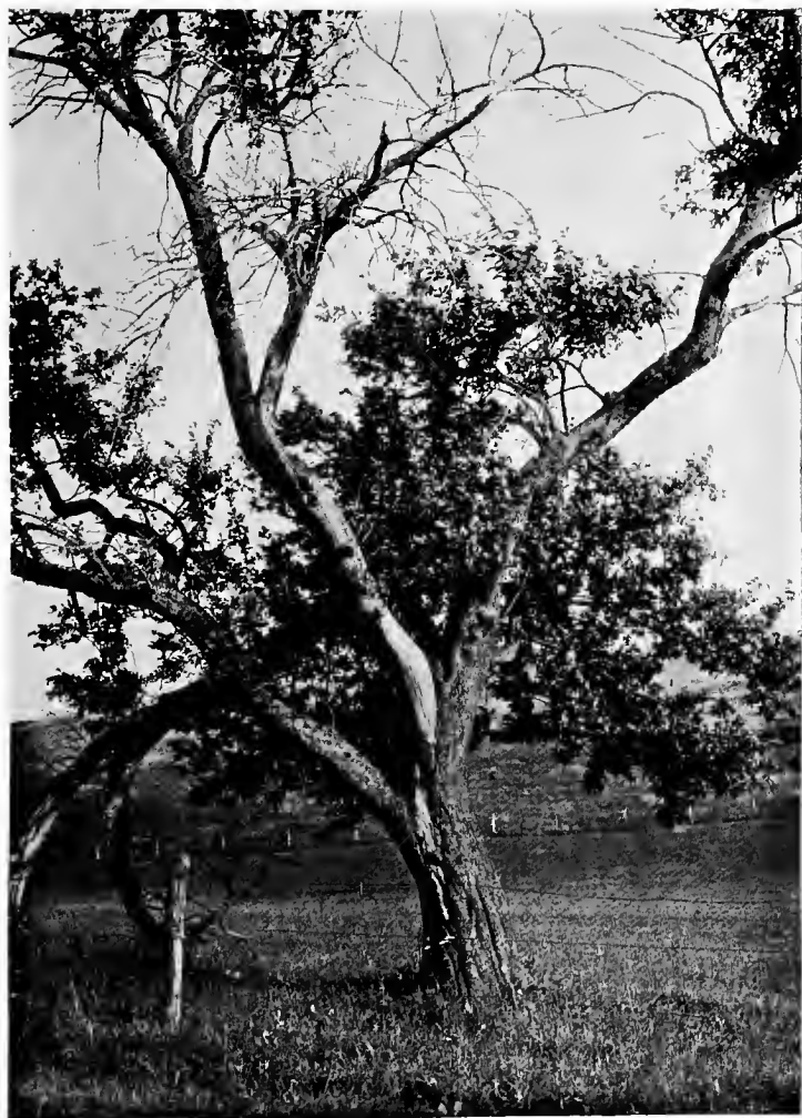
THE BLUEBIRD TREE