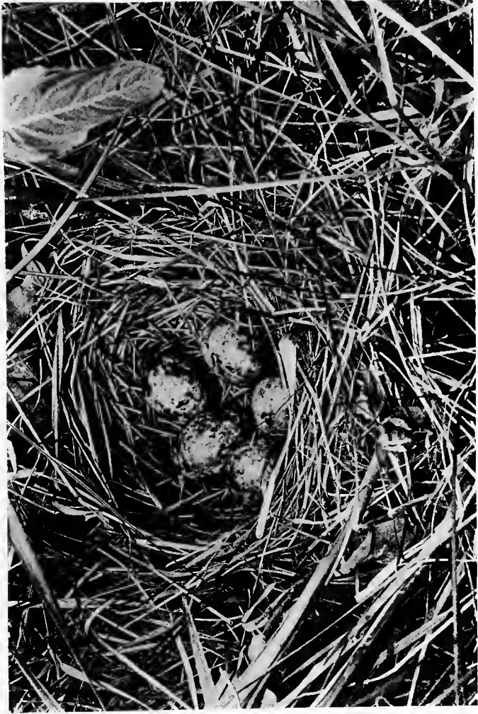
NEST AND EGGS OF THE BOBOLINK