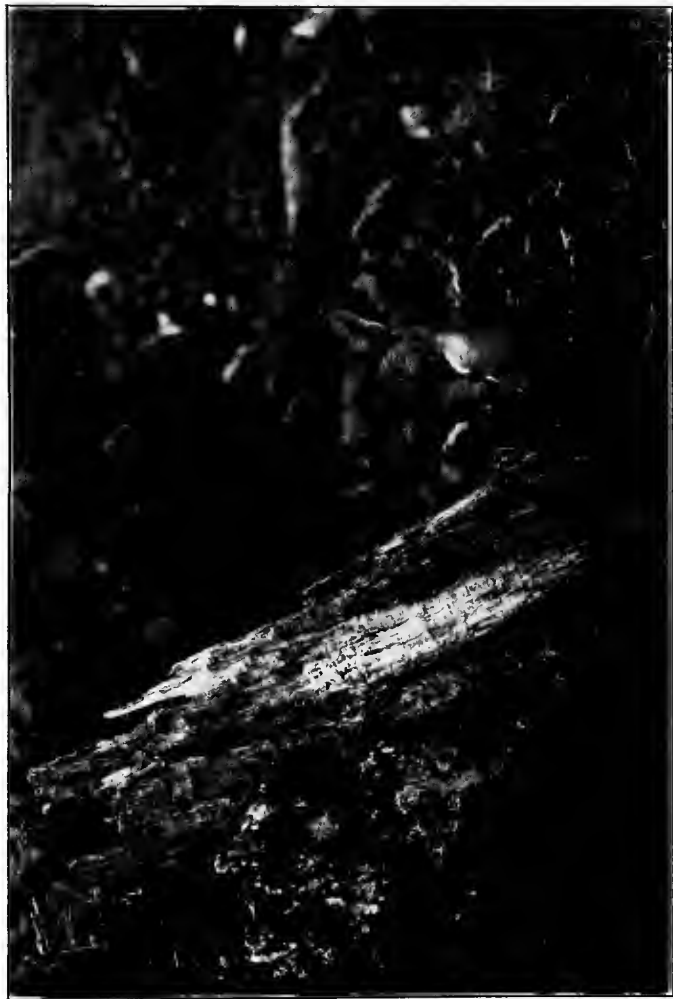
AN INTERESTED FOX