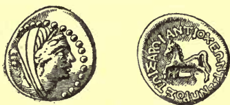
FIG. 7.—No. 85.

Fig. 7. British Museum. Bronze. Wroth, Num. Chr. , 1904, p. 305, No. 27.