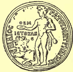
FIG. 2.—Coin of Magnesia, with figure of Themistocles.

The type is a nude figure, identified by an inscription as ΘΕΜΙΚΤΟΚΛΗΣ, standing to l.; his l. hand grasps a sheathed sword which hangs at his side; in his r. is a phiale, with which he pours a libation over a lighted altar. In front of the altar is seen the forepart of a slaughtered bull.